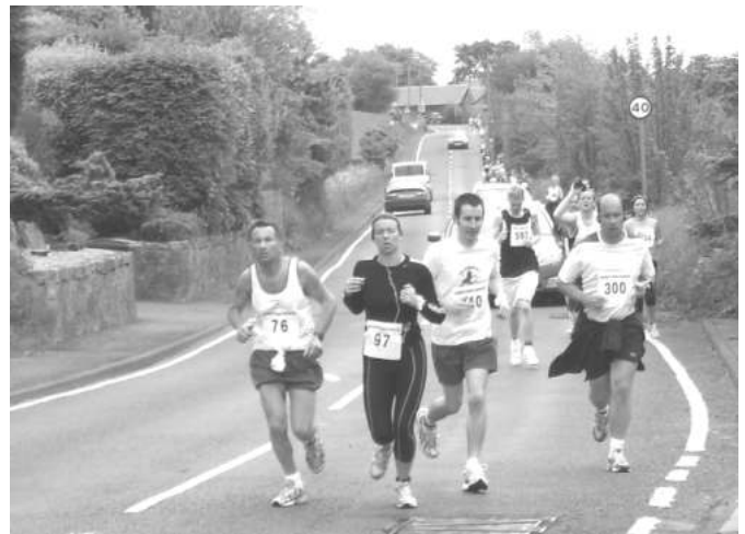
Half Marathon runners between Scott and well and Kinnesswood