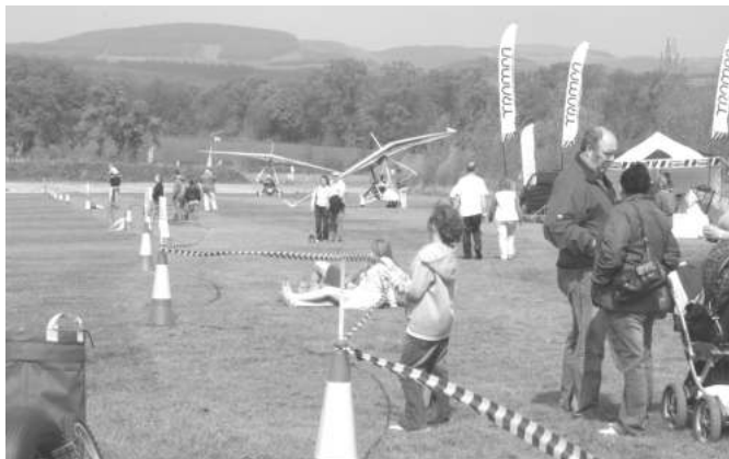
Scotland's first wind festival at Balado last year

Last year's wind festival, held at Balado, home of T in the park, attracted 150 participants with over 500 members of the public enjoying free access to watch the fun. It brought together kilters, manufacturers, distributors and clubs along with micro lights, air cadets and members of the public.