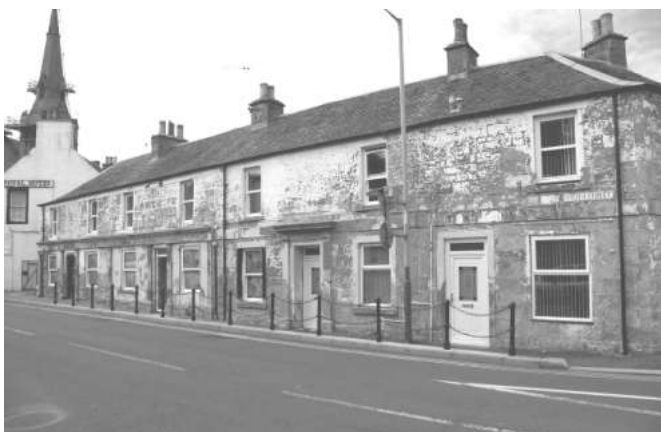
2-8 South Street, Milnathort on 21 May 2008

Planning matters: The following applications were noted: extension to house at 20 Auld Mart Road; erection of five houses and garages, formation of access road and associated site works on land at Old Perth Road; formation of car park and pedestrian entrances at Balado Activity Centre.