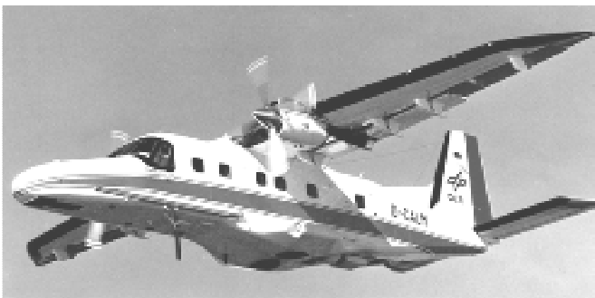
The airplane operated by the National Environmental Research Council that the researchers have been using to measure blue-green algae in Loch Leven.

Blue-green algae are microscopic organisms that grow in lakes throughout the world. Like many of Scotland's shallow lowland lochs, Loch Leven is affected by this type of algae from time to time. The problems posed by blooms of blue-green algae on Loch Leven have been well-documented in the past, and residents of Kinross and the surrounding area will now be familiar with the signs warning of blue green algae that are displayed by the local council every summer. Over the past 20 years, there has been a concerted effort to reduce blue-green algal blooms at Loch Leven, especially by decreasing nutrient inputs from sewage works, local industry and agriculture.