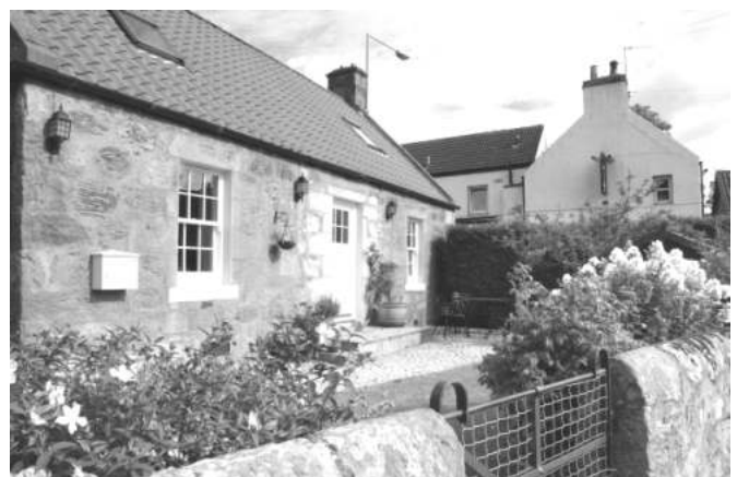
The 2008 Best Kept Village Competition has now been launched!