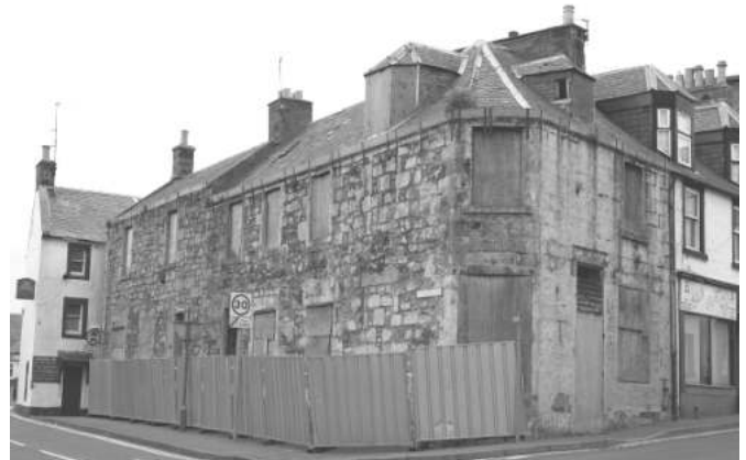
Swansacre building: should be on the market again soon...