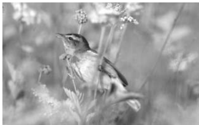
The Sedge Warbler - a summer migrant to Loch Leven

It's great to welcome back the summer weather and it seems to have breathed new life into the NNR. More visitors than ever are using the Heritage Trail. There is plenty of action on the loch with resident duck broods afloat, fishing boats back in the water and Ospreys overhead. Other summer migrants to look out for include the Sedge Warbler, Willow Warbler and Whitethroat, all of which you will find in the scrub and woodlands around the loch shore.