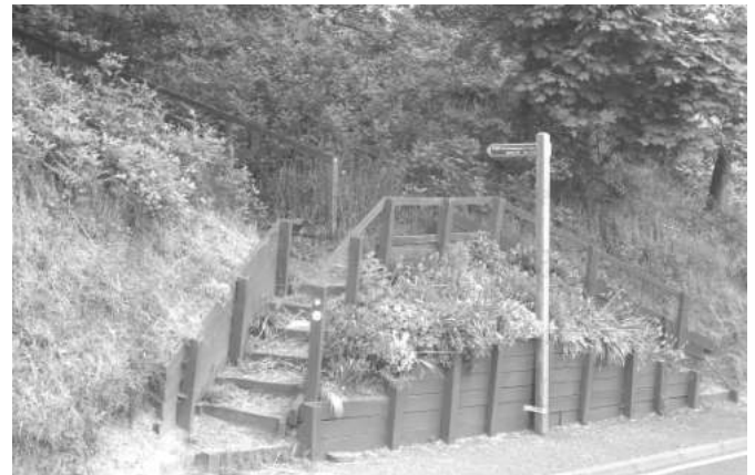
The path to Kilmagadwood, Scotlandwell

The Woodland Trust Scotland is hoping to extend the woodland at Kilmagad. This would enlarge the core area of existing woodland at Kilmagad, making it more ecologically robust, whilst supporting wildlife such as the great spotted woodpecker and ancient woodland ground flora such as the native bluebell and wood sorrel. To achieve this aim, the Trust is looking to acquire five hectares of land, and needs to raise £70,000 to fund this.