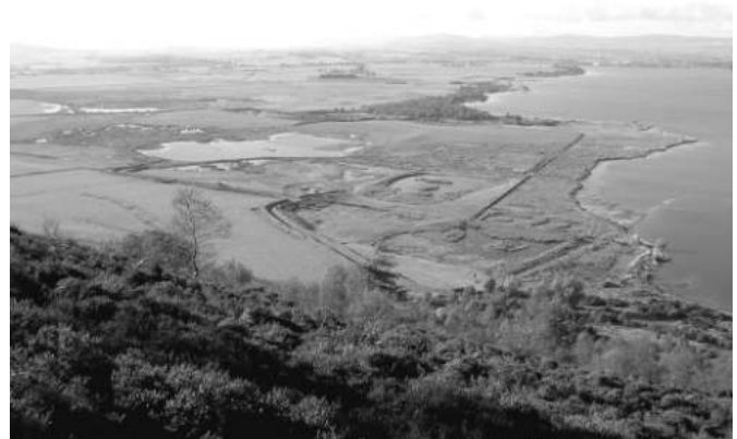
The western end of Loch Leven National Nature Reserve

Loch Leven NNR: Email received from SNH regarding Loch Leven NNR Plan for People 2008 - 2012. Draft plan attached for comment and suggestions by mid May.