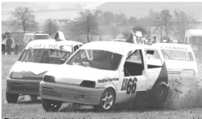
Thrills and spills abound at Autograss non-contact car racing events!

For those unfamiliar with the sport, Autograss is non-contact car racing that takes place on an oval 440 yard track on a natural soil surface (a field). Due to the close nature of the racing, thrills and spills are never far away. Racing takes place in the various classes with up to 8 cars starting on a straight-line grid and racing over short 4-8 lap races. Event start times and engine noise are strictly controlled and limited.