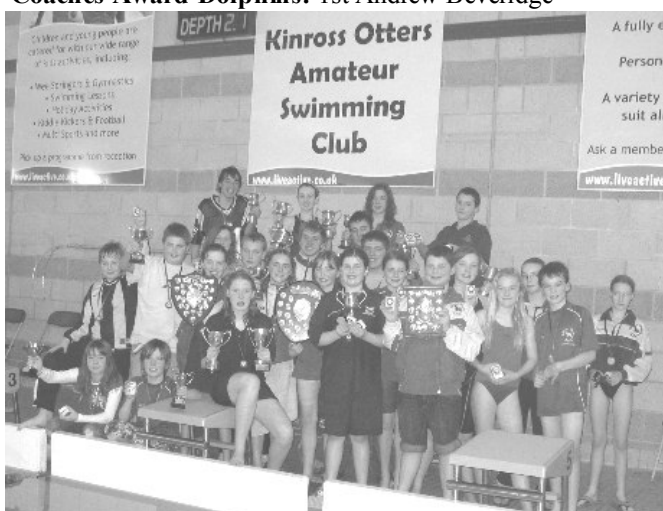
Kinross Otters proudly show off their trophies!