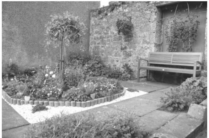
This year you can look forward to seeing the historical tiled map of the village in the picture garden

We plan to keep you up to date with our progress, so please check the village noticeboard for the latest KiB news. We are working on a few interesting new projects this year and will update you on those as plans progress.