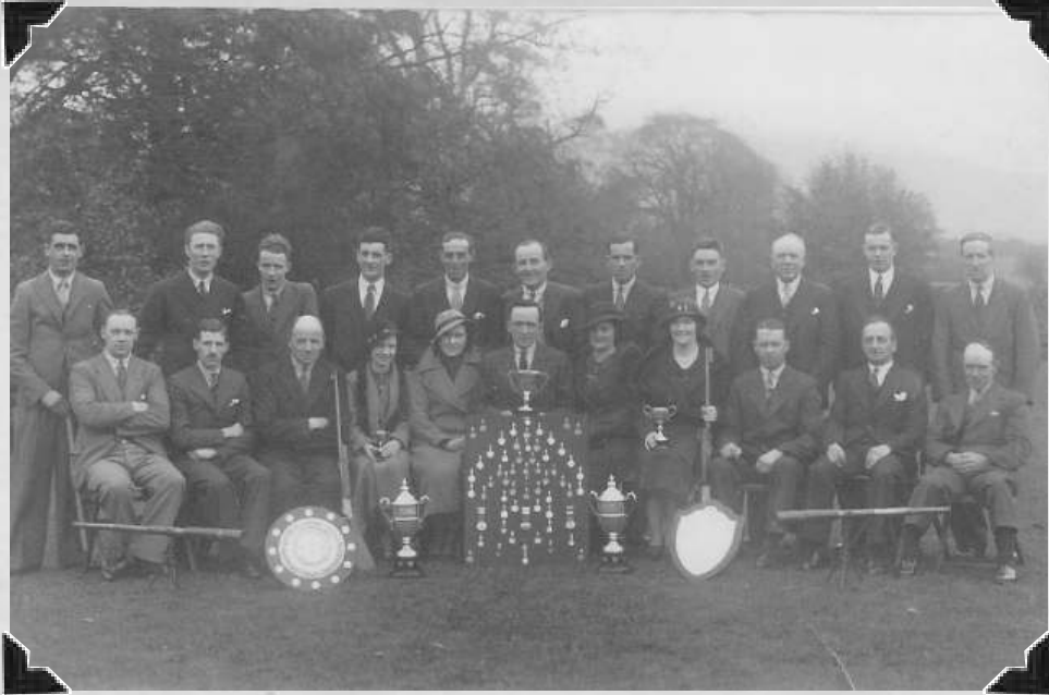
Kinross & Milnathort Rifle Club, c1930s?