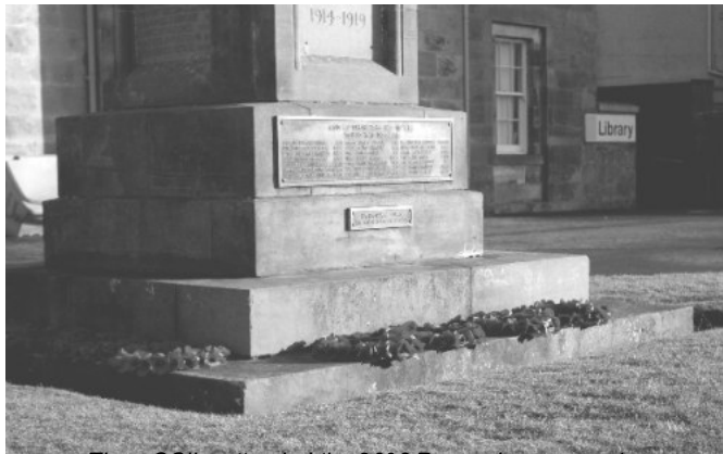
Three CCllrs attended the 2008 Remembrance service