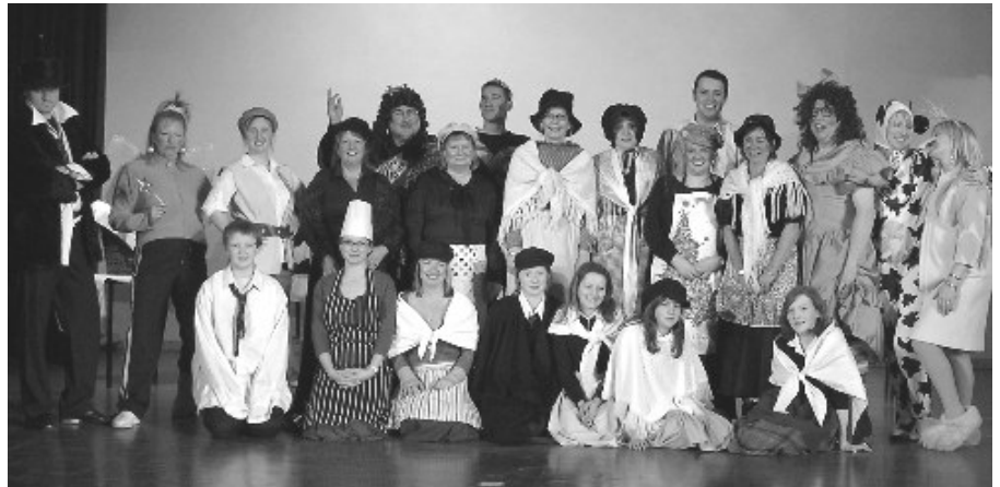
Kinross High School staff and pupils make ready to wow their audience with their performance of "Jack and the Beanstalk"