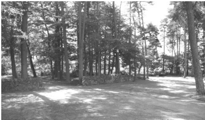
Burleigh Sands car park - valuables should not be left in cars