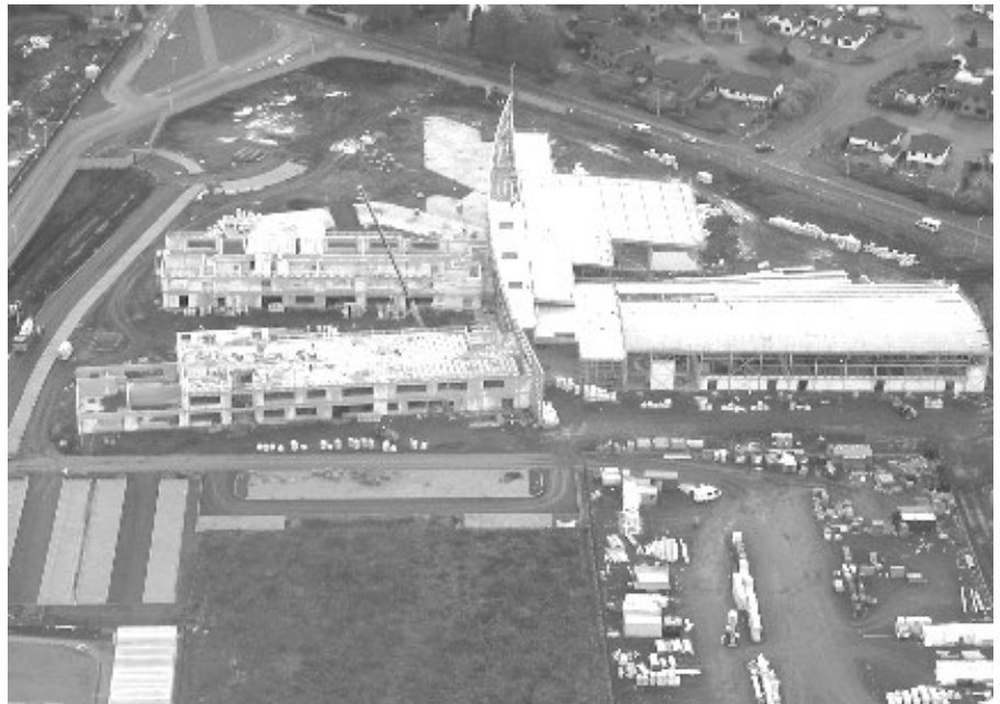
Loch Leven Community Campus, November 2008

Facilities available will include meeting rooms, sports pitches and halls, music rooms, craft rooms and much more besides. So whether you are planning a wedding, film night, birthday party, Burns supper, football tournament, craft fair, dance class or bridge club, the new campus could provide the perfect venue.