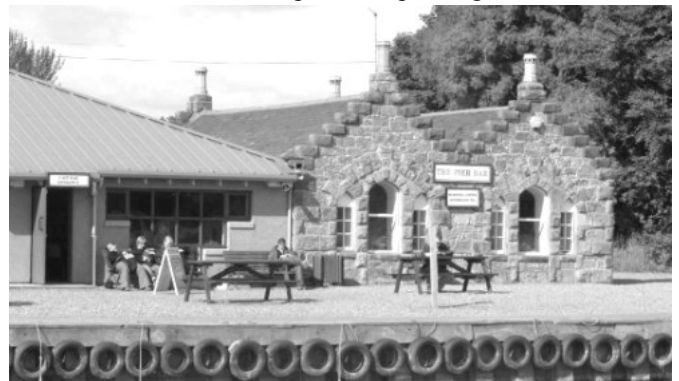
The Boat House at the pier - potential new site for Tourist Information

Tourist Information Office: This office is to be removed from the County Buildings which is proving inadequate. Other sites have been considered, with the Boat House at the Pier being a possibility. New signage would be put in place and, possibly, road repairs. The Office would be signposted from the Motorway. It was also noted that the name has been changed to Visitor Information Centre. The office would not be officially manned, but would be operated along with the venue's own business in a partnership arrangement.