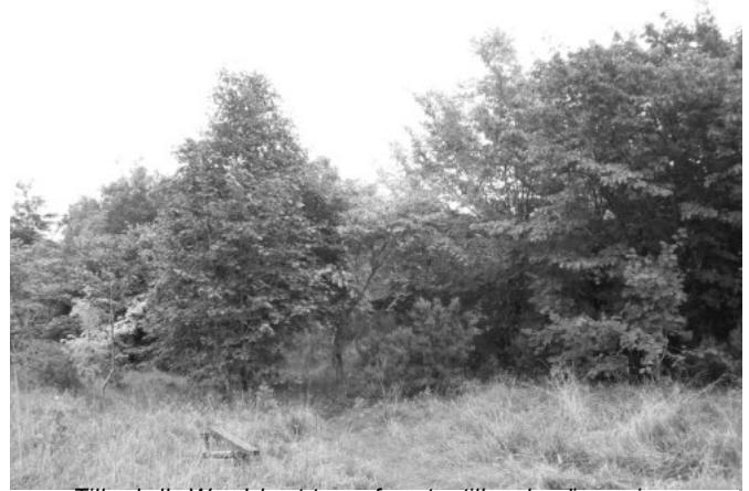
Tillywhally Wood: best type of seats still under discussion

Seats at Tillywhally Wood: There was a discussion about the best type of seats to install at Tillywhally Wood, which will be paid for with the help of Kinross Road Runners. CCllr Bennet will explore the most practical options.