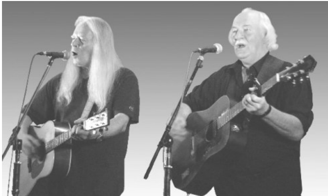
Gaberlunzie will be at the Milnathort Festival

Telephone: 07876292884 Web: www.milnathort.info