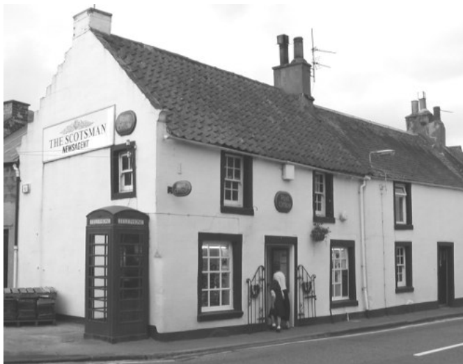
Kinnesswood Phone Kiosk is to be discontinued

There is a hold up in finalising the land for the footpath alongside the A911 between Woodmarch and the Church. All the land has been acquired except for the land belonging to the Church. The CC will pursue the possibility continuing with the path up to the boundary with the church and providing a crossing at the A911 at this point.