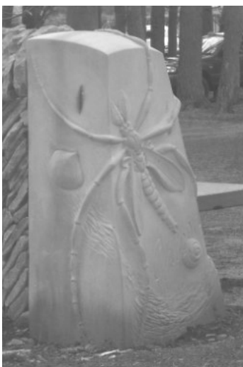
The beautiful chironomid (or midge, to you and me!) carving at Burleigh Sands gateway

A new small viewpoint has been constructed in RSPB land between Vane Farm and Findatie on the southern part of the trail. It will contain two oak curved benches with heritage text inscriptions and affords a lovely peaceful view over St Serf's island. The benches are again being fabricated by Patrick Green and he will also produce one final work that will be a semi-circular seat around the prominent pine tree on the shore at Burleigh sands. This will complete the full set of interpretation features that have been designed to