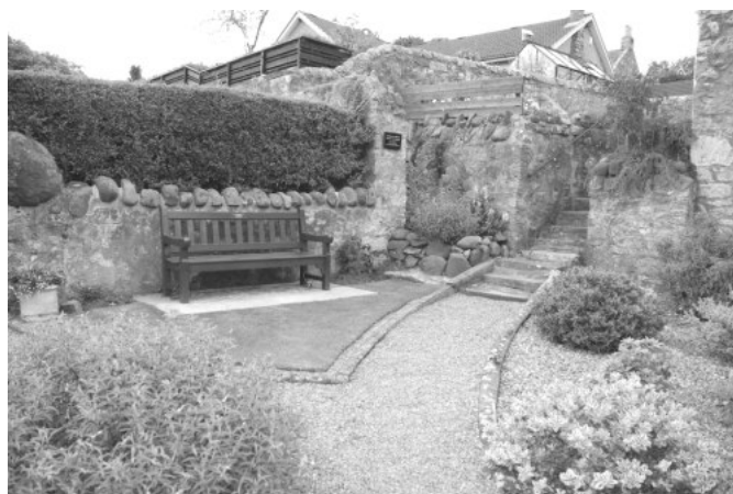
The garden at Michael Bruce's Cottage, Kinnesswood, maintained by Kinnesswood in Bloom