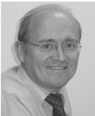
Ochil & South Perthshire MP Gordon Banks

In what has been a bitterly cold winter this year, the MP was surprised that the South Perthshire part of his constituency only met the necessary criteria to trigger cold weather payments once between November 2008 and 7 January 2009. Monitoring temperatures in large parts of the Ochil & South Perthshire