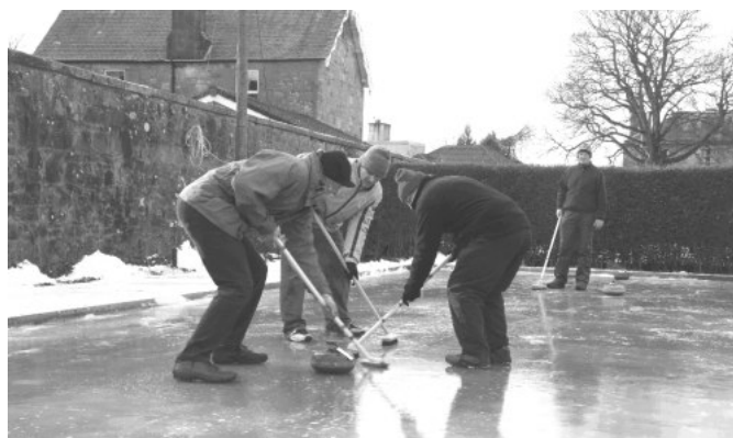
The recently refurbished outdoor curling pond