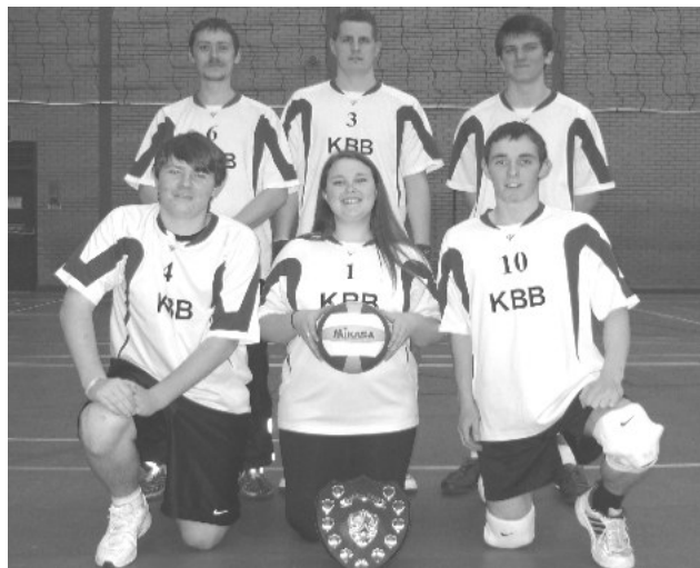
Perth Recreational League Champions Kinross BB with the league trophy