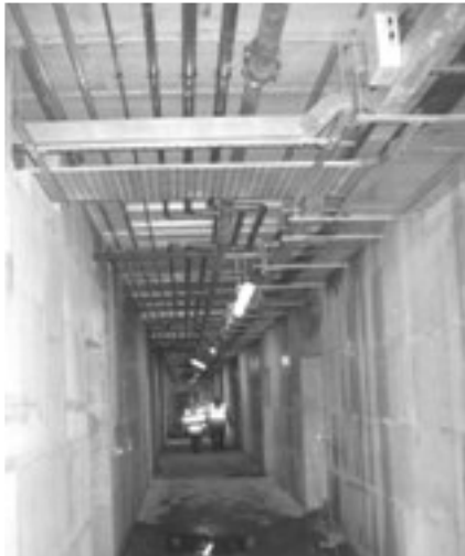
Ducting and electrical services - part of the "first fix"

The external envelope is progressing with brick wall cladding to the main curved walls, and box outs/flashings to accept the external render system.