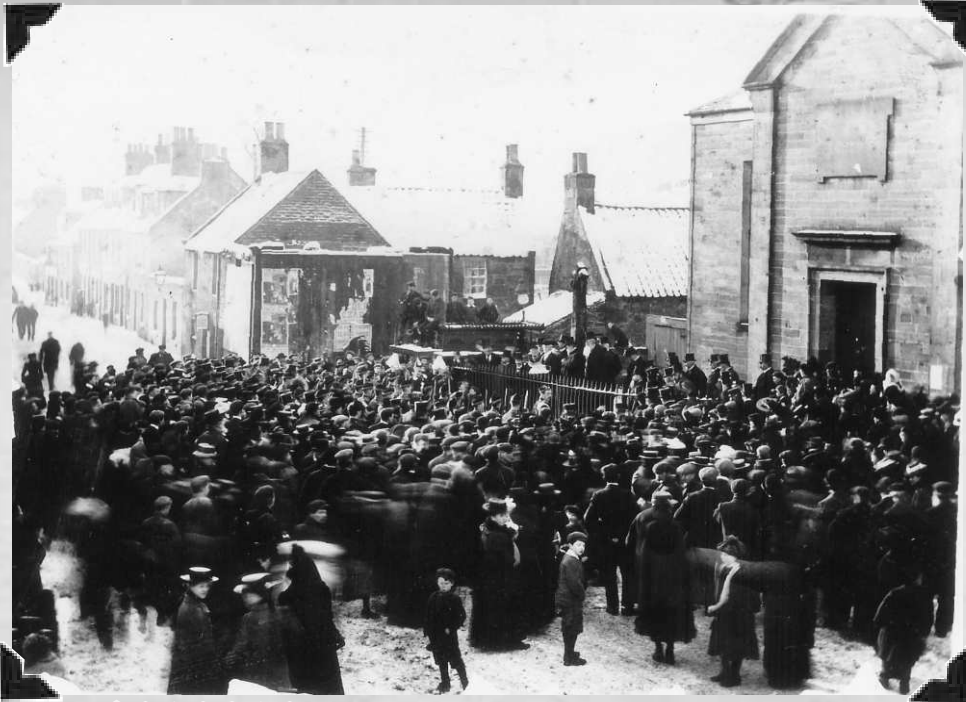
Proclamation of the accession of King Edward VII, Kinross Town Hall, 1901