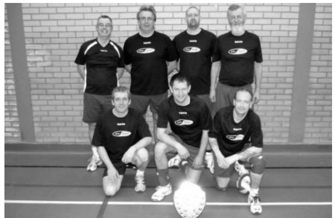
The victorious Kinross Scotrange team

The Club is now preparing for the Scottish Open Volleyball Tournament on Perth's North Inch over the weekend of 23 & 24 May. This year sees the Scottish Open reach the 25-year milestone and teams are travelling from Germany and the USA to compete in this year's competition.