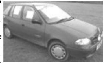
The Subaru Justy

As if driving 10,000 miles on rough terrain in bangers wasn’t enough punishment, four members of the team will be attempting the Edinburgh “Hairy Haggis team relay” which runs alongside the Edinburgh Marathon on 31st May!