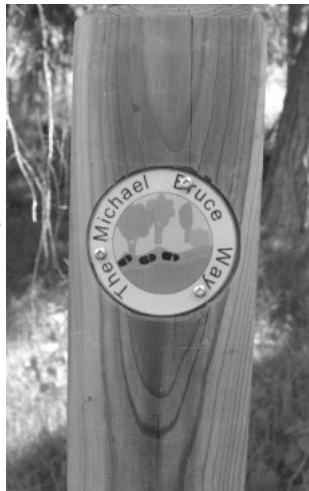
The Michael Bruce Way - discussed at Paths Group.

Post meeting note. P&KC Roads have responded with the following information: Work on the traffic islands is due to commence in Scotlandwell on Monday 23 March and is expected to last 7 or 8 working days. P&KC may delay the work in Kinnesswood several days to coincide with the April holidays to minimise the disruption to the Primary School. The anti-skid surfacing along the A911 is still programmed for next week at Wester Balgedie, Scotlandwell and Auchmuirbridge. P&KC's original intention was to install buff coloured anti-skid surfacing in Scotlandwell at the junction of the A911 with the B920. P&KC have been in consultation with the Conservation Officers in the Council. As part of Scotlandwell is being considered for a conservation area, they did not think that buff was the most appropriate colour, and have asked P&KC Roads to apply dark grey material instead.