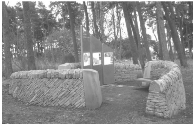
Gateway to the Loch Leven Heritage Trail at Burleigh Sands

A lovely walk, a lovely treat A welcome place for many feet The path is clean and very even So much to see around Loch Leven Thousands of geese have all been protected For certain the wildlife has not been neglected Thanks to the architect for this trail For sure it's a winner and cannot fail Whether walking, cycling or out for a run It's so relaxing and so much fun Tis 12km long from Kinross to Vane Farm But take it steady and you'll come to no harm To walk the whole footpath is so much harder Suggest you have a break at Loch Leven's Larder