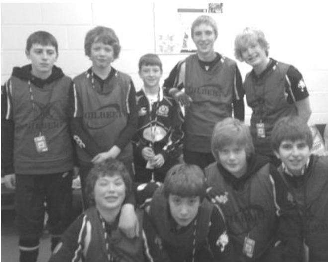
The Kinross Cougars ball boys