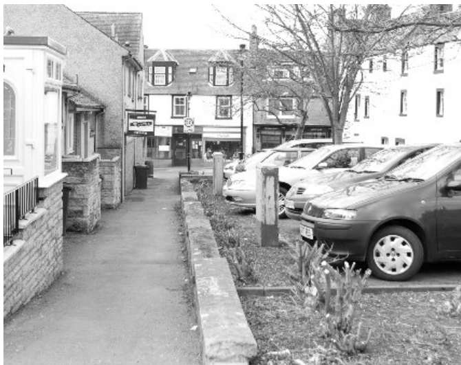
Avenue Road: vegetation cut back following requests from householders