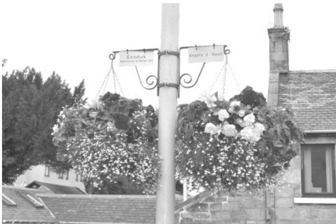
Kinross in Bloom brighten up the town with flowers every year