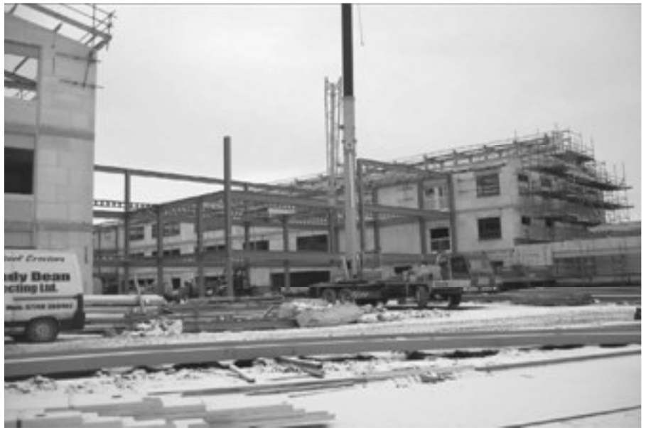
View towards the "linked bridges" between zones 3 and 4

Internal works at present include mechanical and electrical services first fix with fire alarm cables and ductwork to the games area. Intumescent (flame retardant) paint is being applied to steel columns and beams, and also metal stud walls and internal spray plaster in the same area.