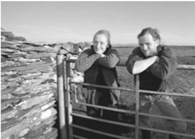
Volunteers are at the heart of the work of the RSPB

The RSPB was founded by volunteers in 1889 and today they are still at the heart of our work. Over 14,000 volunteers make a huge contribution to the RSPB. Volunteers range in age from 16 to 75+ years old, come from all walks of life and you don't have to be a bird expert to volunteer.