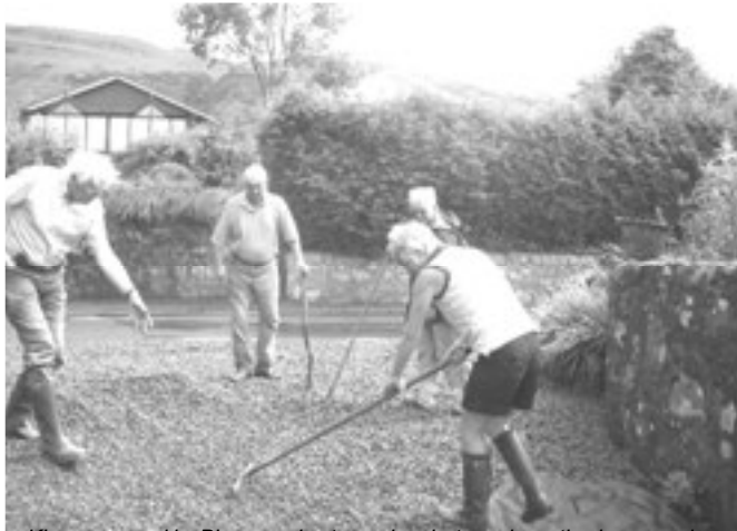
Kinnesswood in Bloom volunteers hard at work on the bee garden

“Flower power disco” - Kinnesswood in Bloom fun-raising event. Celebrate our entry into Britain in Bloom at the Lomond Country Inn, 26 September at 8pm. We value your support.