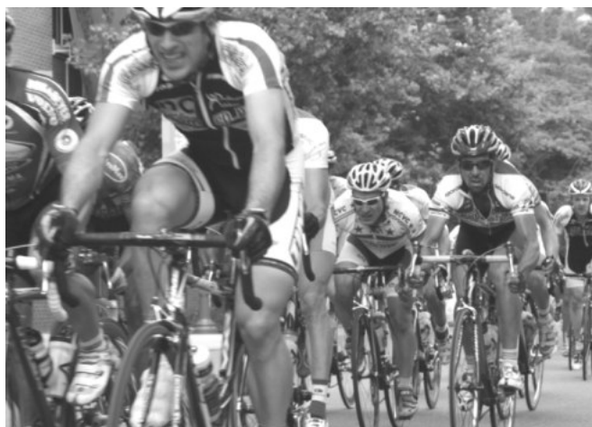
Come and try cycling on the road with Kinross Cycling Club

Find out more about KCC at www.kinrosscyclingclub.co.uk