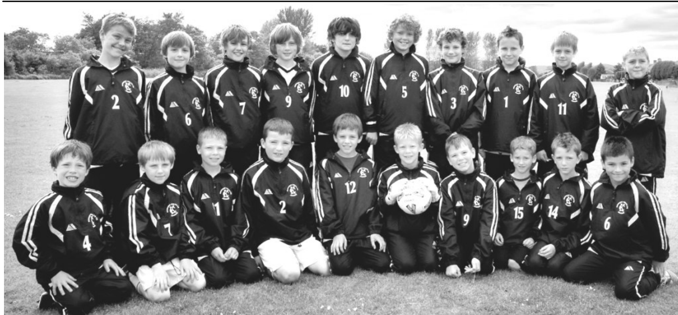
Kinross Colts football teams, who recently received sponsorship from Kinross CC