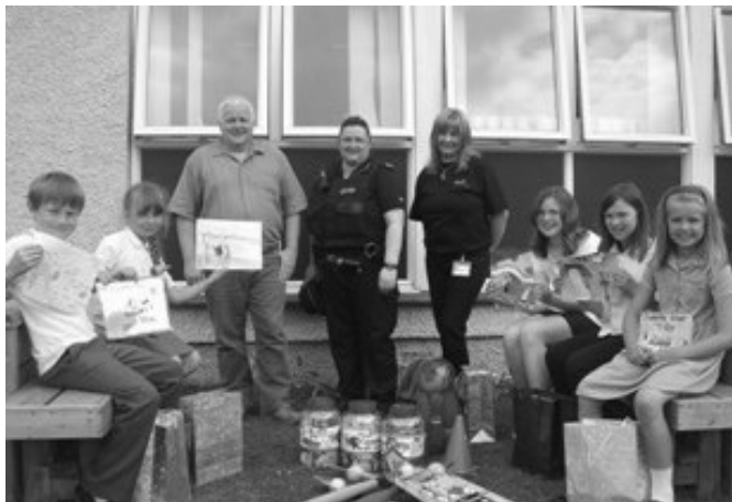
Fossoway Primary School pupils show off their posters

“Dunning Glen is a scenic area which is used every year by campers. However the problem of littering was raised earlier this year at a Fossoway CC meeting. Steps were made by Devon Angling Association to clean the area up by organising litter picking days, but the community wanted to ensure that the area remained litter free.