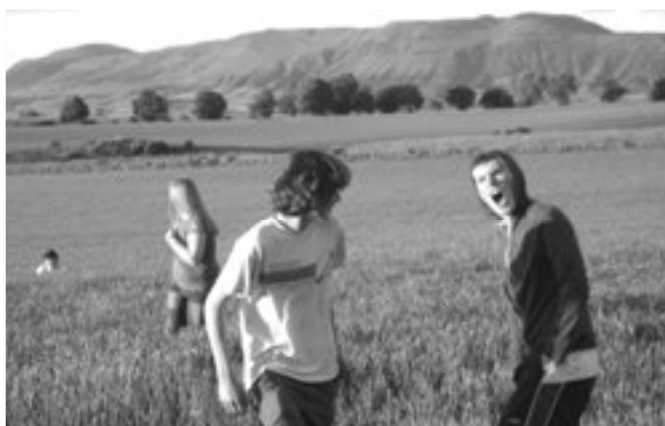
Local band Blue Fuse will be appearing at the Gazebo Gathering

Early ticket sales are very encouraging. There are, however, still tickets available – make sure you don't leave it too late!