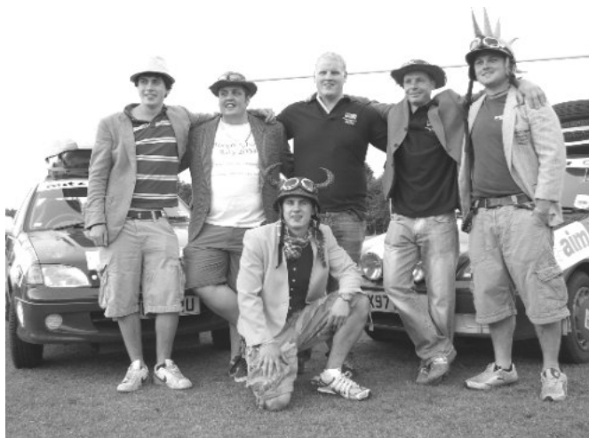
The Nutz n Boltz Team ready to roll...