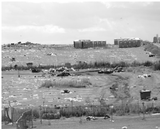
The rubbish-strewn festival campsite, adjacent to the M90, one week after the end of the festival

You can also give your point of view to the local Councillors and/or your local CC. Contacts for these are near the back of the Newsletter, on p.86.