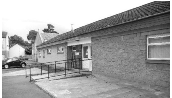
The Social Work Dept offices, Mill Street - service is likely to move to the new campus