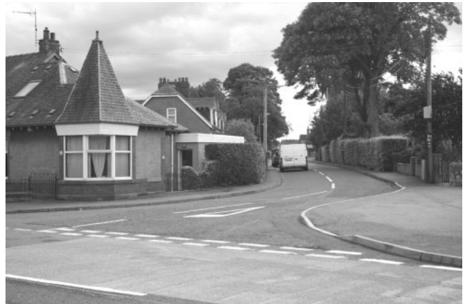
The newly narrowed junction of Gallowhill Rd and Muir

Gallowhill Road/Muir: No response has been received from P&KC to the CC's request for double yellow lines or removal of the hump.