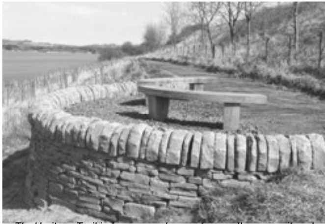
The Heritage Trail has many places where walkers can sit and contemplate panoramic views over Loch Leven