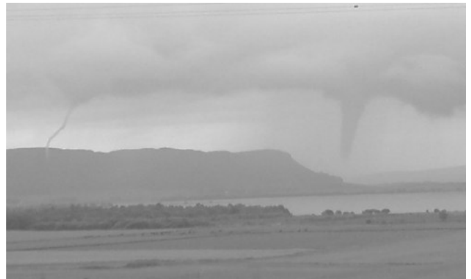
Mini tornados over Loch Leven

P&KC will meet with Milnathort CC on 31 July to give feedback on this issue.