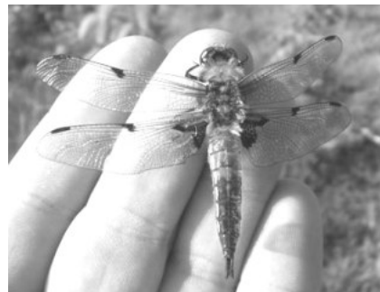
A Four-spotted Chaser dragonfly