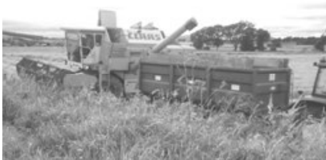
A combine harvester represents a huge investment for farmers

Memories of harvest 2008 that may have been blocked out in a bid to remain sane are starting to resurface as the new season approaches. Along with our neighbours, we faced a battle to get the grain off the field and into the shed. Ultimately everyone managed to get through the wet year and once the grain was dried and into the lorry it didn't all seem so bad. Our combines were still in one piece but the breakdowns caused by the conditions were pretty endless. A new clutch, lift pump and gearbox were required and the unloading auger was straightened more times than our 12 year old daughter's hair. At the end of the season grain prices were falling faster than shares in RBS and the price of fertiliser for next year was forecasted to rocket to £550 per tonne. It's no wonder that memory loss was the only answer.