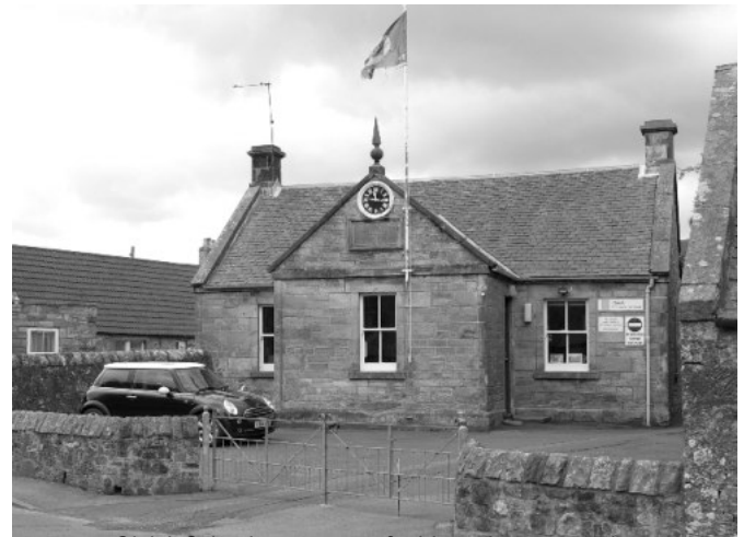
Cleish School - a source of pride to the community

Cleish School: The school is now on holiday but went out in a blaze of glory beginning with an evening of Cleish Factor. This was a wonderful evening with 19 acts participating, each as good as the other. What a wealth of talent we have. It would be invidious to single out any one, but everyone there had a good time, demonstrating that an occasion involving all ages is guaranteed to bring in the crowds. The weather too played its part, and proved there is nowhere like Cleish on a warm summer evening, with people lingering to talk to each other afterwards.