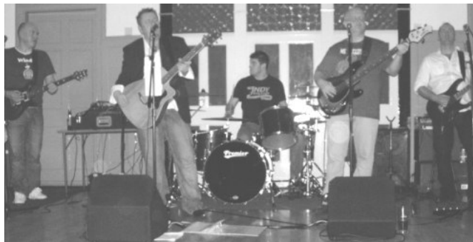
Vital Sign run through one of their numbers...

Competition – KLEO is giving away 2 family tickets – all you need do to win is fill in the entry form either on the KLEO stand at the Kinross Show or go on-line at www.kleo.org.uk