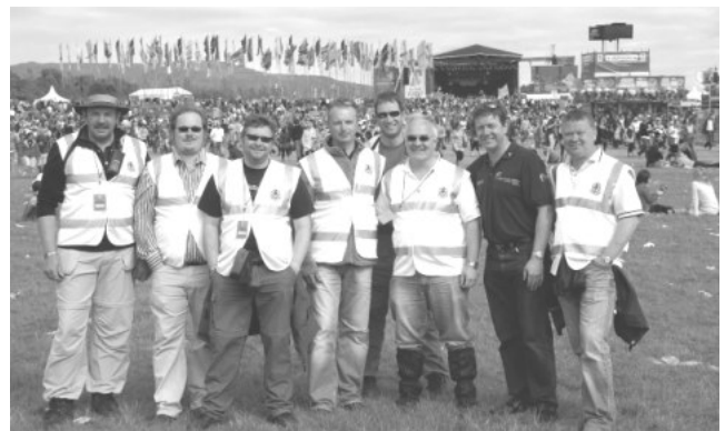
Table members and volunteers at T in the Park

Round Table volunteers ran the bottle exchange service, which allowed campers to swap glass bottles for safe plastic ones. This ensured the campsite was a far safer place, but also highlighted a few new cocktail combinations such as champagne and Buckfast.