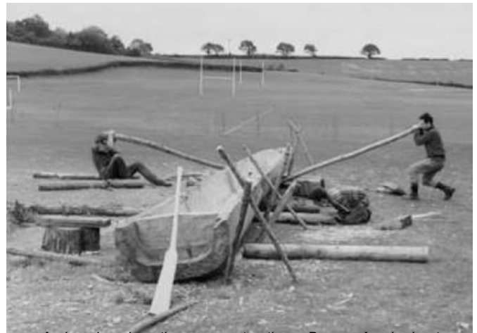
Archaeology in action - reconstructing a Bronze Age logboat