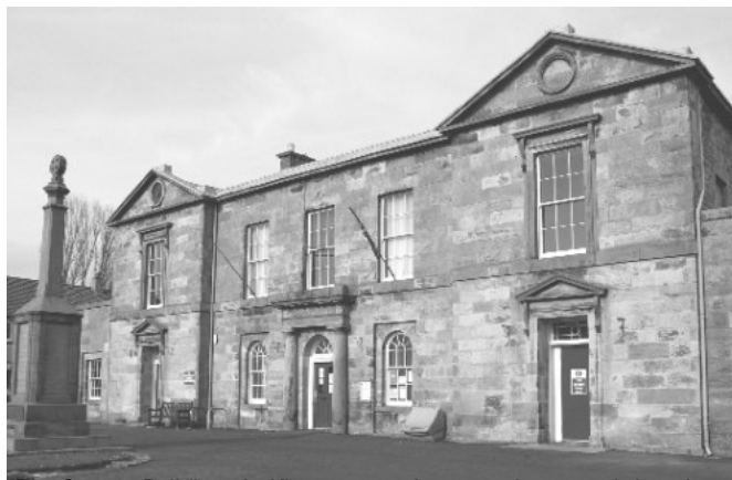
The County Buildings in Kinross – services may be moved elsewhere

The Councillor draws attention to the number of empty buildings in Kinross town centre for which P&KC is responsible, saying, "... the town increasingly has an aspect of neglect and under-funding" and is concerned that the County Buildings may join the list, in view of Council proposals to move services to community campuses (see "What Future for the County Buildings?" at left).