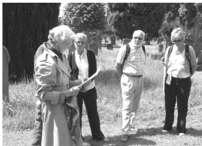
KHS members visit Greyfriars Burial Ground, Perth

The walk took in the Round House built to house Perth Waterworks in 1832, now the home of the J D Fergusson art collection. A visit was paid to Greyfriars Burial Ground where the members were shown some very interesting gravestones and given the history relating to the site and the people buried there. The early usage and development of the use of the Tay for importing and exporting a range of goods giving Perth prosperity was all explained. Some interesting buildings in Tay Street were looked at and the history relating to them given. Having crossed the Tay by the Queen's Bridge, the party walked through Rodney Gardens to see the Sculpture Trail and then recrossed the river by the Railway Bridge built in 1865 passing over Moncreiffe Island back to the starting point of the walk.