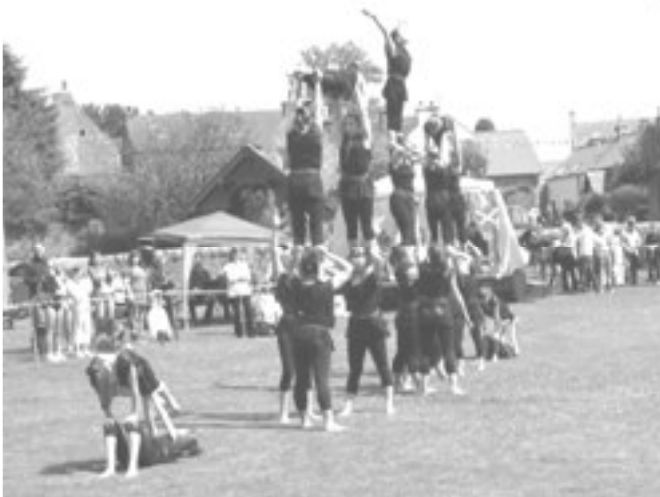
Acrobay show off their balancing skills!