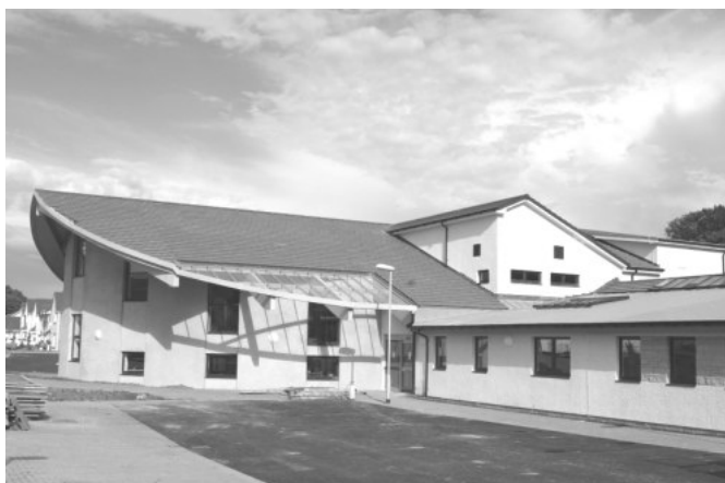
The new health centre should be opening on Monday 24 August

After 8 years of planning and a year of building, our new Health Centre is nearly complete. The contractors are scheduled to finish work on time on 31 July and we will then have a few weeks to add some fixtures and fittings, install a new phone system and move all of our computers. If this goes according to plan, the move itself will begin on Friday 21 August and we will be closed on that day . The removal men will continue moving our furniture, equipment, files and supplies over the weekend. Assuming there are no last minute problems, we will open our new doors for the first time on Monday 24 August at 8.00 am.