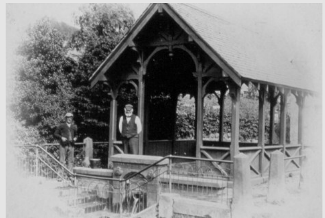
The well at Scotlandwell