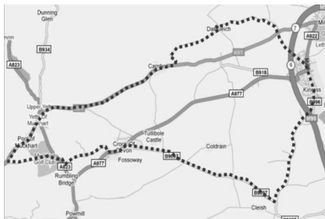
The route of the 'Give it a go' ride