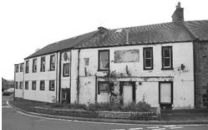
Focus Groups discussed the state of the town centre: photo shows corner of Old Causeway and Burns Begg Street