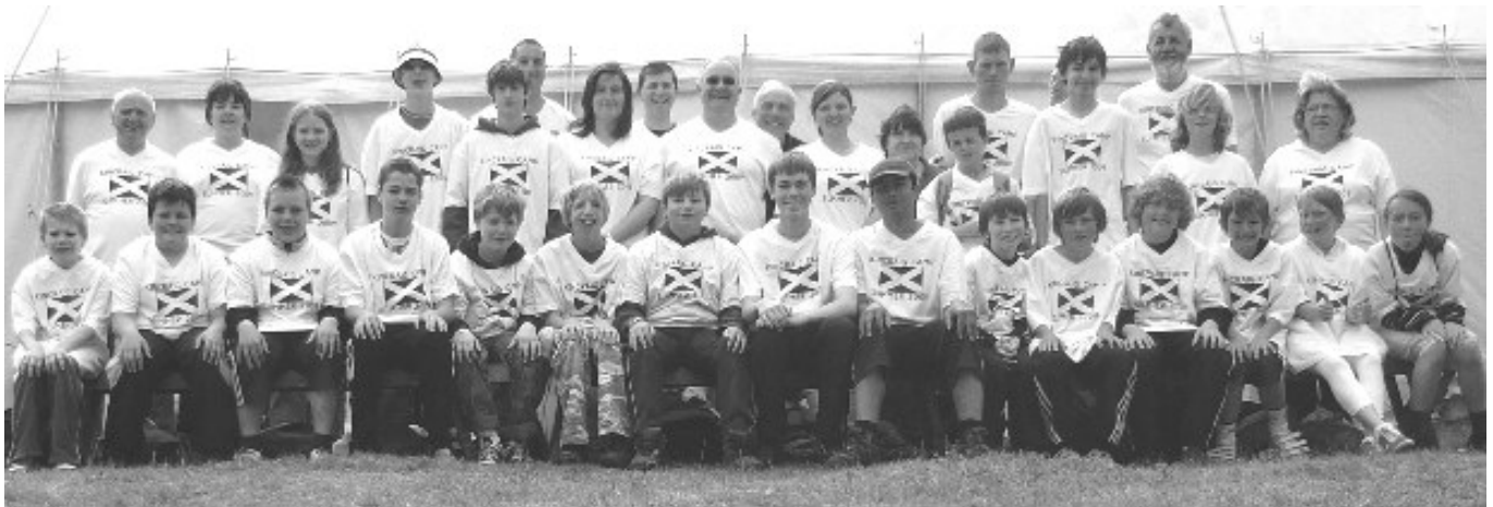
Kinross Boys' & Girls' Brigade and Kinross-shire Scouts enjoyed their adventure camp on the shores of Loch Insh