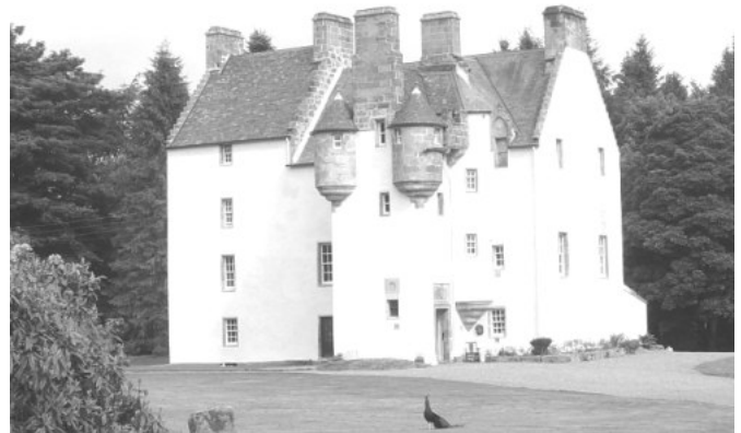
Tullibole Castle, Crook of Devon