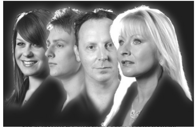
And don't forget the great tribute bands (and local talent!)

Group Discounts are available online only – buy five tickets and get one extra ticket free, buy ten tickets and get two extra tickets free. Get a group of friends or colleagues together, have fun and save some money!