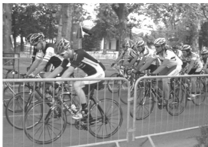
Read our online article for personal accounts of L'Etape du Tour

We don't have room to print Derek's article here, but you can read it on line at www.kinrossnewsletter.org (click on Features, then Articles Online).