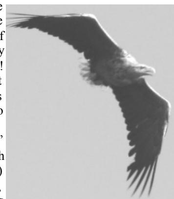
A White-tailed Sea Eagle