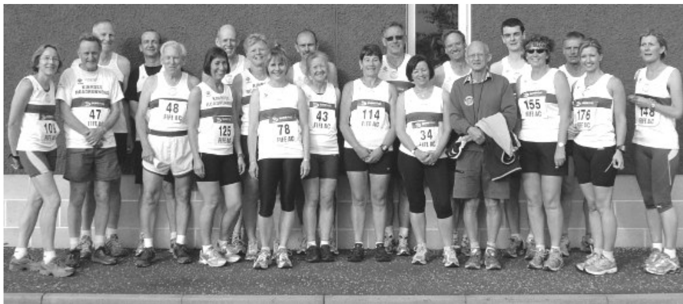
Members of Kinross Road Runners line up before the start of the Newburgh 5-mile race, July 2009.