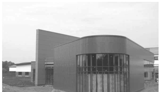
The new campus looking towards the library

See also Kinross High School news, p 46.