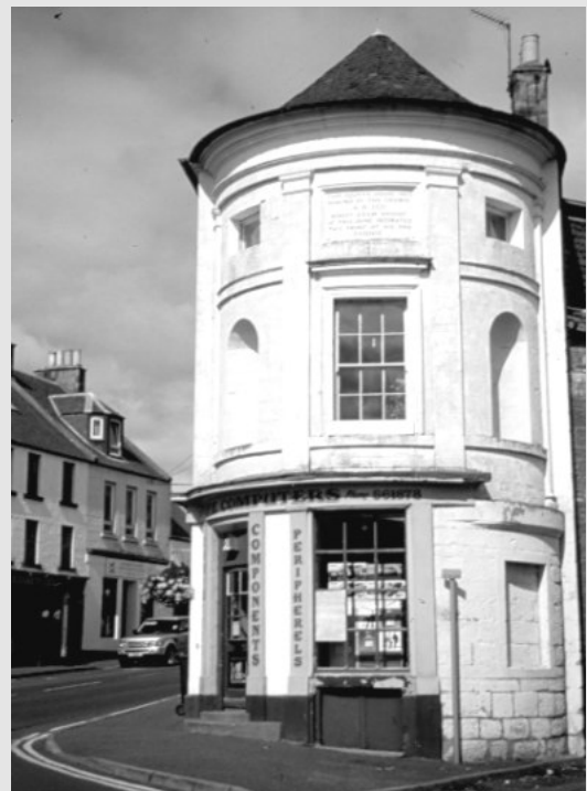
Old County Building, or Tolbooth

One of the most distinctive buildings in Kinross High Street, the three-storeyed Old County Building or Tolbooth, with its semi-circular south end, is said to have been built about 1600. Nearly two centuries later, as it says on a second floor plaque, " This County House was repaired by the Crown AD 1771 Robert Adam Knight of the Shire, decorated this front at his own expense. " Rather than create a standard gable end, the noted architect finished the building off with a three-bay bow-end that maximises the impact when viewed from the southern approach. Described as "a blatant piece of self advertisement at fairly minimal expense," the building is an expression of Adam's urban planning principles for public spaces, incorporating order, harmony, scale and unity at a key junction in the centre of the town. A statue of Robert Adam may well have been intended for at least one of the two niches flanking the central first floor window. The building's role as a courthouse, prison and centre of administration came to an end in 1826 when the neoclassical County Buildings were erected in more spacious grounds further up the High Street.