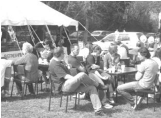
Bring your own gazebo to the Gazebo Gathering...

Our Gazebo Gathering is fast approaching and tickets are selling quickly – make sure your tickets are bought and the date marked on the calendar. Just as a reminder, our great-line up includes local bands Blue Fuse and Vital Sign, the Gary Sutherland Ceilidh Band as well as two great tribute bands of international reputation – Abbanania and The Champions.