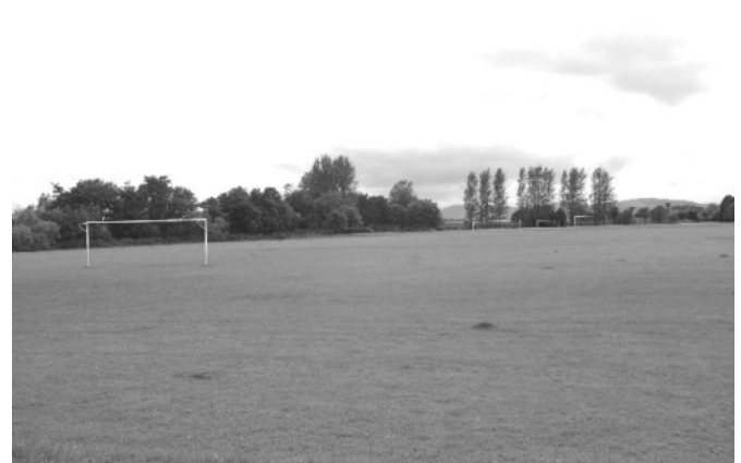
The Myre Park

Myre Park: P&KC advises that the Myre is leased by King George V Playing Fields Management Committee. In terms of pitch allocation this is left to the clubs, as no specific management agreements are in place for the individual pitches.