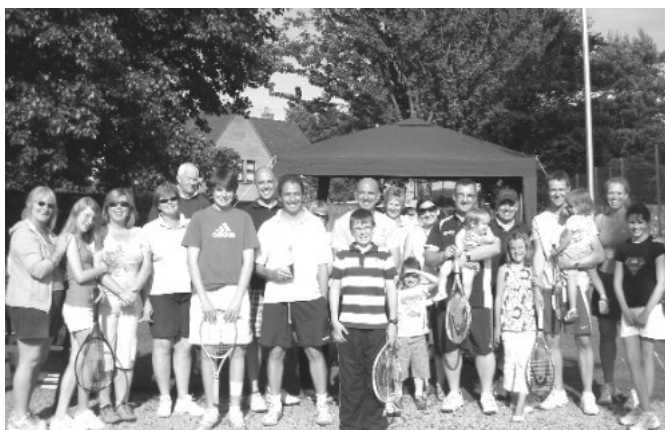
The well attended Summer BBQ and fun tournament

Our junior section is going from strength to strength. Some 20 juniors attended a fun tournament on 20 June and numbers continue to be high at junior club nights which are adult-supervised and open to all junior members on Tuesdays from 5.30pm until 7pm.