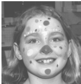
Maybe try a spot of face painting!

Dress up as your favourite rock/pop star! During the event there will be a pop star look-a-like competition. Children and adults (!) can take part, so put on that wig and your blue suede shoes! Great prizes to be won!