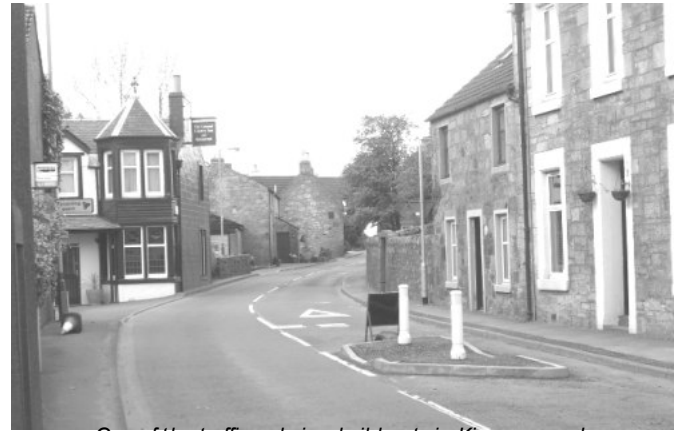
One of the traffic calming build-outs in Kinnesswood

original thinking on the small bollards and signage was that since this was being introduced into smaller type villages we would have preferred less obtrusive signage and less obtrusive bollards. However different bollards were available which could be fitted with a light and an example was available at the meeting.