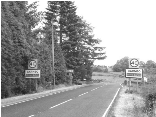
Speeding in villages remains a problem in the area

Speeding in villages remained a concern, and Police requested continued feedback on problem areas. Local area Police were to receive a new speed gun, but main purpose was prevention, although reported that in previous week two motorists had been caught and reported for doing 55mph and 60 mph in Cambo.