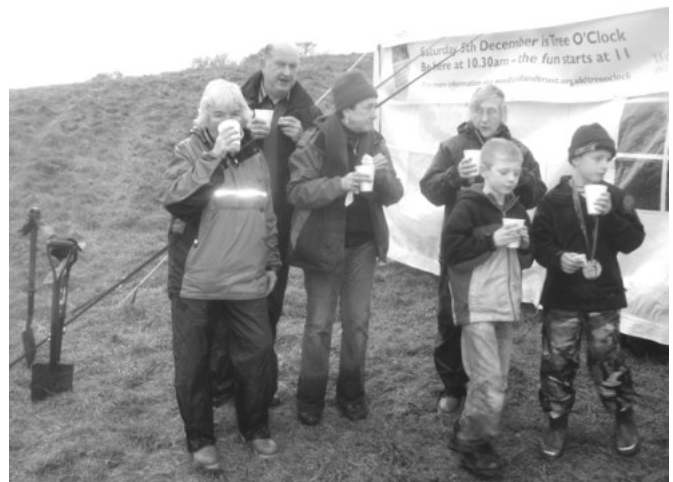
A group of volunteers warming up

Of course, the new orchard will mean even more trees to put in but recently we've had lots of practice - and that brings us to our second big thank you.