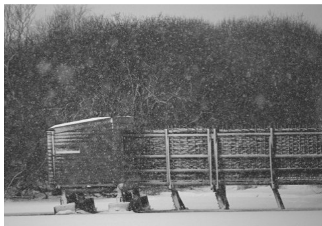
The bird hide at Burleigh Sands, its posts skewed by moving ice during the recent big freeze

The Newsletter reserves the right to refuse or amend any advertisement or submission and accepts no liability for any omission or inaccuracy