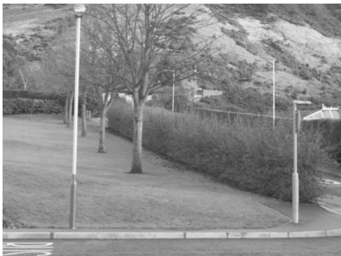
The hedge alongside Bishop Terrace playing field is causing road safety issues

Signage at Scotlandwell: Request made to Clarence to remove picnic signs because these are placed on private property. It has been confirmed with P&KC that the removal is on the list of 'things to do'.