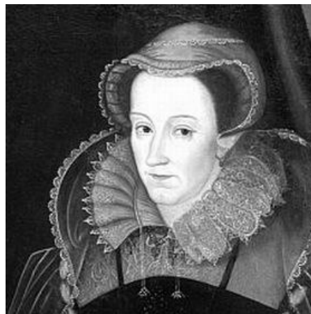
Find out about Mary Queen of Scots' imprisonment at Loch Leven Castle at Scotland's History Online

The website is aimed to be a resource for pupils and teachers and help inform all Scots – at home and abroad – about Scotland's history. It has over 200 topics that include links to over 1,000 other online sources and a wide range of interactive supporting materials.