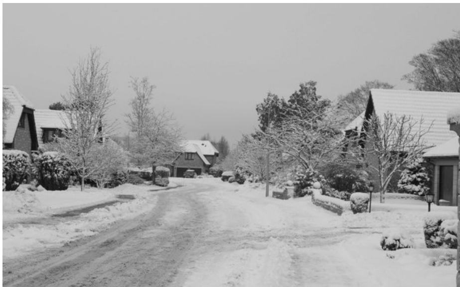
Snow-bound Kinross: Green Wood on Christmas Eve