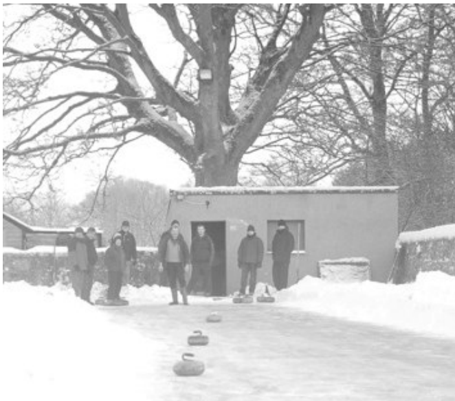
No substitute for the much hoped for Grand Match, but some outdoor curling took place in Kinross on 9 & 10 January

If you have photos of this spectacular winter, the folks at the photolibrary on www.kinross.cc would love to have copies.