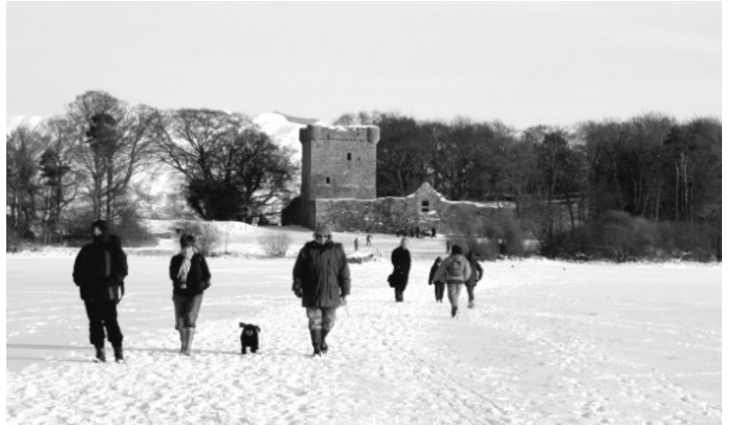
Strolling to Loch Leven Castle across the frozen loch

Whatever your views on the snow, there has been no escaping it for the past few weeks. It may look lovely lying on the hills on Christmas Day when you're snug inside with nowhere to go, but it's a different story when you have to get back to work or battle your way to school. It has been many years since conditions were this extreme, and it may be many years until they are again. With this in mind, we've put together a collection of photos showing snowy Kinross-shire, to look back on fondly (or not!) when that far off summer finally arrives!