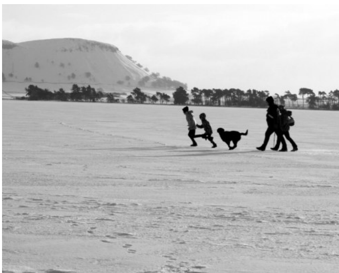
Dog walkers and skiers put the frozen loch to good use!