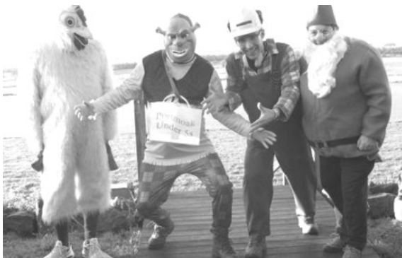
The Portmoak Under Fives Dads!