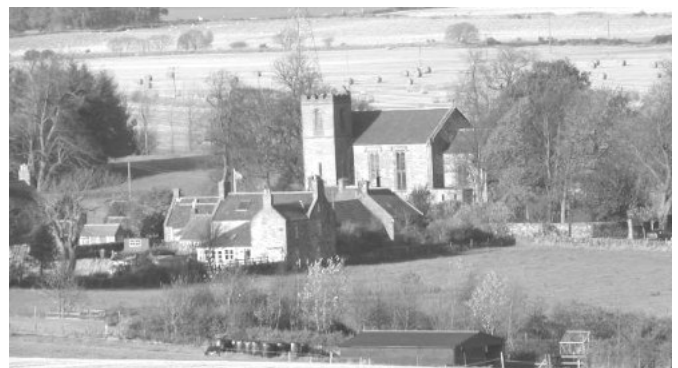
The roads in and out of Cleish are in a bad state due to flooding

The new entrance into Woodlands is at the wrong point in the road with very limited visibility, and the state of the drains and ditches can only exacerbate the problem of flooding down the hill and onto the road into Cleish. Cleish Mill Steading had been the chief sufferer with flooding into the house.