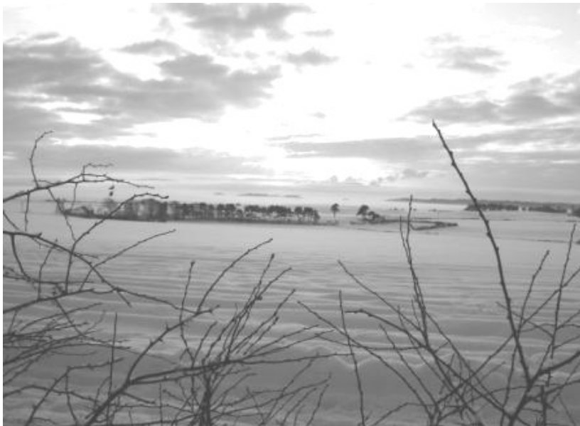
Loch Leven from Pittendreich