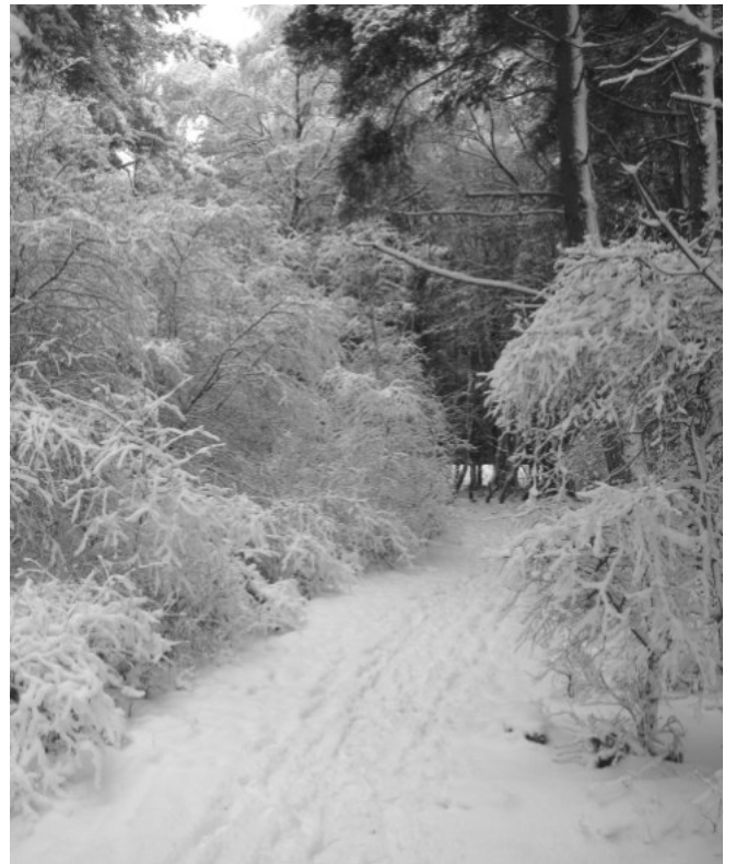
Portmoak Moss in the snow