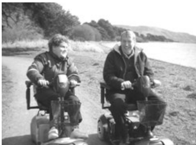
Mobility scooters which may be hired free from Loch Leven's Larder

Our sincere thanks are due to all those who helped make this possible – particularly the owners/managers and staff at Loch Leven's Larder.