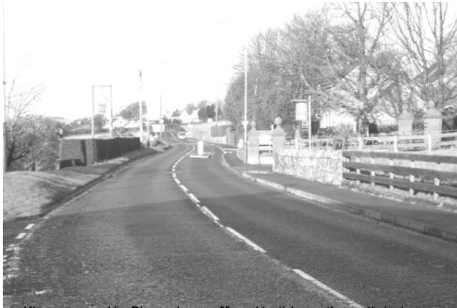
Kinnesswood in Bloom have offered to tidy up the path between Gamekeepers and the Cobbles

A resident raised the issue (which he read in the publication 'Scottish Farmer') of Council maintenance of core pathways and the problems it could cause farmers. Cllr Robertson stated that there was no money in the Council budget for the maintenance of core paths and said he thought this proposition was very unlikely.