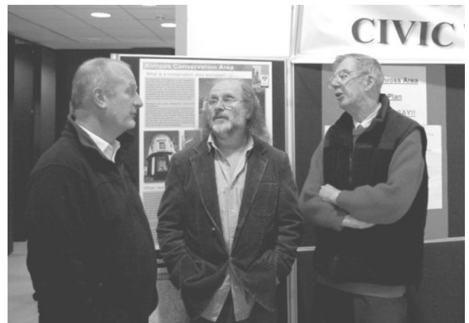
Discussing local issues at the community fair at the new campus