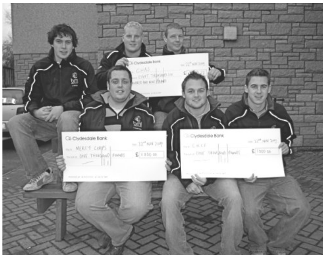
The “nutznboltz” boys with their donations