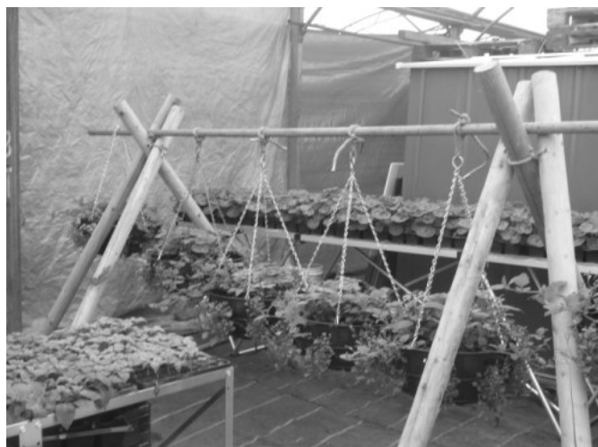
Last year's baskets during planting up