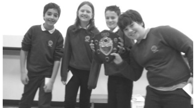
The Fossoway Primary quiz winning team

Please look at our web site, www.kinrossrotary.org for more information about Rotary and Interact.