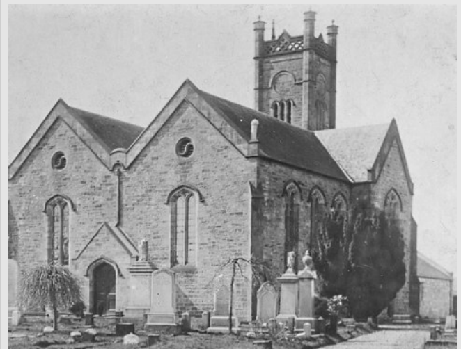
Kinross Parish Church