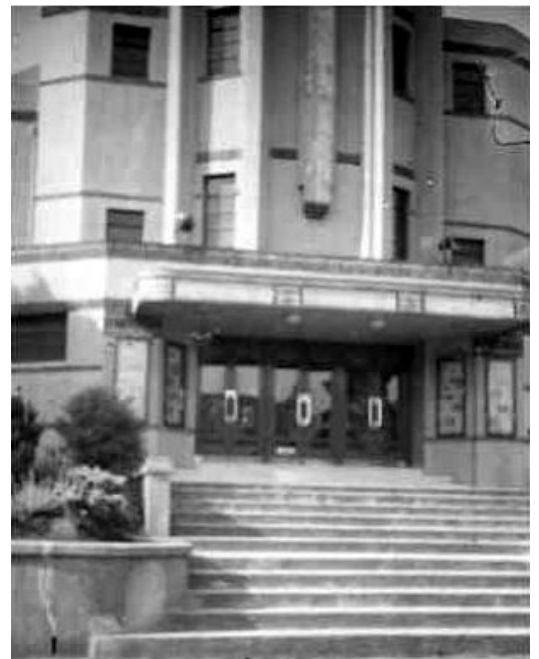
The entrance in 1972, during the combined cinema and bingo phase.