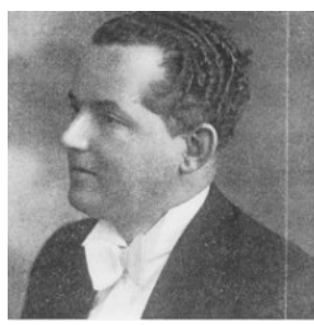
Three of the original directors of the County Cinema: