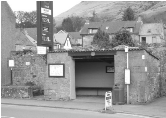
Kinnesswood bus shelter - ripe for redevelopment?

Kinnesswood bus shelter: The area around the bus shelter, the Picture Garden and burn, has been greatly improved by Kinnesswood in Bloom. However, there is a piece of ground behind the present bus shelter which is not used and this has prompted the question whether the community requires such a large bus shelter and whether the whole area could be developed into a more attractive centrepiece for the village. The CC has contacted P&KC to enquire of ownership and the correct procedure to adopt if it is decided to develop the area.