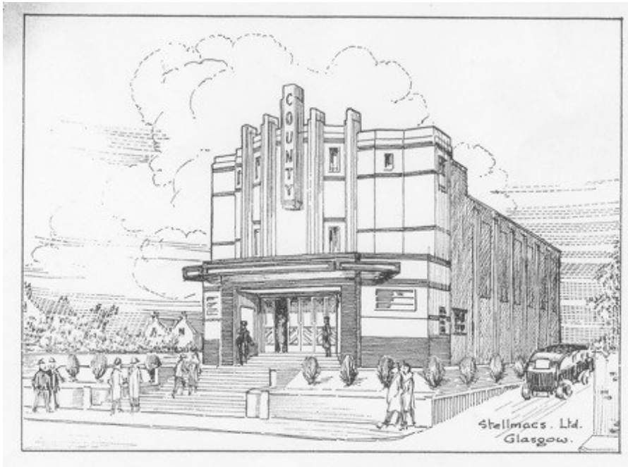
The County Cinema in Kinross, as it would have looked in its heyday

Inspired by the news that there are soon to be regular film screenings at the community campus, we thought we would take a little look into the history of the cinema in Kinross.