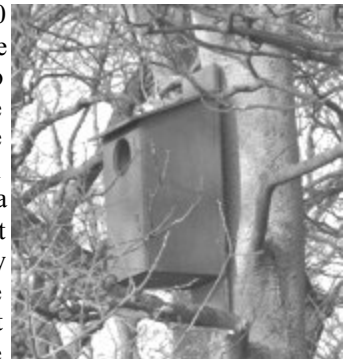
One of the Goldeneye nest boxes constructed by volunteers

There are over 200 Goldeneye on the loch at the moment and in an effort to encourage some of these stunning ducks to breed here our volunteers have been busy constructing over a dozen large nest boxes. It seems amazing that the tiny fledglings dare to make the 5m drop from the nest, but these hand crafted homes are now up around the reserve and with luck will have new tenants come the spring. We’ve also been making use o f our volunteers’ creative talents, producing Black-headed gull decoys to take up residence on St Serf’s. It’s hoped the life-like decoys will encourage gulls to nest on the island, giving protection to nesting ducks by scaring away aerial predators such as jackdaws.