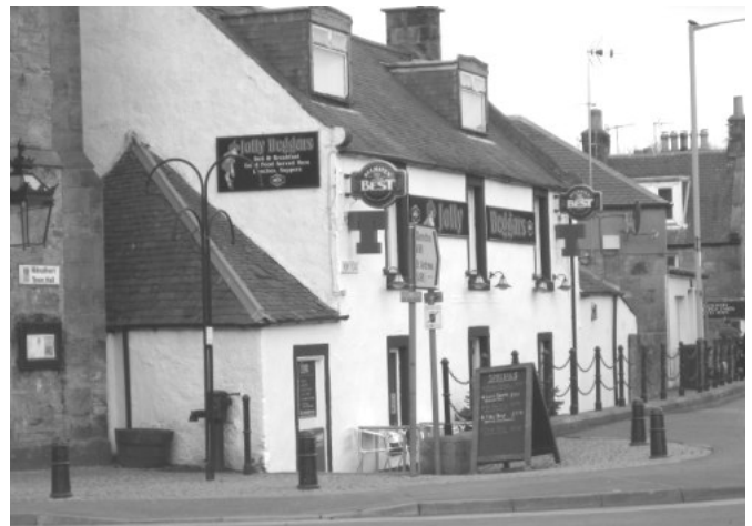
Licence rules may be relaxed for tables outside public houses such as the Jolly Beggars, above