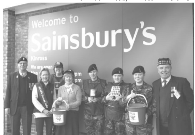
On 13 February, collectors outside Sainsbury's raised nearly £500 for the SSAFA