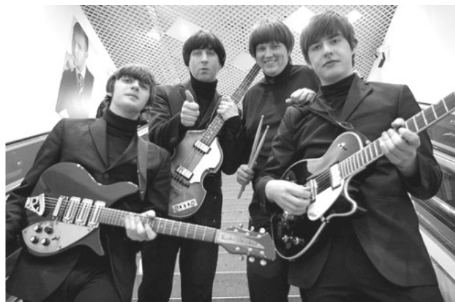
Tribute band 'Them Beatles!' will play at this year's Gazebo Gathering

We will have various bands to entertain you: a couple of local bands, a ceilidh band and tribute bands. One of them will be 'Them Beatles!' There will be various children's activities arranged so that you can let them play while you relax on the lawn with the music. Food and drink (including alcohol) stalls will be available on site. Early Bird Tickets will be available at the Feel Good Fair (Loch Leven Half Marathon).