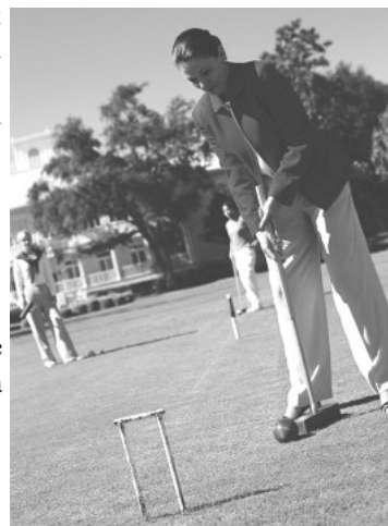
The new croquet season starts on Monday 12 April