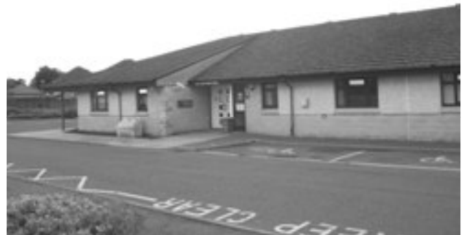
14 affordable housing units are to be built on the former health centre site at Lathro