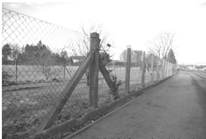
Metres of concrete posts and chainlink fence where the beech hedge used to be

Now there are concrete posts and a plain, rusting chain-link fence to look at (doing an excellent job of displaying litter when the wind gets up) but the Council will save some money on its grounds maintenance budget. Let's follow that logic through .... If we cut down all the trees and bushes in public areas, that would save loads on the grounds maintenance budget. And grass verges and public green spaces are a nuisance, because they need regular cutting, so we could cover them in concrete and then ..... Oh, I've got that poem in my head again.