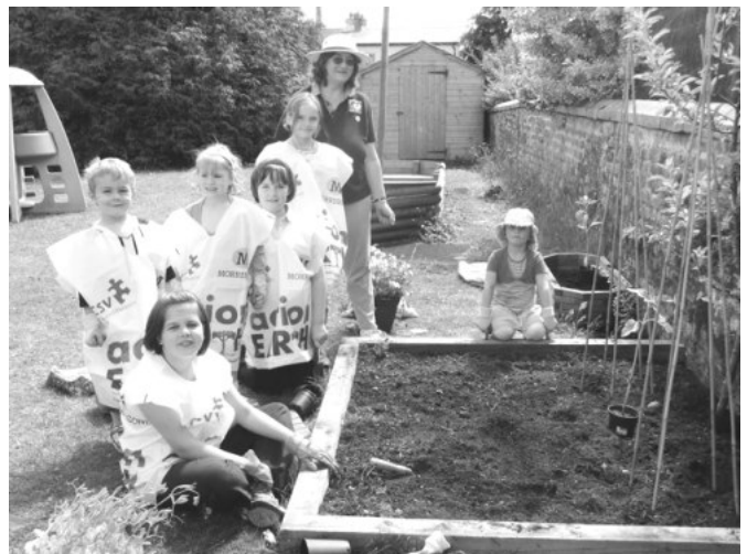
2nd Kinross Guides planting the raised bed at Swansacre Playgroup

We are very grateful to be offered certificates for participants, and a small grant from the CSV Action Earth Project which is supported by Morrisons Supermarkets, as part of the UN International Year of Biodiversity, and to be able to do our part in encouraging biodiversity in the centre of Kinross.