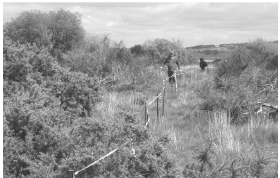
Scrub encroaches if there is no grazing

To create perfect conditions for birds and other wildlife, we first need to collect rain water by building dams and small 'reservoirs'. Then we need to distribute the water over the grassland to soak as big an area as possible. For this we use sluices, drains, pipes and ditches. We have no pumps at Vane Farm. The whole system is driven by gravity, so we need to be careful that we don't lose too much water too quickly. Because once the water is at the bottom of the system, we can't get it back up! Just as important as water is grazing. At Vane Farm 100-150 highland cows and