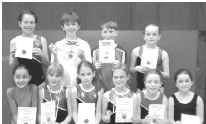
Keen young gymnasts show off their certificates

If anyone is interested in taking part in gymnastics, classes are run on a Monday, Tuesday and Wednesday at Loch Leven Community Campus. Contact 01577 867200 for further information.