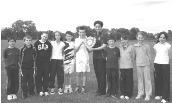
The Cleish Primary School team, winners of the Kinross-shire Primary Schools Kwik Cricket tournament

Teams were entered from Kinross, Fossoway, Portmoak, Cleish and Milnathort Primary Schools. Children were from P6 and younger. The tournament rules were slightly changed this year to reflect the increase in the popularity of girls' cricket and each team had a minimum of three girls playing in matches. It was a very hotly contested tournament this year with all teams contributing great performances in the group matches. The tension mounted as it became clear that the result of the last match would decide the tournament winner.