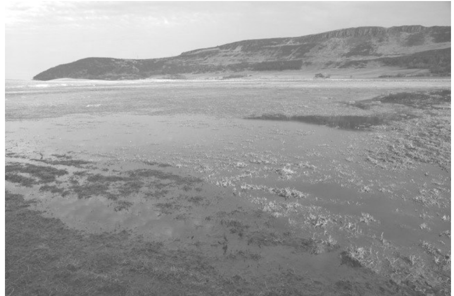
Vane Farm wet grassland

The aim of that work will be to give us the ability to collect more water, spread the water more widely over the reserve and have better control over its flow. This will create a more level grassland with smaller hillocks and shallower