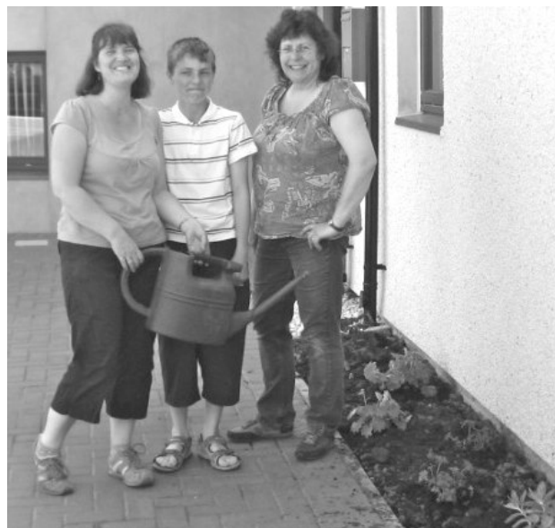
Volunteers planting the border at the Health Centre