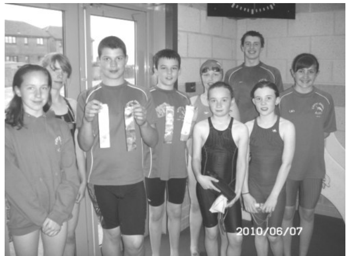
Kinross Otters show off their medals from the "Stars of the Future" meet

The Club is now looking forward to a well deserved break over the summer months with a resumption of more meets at the end of August.