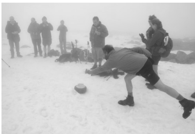
Not ideal conditions for a match!

The season is never over for Kinross Curling Club. Well done everyone, a fantastic day, you have all made history.