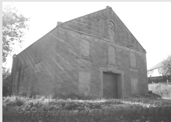
The Muckle Kirk, Milnathort