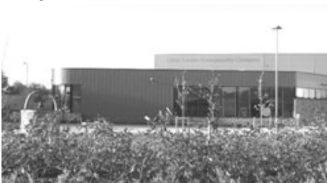
A huge range of facilities and opportunities is on offer at Loch Leven Community Campus

Throughout the summer holidays the community library will be holding its pre-school storytelling and Rhymetime sessions as normal. The storytelling sessions will be held every Monday at 10.15am and every Thursday at 2.15pm. Rhymetime fun will be running every Saturday at 10.30am and also on Wednesday 14 July, 28 July and 11 August at 2pm. In addition, the 'Space Hop' Reading Challenge for youngsters will be running at the community library from Friday 25 June until Friday 20 August, with storytelling and games sessions every Monday from 3pm to 3.45pm between 5 July and 9 August, and craft sessions from 10.30am to 11.30am on Friday 16th and 30 July and Friday 13 August.