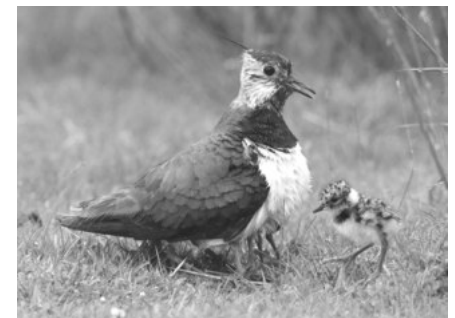
A Lapwing and her chicks

We have recently been given permission to manage an additional 25 ha of land along the loch shore between Vane Bay and the Gairney Burn. This area used to be wet grassland, grazed by cattle and horses. Since grazing stopped, willow and birch have encroached.