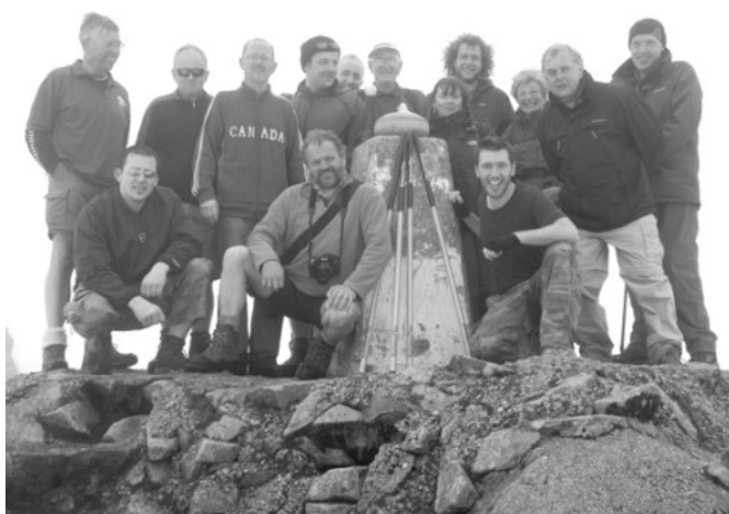
Local curlers with curling stone on the summit of Ben Nevis