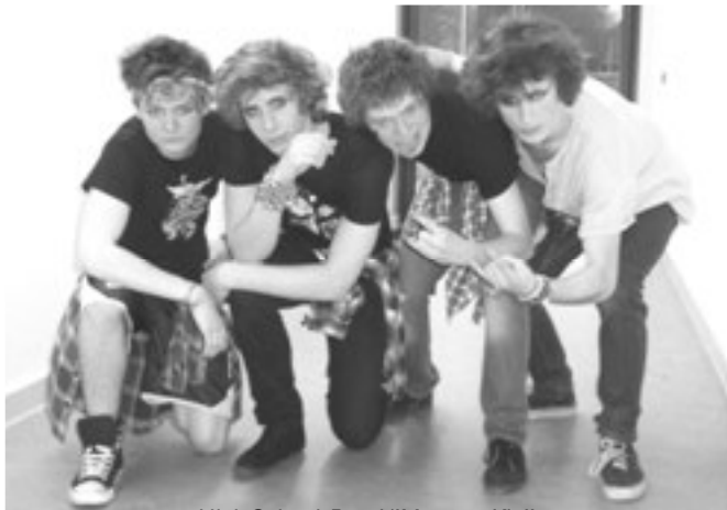
High School Band "Mamma Kin"