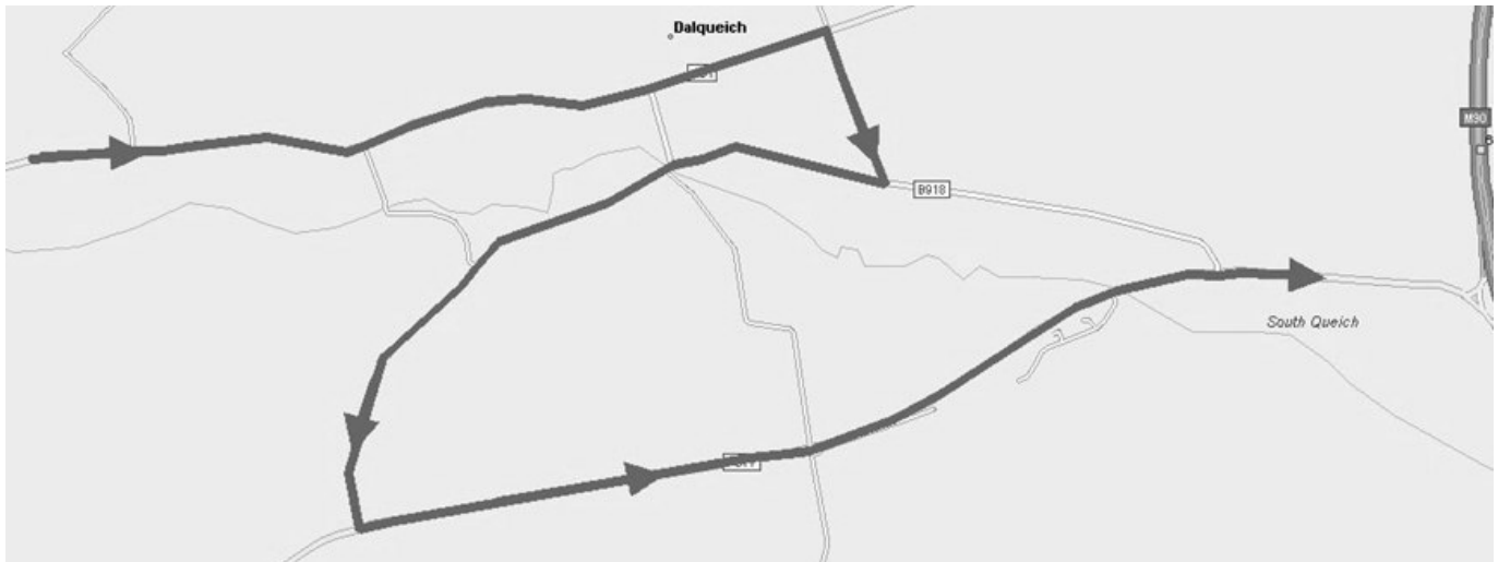
The Service 204 route on Saturday 10 July