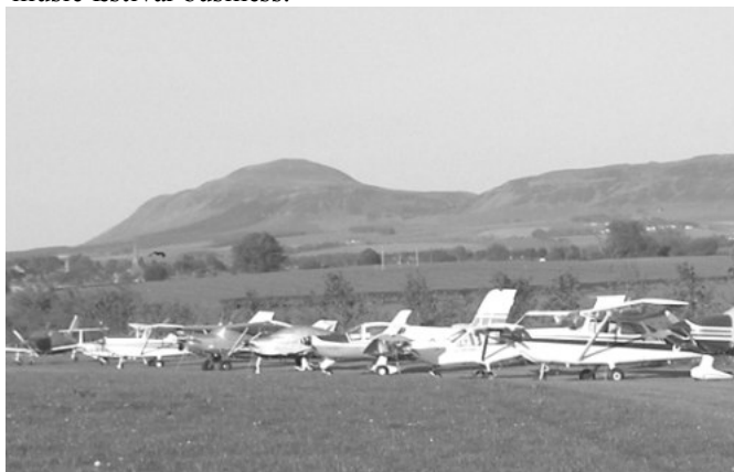
Flying Farmers Association aircraft at Balado Park