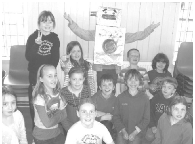
A Targon attempting to infiltrate the class!

It is a long, long time in the future for the inhabitants of Space Cruiser 5 when they are unaccountably attacked by the Targons - a situation demanding cool resolve, quick thinking and the application of Protocol 7, fractal generators and lots of remote robots - not all of them obedient to commands.