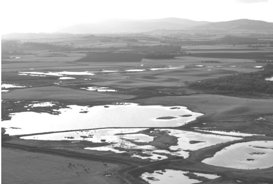
Main wetlands at Vane Farm

about as many sheep 'work' round the clock and throughout the year to keep the vegetation low and to prevent scrub from encroaching on the valuable wet grassland.