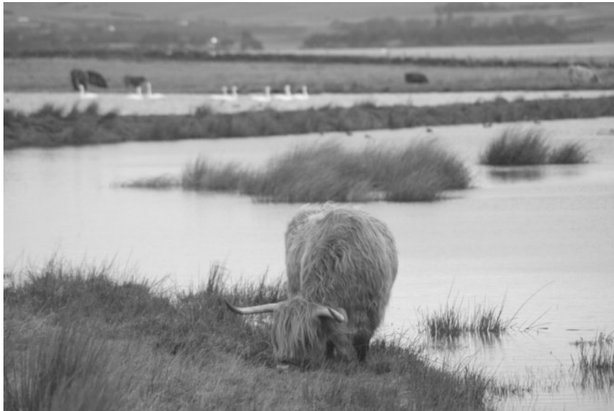
Highland cattle help manage the wet grassland