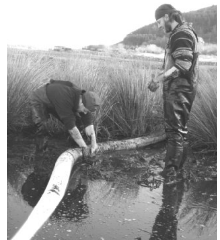
Distributing the water to where it's needed most

Vane Farm Loch Leven visitor centre is open 10 am-5 pm daily, and the trails and hides are open 24 hours a day throughout the year (except Christmas Day, Boxing Day, New Year's Day and 2 January).