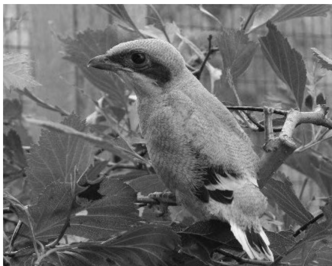
A baby shrike