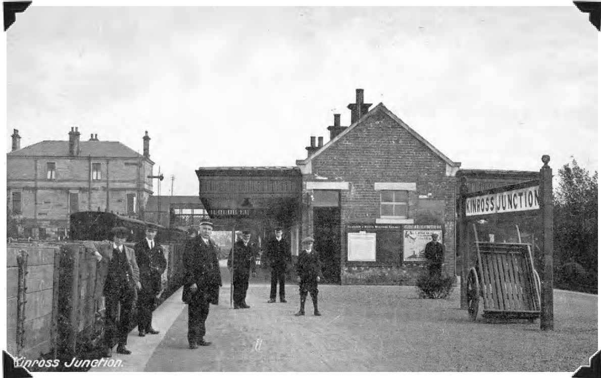
The platform at Kinross Junction, c. 1910.