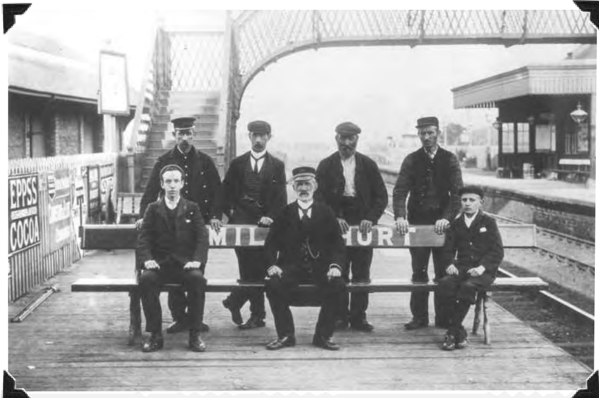
The stationmaster and staff of Milnathort Station, c.1895-1900. Milnathort station was opened by the Fife and Kinross Railway in 1858 and taken over by the North British Railway four years later in 1862.