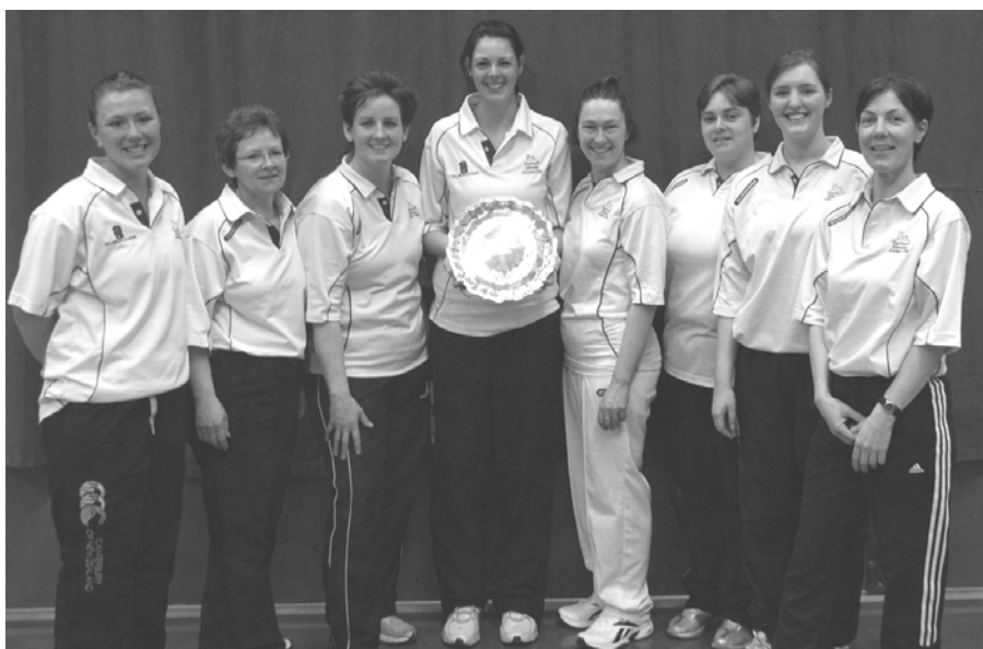
Kinross Ladies cricket team – nominated for the P&K Sports Council team of the year award

As we head into March we start to think about the wicket preparation and look forward to getting the roller out. The number of fixtures at senior, ladies and juniors levels continues to put pressure on the small wicket facility at Kinross House and discussions have been ongoing about some of the junior games being played at the Loch Leven Campus cricket pitch. This could bring a number of new opportunities as it would allow passing traffic to see that cricket is well and truly on the map in Kinross-shire. Full details of all the club news can be found on the website www.kinrosscc.co.uk