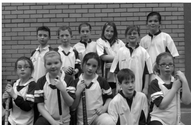
The Kobras who took part in the Perthshire U10 tournament

Outdoor training is slowly getting back underway at the KGV pitch on Thursdays from 6.30 to 7.30 and two more tournaments are planned in March. The club has also received a grant from the 2014 Communities Fund to support coach development and junior training and looks forward to this benefiting the junior hockey players over the coming year.