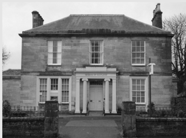
The Bank of Scotland, Kinross