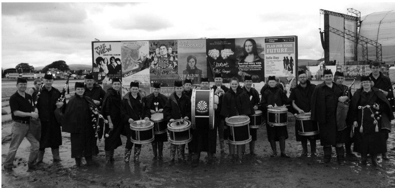
Kinross Pipe Band brave the mud at T in the Park

As always, for any information, visit the website at www.kinross-pipe-band.co.uk or contact Nigel Kellett on 07801 182283.