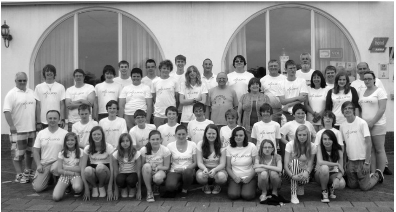
Members of the Kinross BB and Scouts who attended summer camp in Holland