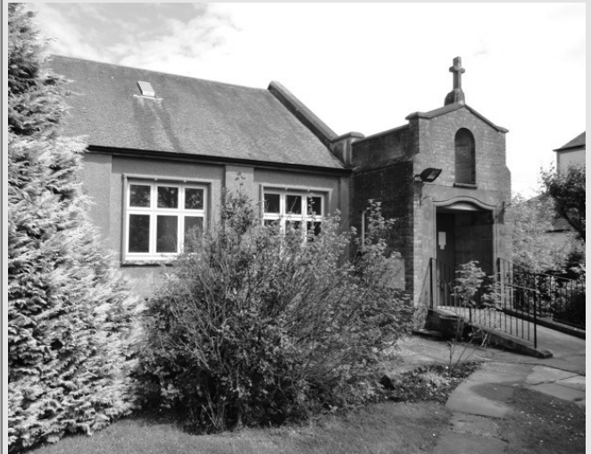
St James Church, Kinross

Half hidden by trees on the east side of the High Street, St James Roman Catholic Church forms a small drydashed rectangle with a brick porch at its south end and a larger two storey extension to the north. Above the entrance doorway in the porch there are decorative features and an image niche.