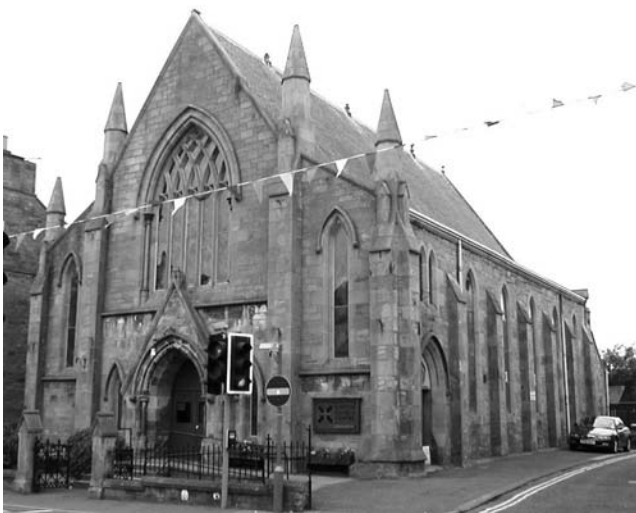
The Day Centre in Kinross High Street

The charity was founded in November 1983 and helps the elderly by collecting them from their homes in one of their two minibuses and taking them to the Day Centre. There they are welcomed into a safe and homely atmosphere where they can have lunch and join in a full range of activities. The Day Centre also provides services such as personal care, chiropody and form filling.