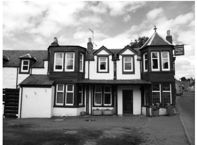
The Lomond Country Inn, Kinnesswood

The Lomond Country Inn closed some time ago and is currently for sale. It was last offered by auction in March 2012 but remains unsold. This long established Inn is sadly missed by residents. There are signs of deterioration to the exterior of the building, and the CC is concerned that this should not continue to a point where the building becomes unattractive to potential purchasers, or detracts from the appearance of the village. The Chairman agreed to contact the owner to ascertain the position.