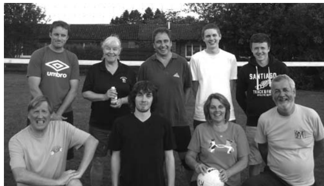
Members who have been playing at KGV on Monday evenings

New members are welcome to come along to the informal sessions, which are free of charge. The club will continue to meet outdoors until the indoor season commences after the school October holidays.