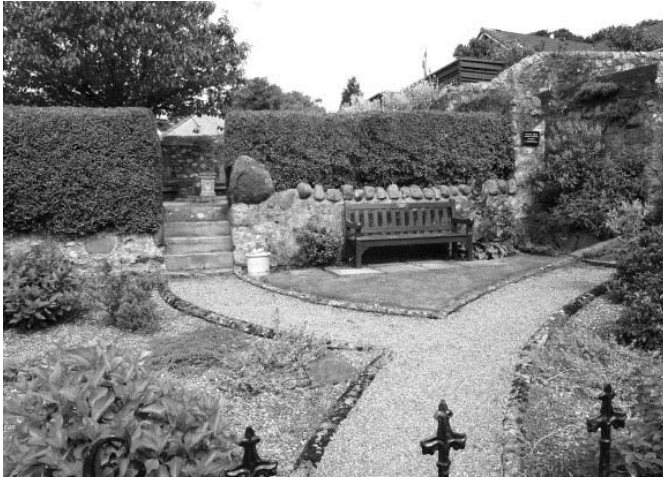
The Michael Bruce cottage, Kinnesswood

Congratulations to all the winners, and thank you to all those within every community who entered who work hard throughout the year to enhance Kinross-shire.