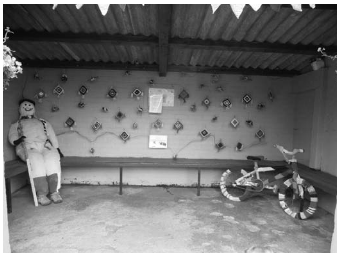
Children's artwork in the bus shelter during the Portmoak Festival

The cart has been moved to the lower part of Gamekeepers Road, rubbed down and painted. It will be filled soon with compost and planted with appropriate and sustainable plants. Despite the rain, work parties have been out weeding, planting and trying to deal with the problems of such a wet summer.