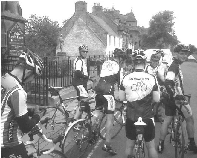
The new kit in predominantly white and purple (central riders) shows up better than the original yellow and purple (rider on right)

On 9 September we will be staging our first circuit race series. There will be three races and more information can be found on our website. Why not come along and cheer or photograph the riders?