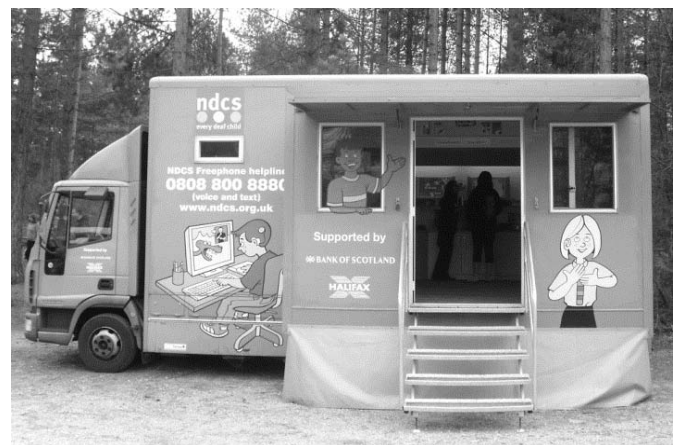
The Listening Bus

If you can't come along to the Bus but would like more information about the NDCS, please call the Freephone: 0808 800 8880 or email helpline@ndcs.org.uk or have a look on the website: www.ndcs.org.uk