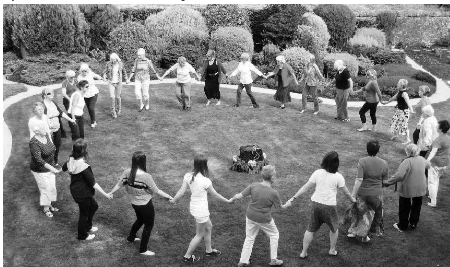
Circle dancing is an enjoyable pastime