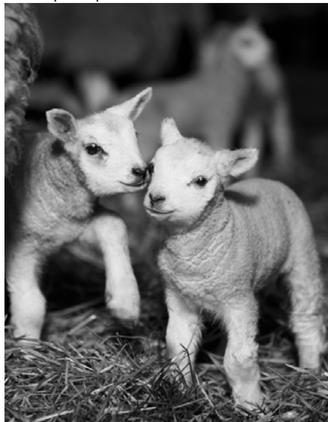
A delightful pair of Iain's lambs

Iain Campbell is pictured on this month's cover.