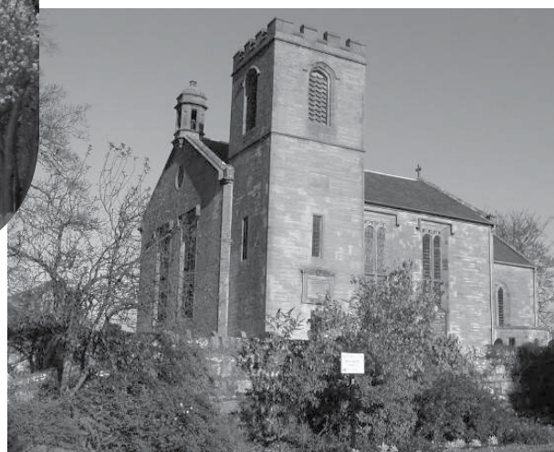
Cleish Church