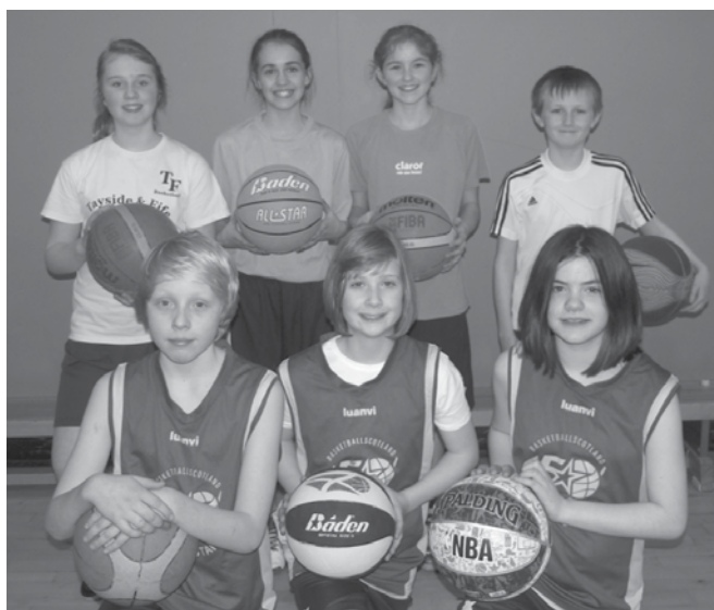
Kinross Cavaliers members who attend the Future Starz programme