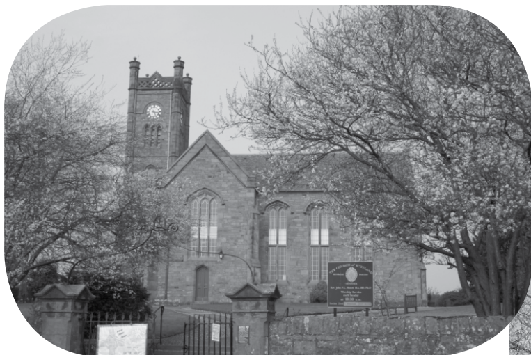
Kinross Parish Church