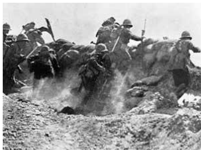
Going over the top: troops leave a trench at Gallipoli

After eight months' hard fighting with appalling casualties, both from disease and combat, the allied forces withdrew in January 1916, in ironically the most successful part of the whole operation, without losing a single casualty, but thousands had already paid the ultimate price with their lives.