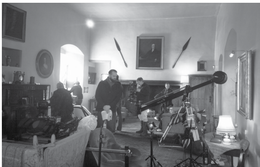
Filming in the Great Hall at Tullibole

Tullibole reverts to its more typical guise in April as a potential wedding venue. A Wedding Open Weekend takes place on Saturday 25th, Sunday 26th and Monday 27th April, 10am until 5pm.