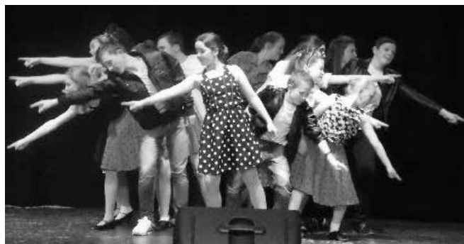
Grease is the word - one of the performances from One Night on Broadway

Lucy plans to put on another show at the 2015 Kinross-shire Winter Festival.