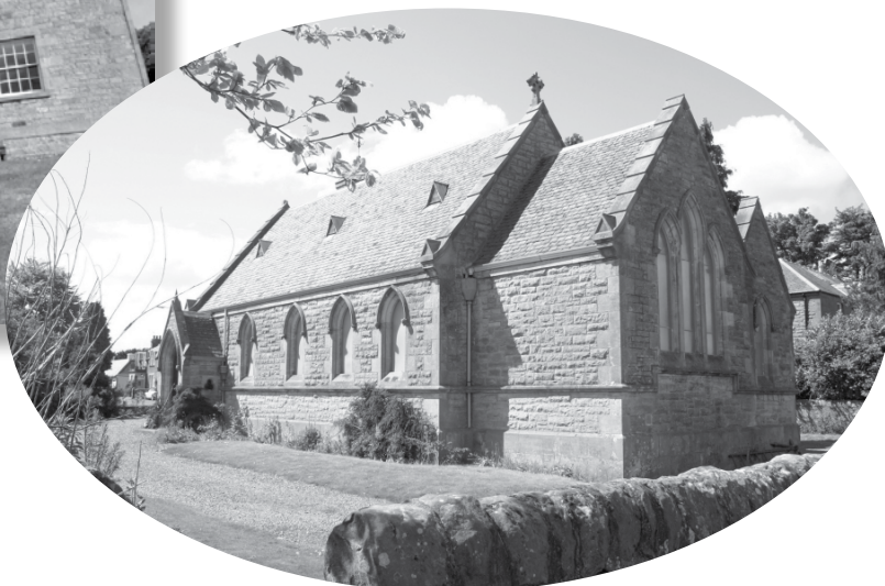
Right: St. Paul's Episcopal Church, Kinross