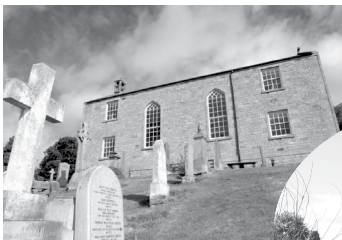
Above : Portmoak Churchyard