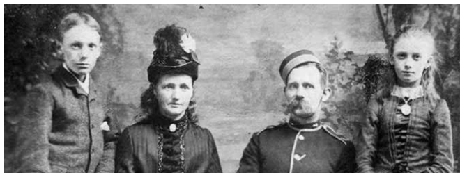
Soldiers' wives and children have been benefitting from the work of SSAFA for 130 years

Sir James Gildea's letter was the start of a very important development for the UK Armed Forces community. Bringing the wellbeing of military families into public debate made the issue a visible one, which could no longer be overlooked. His appeal resonated with the public, and people were quick to join the cause. Within months, the charity was born.