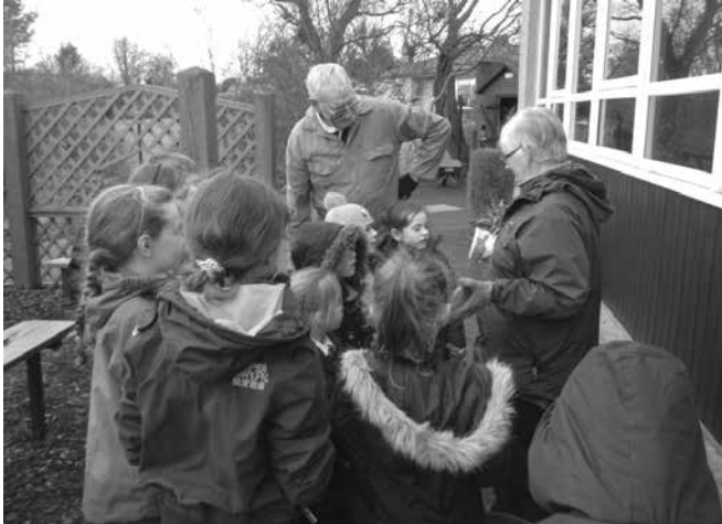
The school grounds group learn how useful worms are