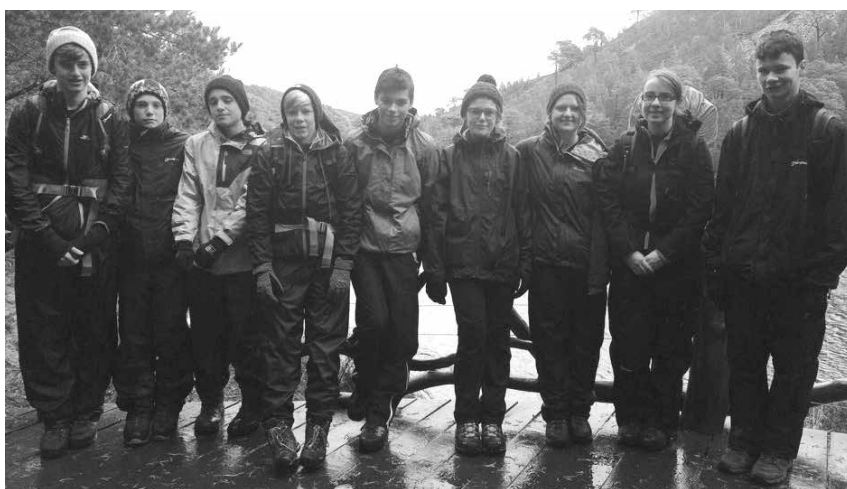
World Challenge Team 2 on a trip to Aviemore