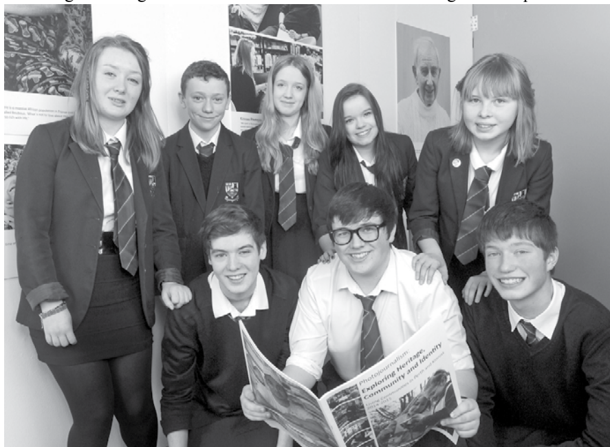
Young people from Kinross High School at the opening of the Living Communities Photojournalism exhibition.

Living Communities is an ambitious partnership initiative between Perth & Kinross Council and the Gannochy Trust. At the heart of the Living Communities model is a commitment to people and to the places in which they live. Since 2011, different generations have been coming together to explore the stories of communities, preserving local heritage that might otherwise have been forgotten.