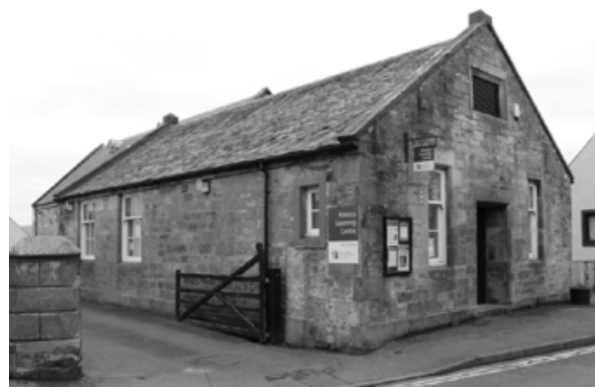
Kinross Learning Centre in Swansacre