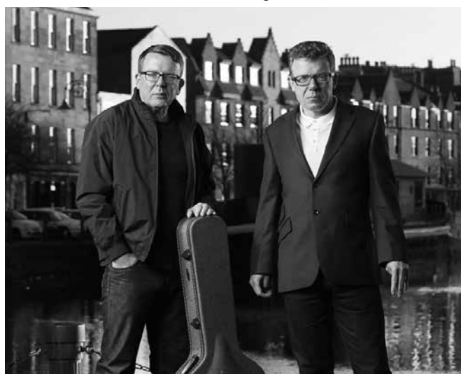
The Proclaimers, one of the acts at this year's Perth Festival of the Arts

Box Office 01738 621031 www.perthfestival.co.uk