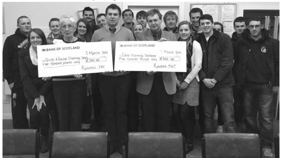
Two cheques totalling £1000 presented by Kinross JAC to their chosen charities