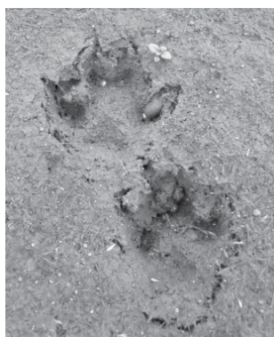
Footprints of the elusive otter