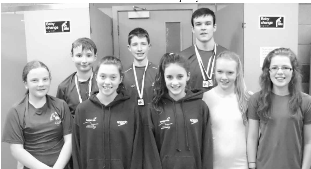
The Otters at the Midland District Age Group Championships 2015