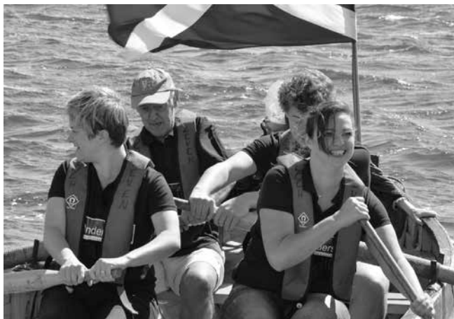
Team Andersons having fun at last year's boat race