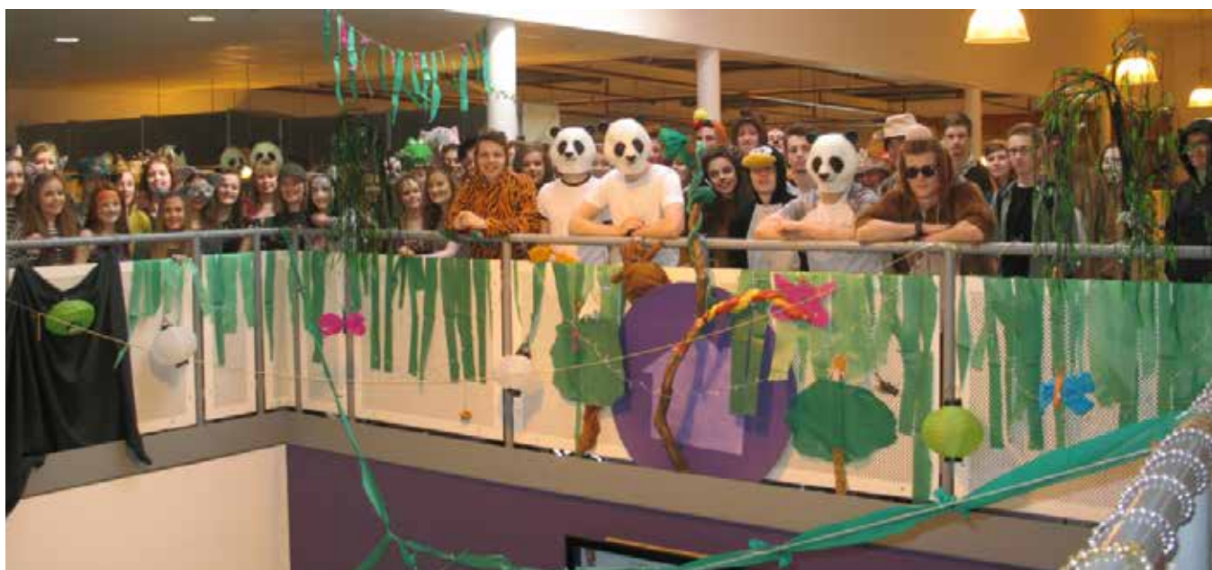
The Jungle Fun Day