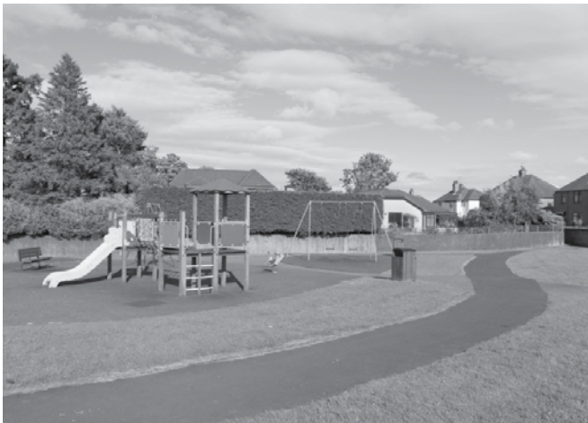
The Green Park play area. What changes would the community like to see?

Kinross CC meets at the Masonic Hall, Muirs, Kinross, at 7.30pm on Wednesday 3 August.