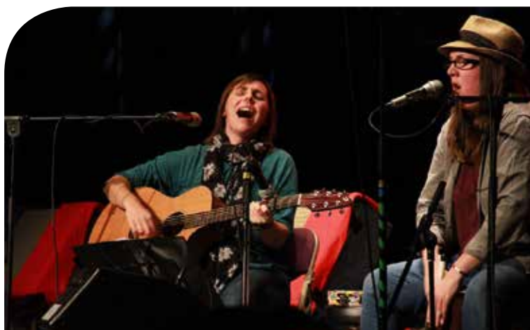
The Coaltown Daisies will be performing at this year's Winter festival

This year the Festive Street Market will take place on the High Street of Kinross on Saturday 26 November. Like last year, there will be a great variety of stalls and entertainment! If you are a local trader, crafts person or community group you might consider a stall. Like last year stall fees are £30 for businesses and £15 for charities/community groups. For a booking form for this event, please e-mail info@kleo.org.uk