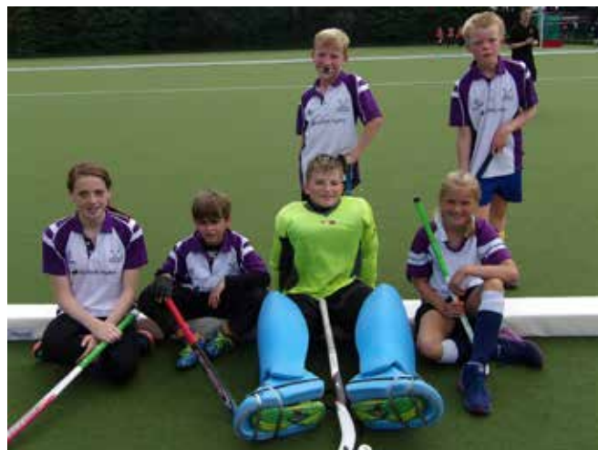
The U10 (below left), U12 (above) and U14 (below right) Kobras teams