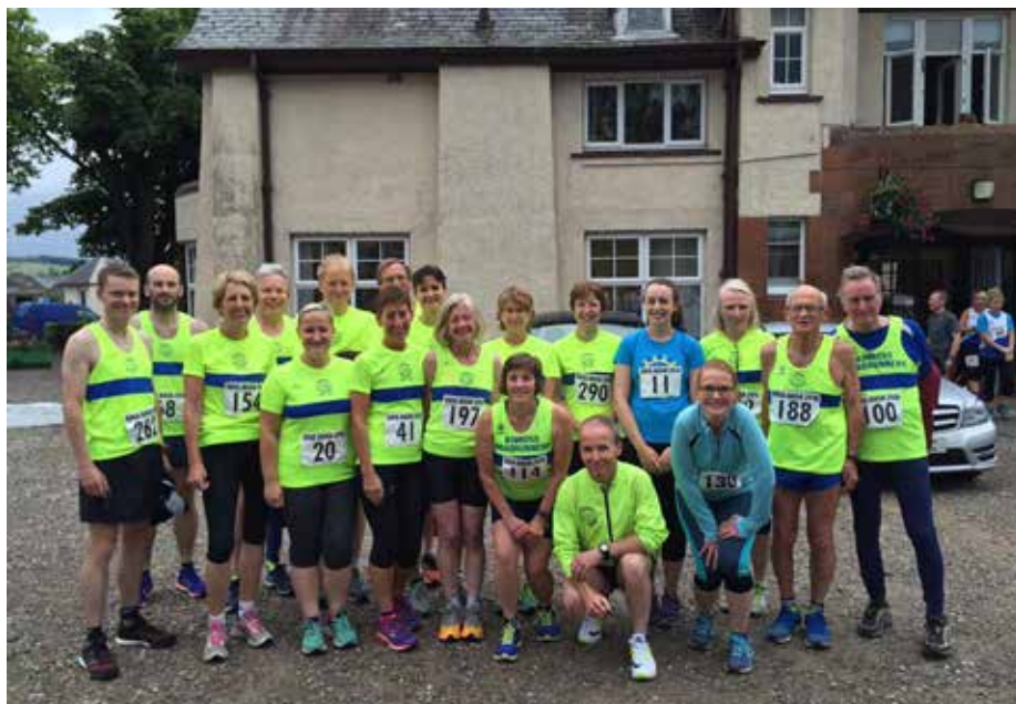
KRR runners at the Brig Bash

Finally, new members of all abilities are always welcome at KRR, so please don't be put off if you've never run before or you don't think you're particularly quick; most of us aren't! During the summer we run on Tuesdays (7pm at the Kirkgate) and on Wednesdays (meet at 6.45pm at the Medical Centre carpark) for a mixed ability, local, off road run. There is more information on the website. Do come along.