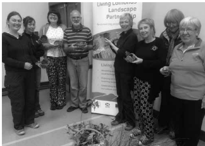
Members of the woodland group learn how to make baskets