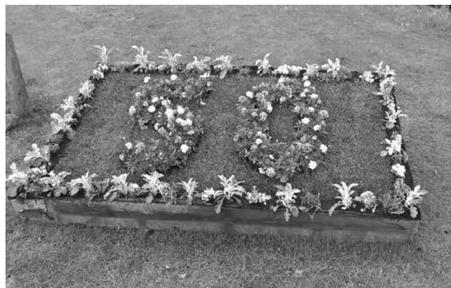
The 50th anniversary marigold display bed