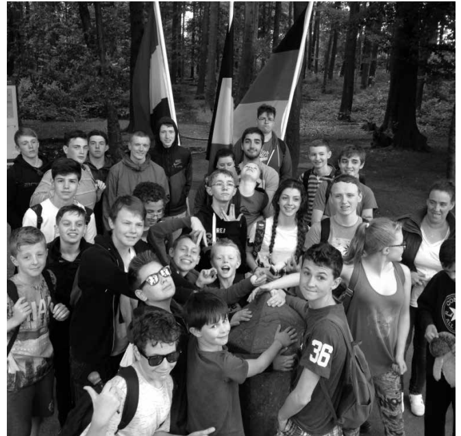
The group at Drielandenpunt

Finally, the youngsters had another great evening on the ferry on Friday while heading home at the end of a fun week.