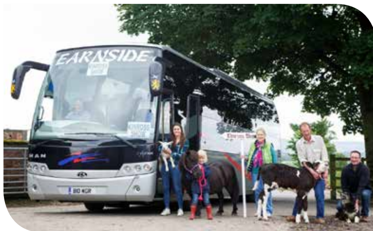
Why not take the bus to the show?

Scotlandwell then out to the Show. The bus will stop in the countryside if flagged down.