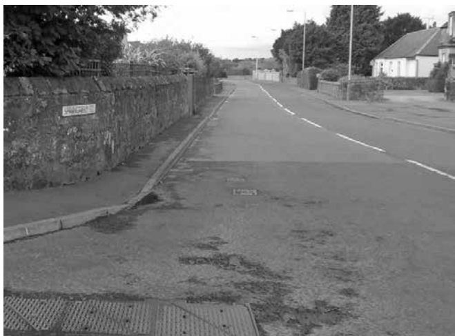
Cllr Robertson hopes to have Springfield Road made more pedestrian-friendly

I have now written to the Council asking that Springfield Road be made a much safer street for pedestrians and local residents. The pavement on the south side of the road at the Muirs is very narrow and the pavement at Wilson Court can also be difficult to negotiate because of overgrown vegetation.