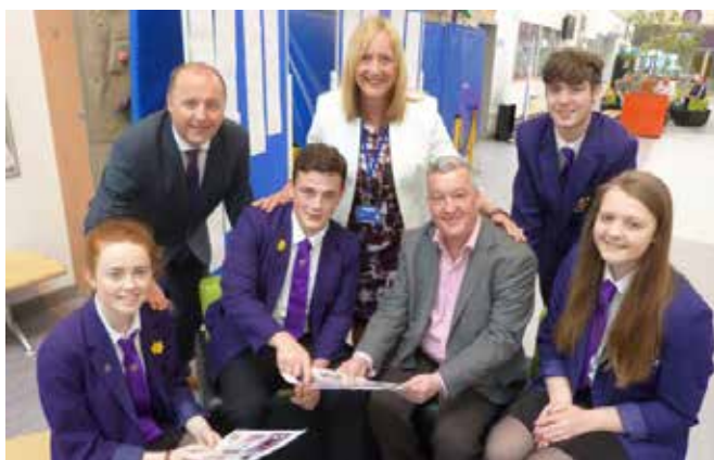
The S6 Conference

Our S6 pupils have been preparing for their roles as pupil leaders, role models and contributors to our school and its community. This preparation began with our inaugural S6 conference which will be followed up by a teambuilding weekend in August. Throughout the year there will be a number of social events and tailored educational activities. The year will finish with both formal and informal celebrations of their time with us.