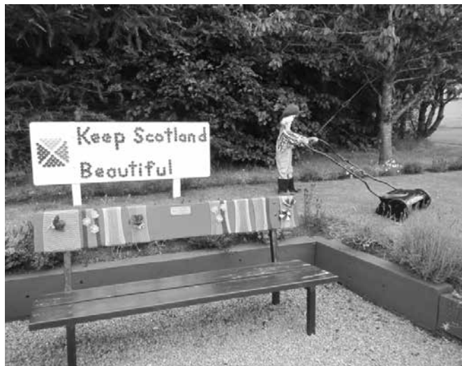
Decorated bench in Kinnesswood, complete with "gardener"!

The golfers and gardeners are now out and about and a couple of privately owned ones as well. Be sure to take a tour of the village so you don't miss anything. There is a trail/quiz available from the shop and small prizes will be given to the winners at the end of the summer. Keep the young ones entertained and find your way around all the nooks and crannies of Kinnesswood to find the answers.