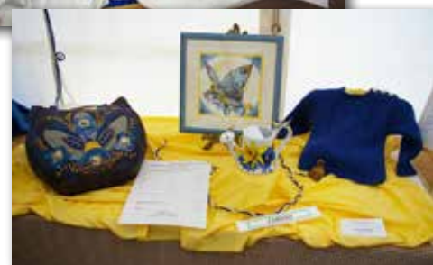
Examples of SWI craft work from previous Kinross Shows