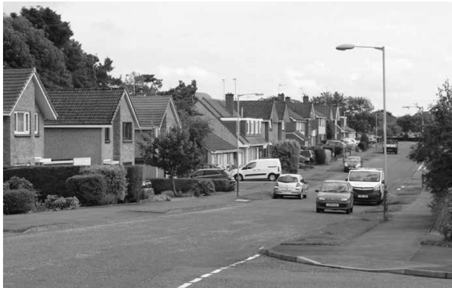
The 'Wimpey' estate was a major expansion to Kinross

Living in our area is about far more than