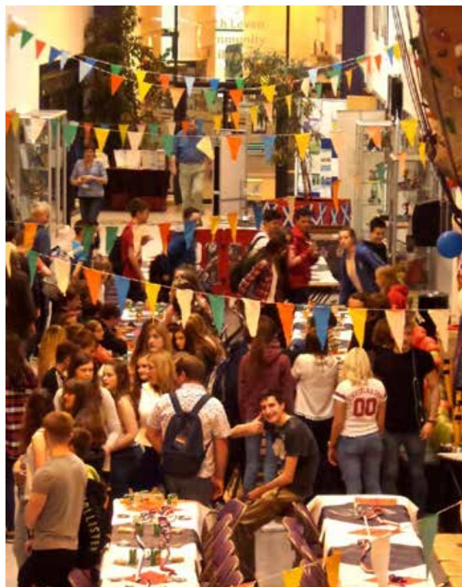
The whole 'Street' in the campus was laid out for a party for pupils

Senior citizens (including Kinross Day Centre, Ashleigh House), members of local community groups (including Reminiscence Group, Spark2, Carers Café) and special guests were invited to a community afternoon Tea Dance in the Assembly Hall. In the first half, entertainment was provided by members of the school band playing some lovely songs through the ages and there was plenty of opportunity for singing and dancing.