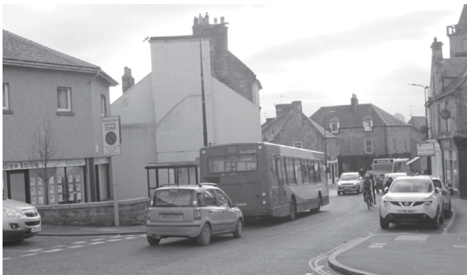
Is Kinross High Street a “lightly trafficked” street?