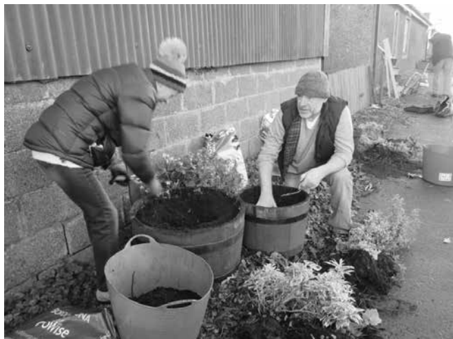
Tidying tubs during November

The school has a new system to involve children in outdoor activities and all children will be taking part in gardening activities at some point throughout the year. Some of the older children have worked hard to weed, empty raised beds, and cut back bushes. Soon they will be planning what they will plant this year.