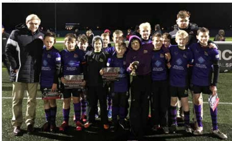
The P7 Boys' Team at the Murrayfield Tournament

Saturday 18 March, Scotland v Italy (Six Nations Super Saturday), 12.30pm kick off.