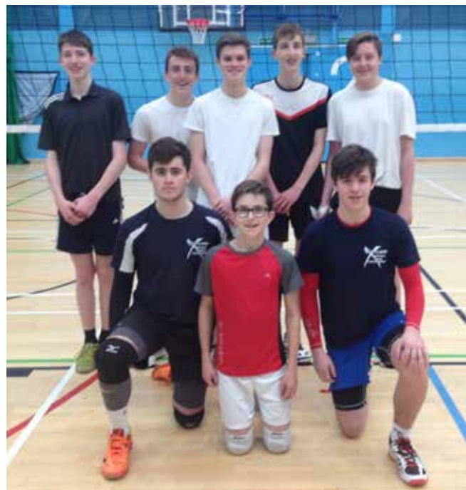
The Kinross High School senior boys' team

Open coaching sessions continue in the large campus games hall on Monday evenings from 8 to 9.50pm with new members welcome.