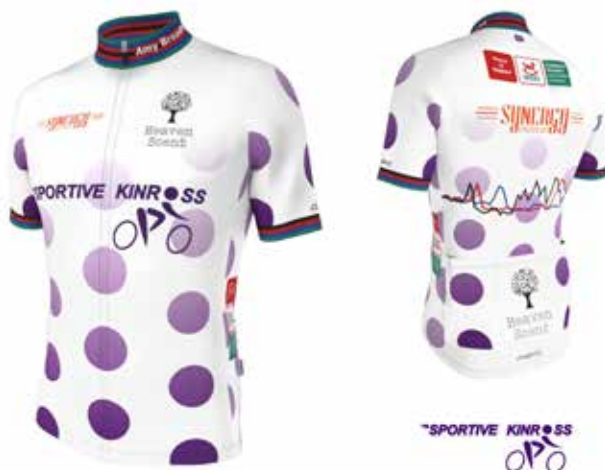
The final design for the new Kinross Sportive jersey

For more information, see the website: www.sportive-kinross.co.uk