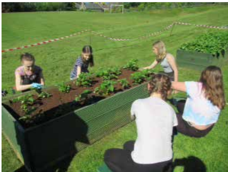
Planting raised beds in Kinnesswood

Some of the highlights were: over 400 pupils engaging with our local community doing volunteering work developing skills for learning, life and work; 329 pupils were all trained, assessed and passed the British Heart Foundation CPR course; S1 pupils went on a two-day residential trip to Hadrian's Wall in Hexham where they visited two different museums and walked along a section of the wall; S1 pupils were involved in a rapid response exercise where they were required to solve a number of practical challenges throughout the day;