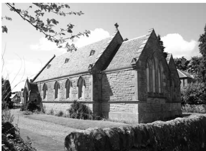
St Paul's Episcopal Church, Kinross