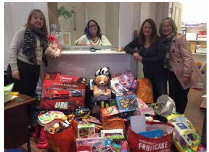
Toys donated via Moorelands Travel

You can also follow us on twitter using @broke_not or email us at clare.slight@brokenotbroken.org or graham.holden@brokenotbroken.org