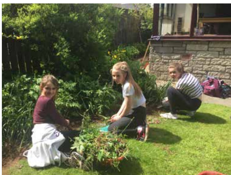
Helping out at Orwell Manse

150 S2 and S3 pupils had a day away at a number of different venues where they developed outdoor skills, (white water rafting and mountain biking), gained science knowledge at the Glasgow Science Centre or learned about animal behaviour at Edinburgh Zoo's Education Centre; 400 pupils took part in our annual walk around Loch Leven.