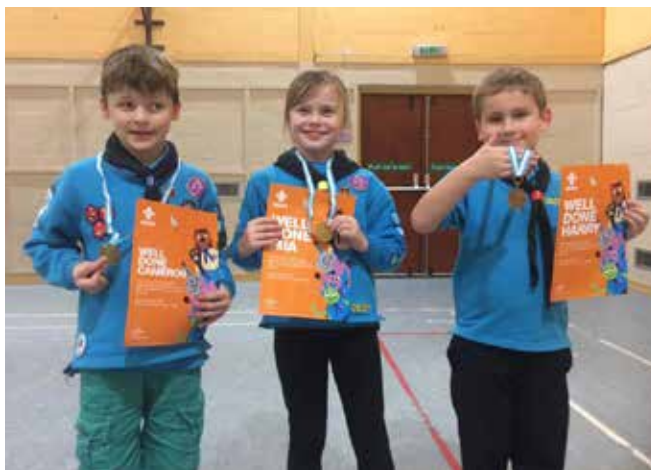
Recognition Awards for being kind, helpful and working hard!

As you can see, we have lots going on in the colony at the moment. If you would like to have the Beavers help your community group, or if you are interested in volunteering with Scouting, please contact us at kinrossbeavers@hotmail.co.uk .