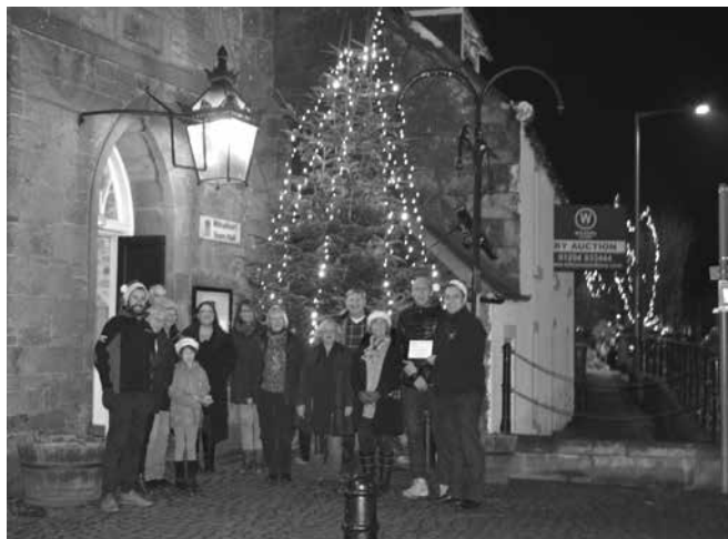
The Christmas tree donated by Scottish Water