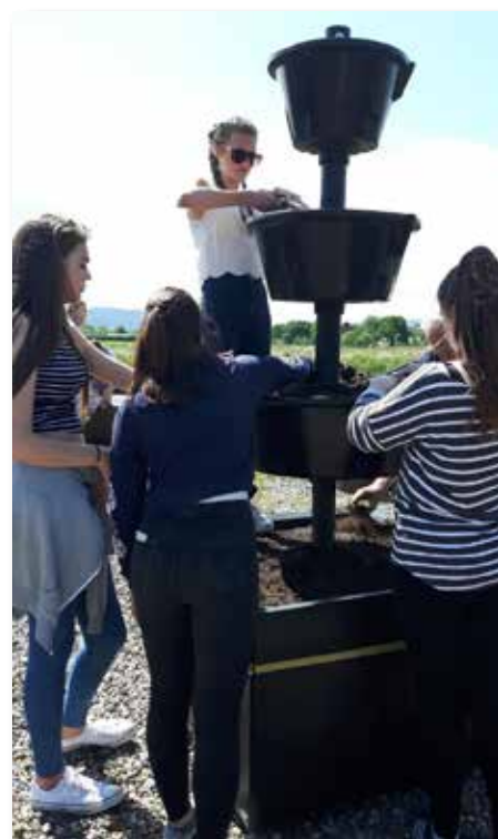
Lending a hand to Milnathort in Bloom

We would like to thank all voluntary partners for taking part in our 2016 challenge week and to expand our involvement