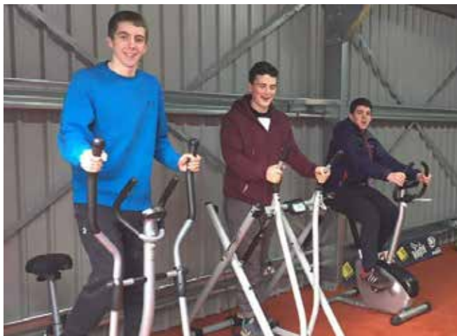
Get fit with Kinross Rugby Club!