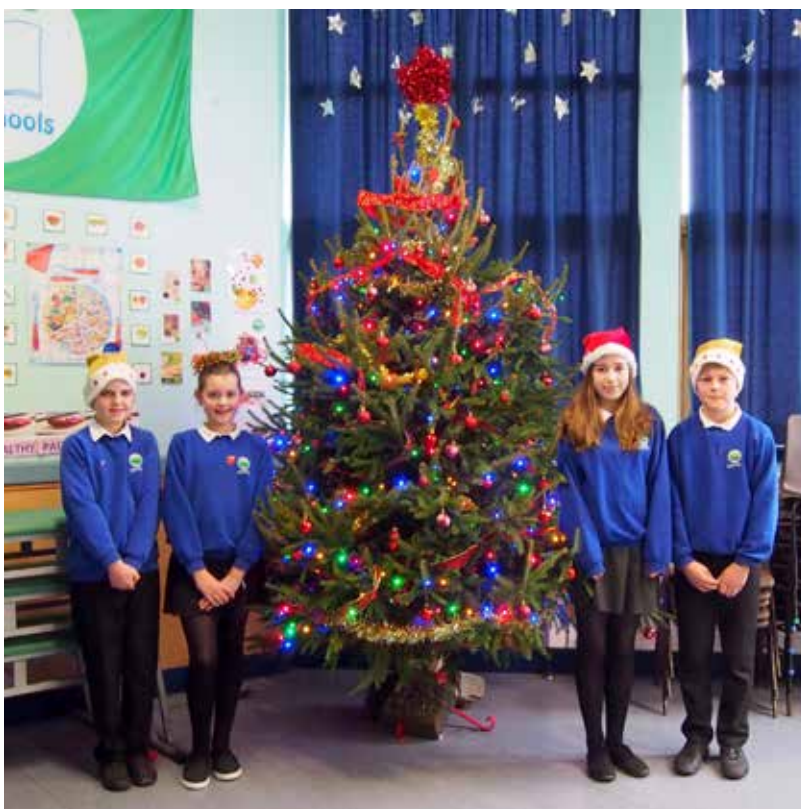
Head Boy and Girl and Deputy Head Boy and Girl with the 8ft tree kindly donated to the school by the Kilted Christmas Tree Co.

The Head of Fossoway School said: "We would like to thank Kilted Christmas Tree Company for their donation to the school and local community. We appreciate their ongoing association with school, and their future support in classes regarding enterprise and the