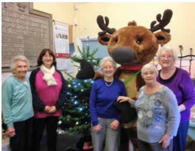
Dobbie the reindeer makes a visit to the Day Centre!