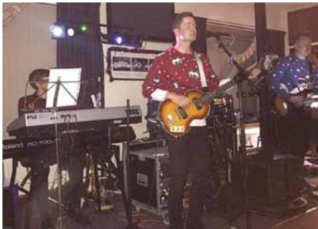
The band 'Top Table' played at the club Christmas Night

played previously, we would be delighted to see you at the KGV playing fields on Tuesday and Thursday evenings from 7pm.