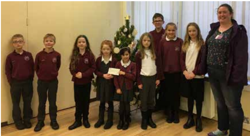
Pupil council of Portmoak Primary School and Broke Not Broken representative

Kinross High School donated a massive amount of food thanks to the co-ordination of all in Lomond House who helped collect food for their reverse advent calendars.