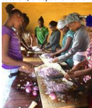
Preparing the feast to celebrate the official opening of the extension

The ceremony for the inauguration and blessing of the building was held on 3 March. What a day that was, with wide attendance from dignitaries, sisters from all over Ethiopia, plus all the local people who had worked so hard to make it their own. It was to be a whole day of singing, dancing, speeches and eating. The feeding of the 5000 comes to mind, although in truth it was only 1000. Quite a feat, when you consider no electricity, no huge ovens, and no official caterers, except the woman who was brought in to cook the specially slaughtered bull!