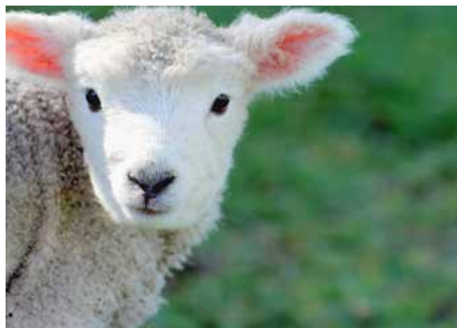
Organisers are calling for entries to the Central and West Fife show

Admission is £10 for adults and £5 for OAPs. Children under 14 have free entry. Parking is free.