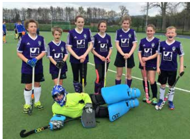
The U10 (left) and U14 (right) teams at the Midland District Tournament held at Kilgraston on 9 April