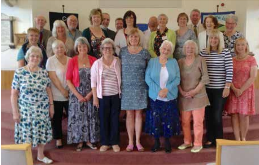
Kinross Parish Church Choir