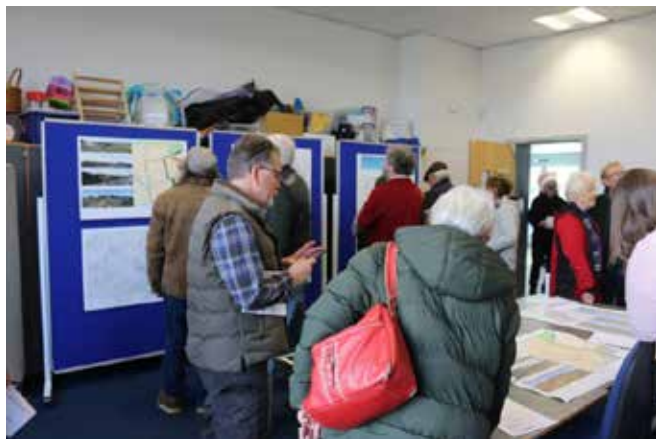
The public exhibitions on the Burleigh holiday park plans were well attended

Members of the public examined maps, drawings and display panels, which covered topics such as Concept, Vision, Land Use Considerations, Transport, Natural Heritage and Community Benefits.