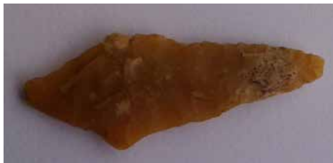
Early Neolithic Arrowhead found on St Serf's Island, Loch Leven