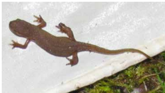
A Common Newt, perhaps a sign that efforts to restore the raised peat bog are working