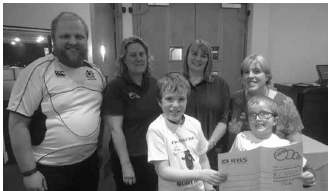
Meeting some of the families who will benefit from the donation to Funny Lumps

Our Annual Charity Comedy Night on 4 March in Milnathort Town Hall helped us to raise this fantastic donation for the charity Funny Lumps. We would like to say a big thank-you to all who came! We went along to a Funny Lumps social in Stirling on 8 April for the cheque presentation and met some of the families the money will benefit.