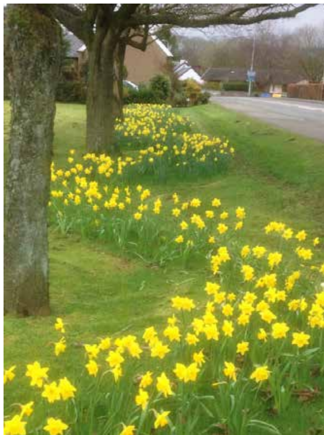
Some of the daffodils in the centre of Crook of Devon

As in Kinross, the daffodils have looked splendid this year, and we intend to extend them further this autumn.