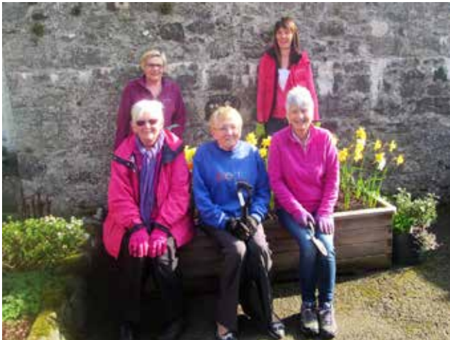
Kinnesswood in Bloom volunteers

Gardening work has continued with the older children in Portmoak Primary and, once again, vegetables have been planted in the raised beds. John and Rory had to do a few repairs to the raised beds this year. Meanwhile, Primary 1 to 3 are planning their own projects in the outdoors so watch this space.