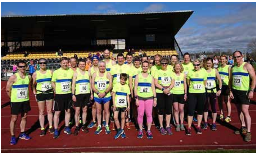
Kinross Road Runners out in force at Tay Ten, Perth

The club meets on Tuesdays at 7pm at Kirkgate and on Wednesdays at 6.45pm at the Medical Centre car park (or 7pm at the start of the run). There is also an informal run on Sunday mornings meeting at 9am at the Medical Centre . Our programme through May is detailed here. Check our website for more information.