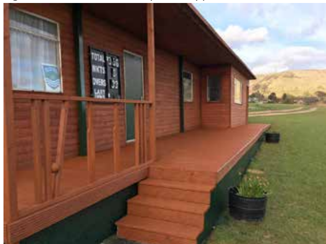
The extended and freshly painted pavilion looks fantastic

The upgrading works are now complete and the building looks fantastic. Many thanks to everyone who volunteered during this project and to local businesses Gutter 2 Glory and Ogilvie Ross for all their help and support.