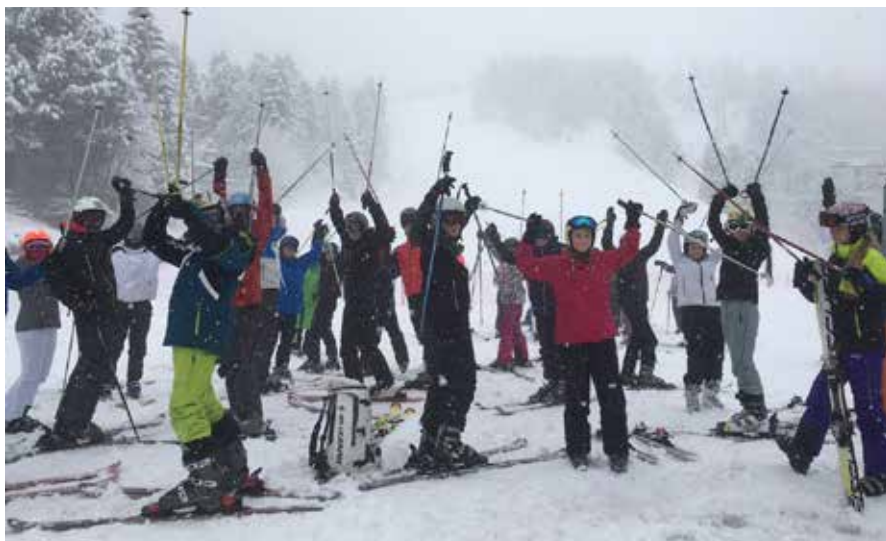
Fun on the slopes - the Kinross High School skiing trip