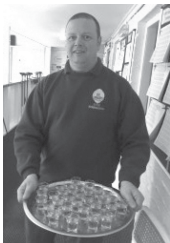
Half time fortification at the closing bonspiel

Plans for the 350th anniversary celebrations are moving forward, with a weekend date identified at the end of September 2018 for a major curling event.