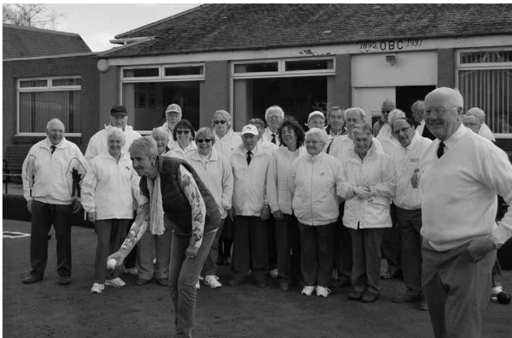
The President's wife delivers the first jack of the season as President and members look on

Green Avenue, Milnathort, KY13 8DL, telephone number 01577 863739. More information will be available on our website and look out for posters in the local shops.