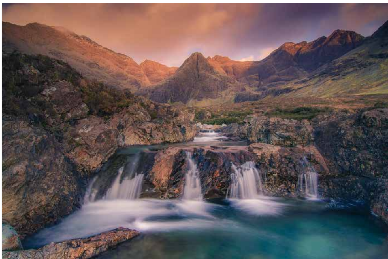
The so-called Fairy Pools on the Isle of Skye

It's worth noting that we continue to meet informally on Thursday evenings throughout the summer at various nearby locations to hone our photographic skills. Prospective new members are always welcome to come along.