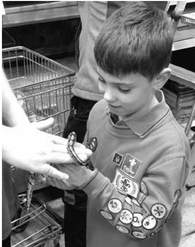
Visiting Pets at Home as part of the Animal Friends badge