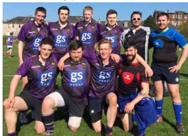
The Kinross Team at the sevens tournament at Leith RFC