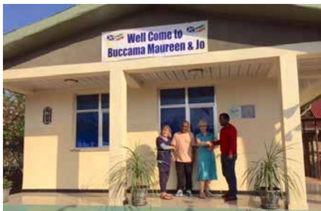
The new extension to the clinic

Our arrival in Buccama, a long, dusty, six-hour journey south, was a different matter altogether. Outriders met us at the sign for the clinic. Their horn beeping was the signal for the singing and dancing to start in earnest as they escorted us for our first sighting of the clinic extension, which EMP had proudly funded from our 2016 fund raising efforts.