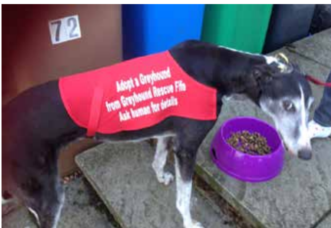
Maisie helps to spread the word about Greyhound Rescue Fife

Greyhound Rescue Fife are having their 10th Anniversary Dog Show on Sunday 14 May at Caldwell's Farm, Collessie, Fife, KY15 7UY. Doors open at 11am. Full details are on the Greyhound Rescue Fife website. The venue is indoors, so whatever the weather, please come along, we'd love meet you.