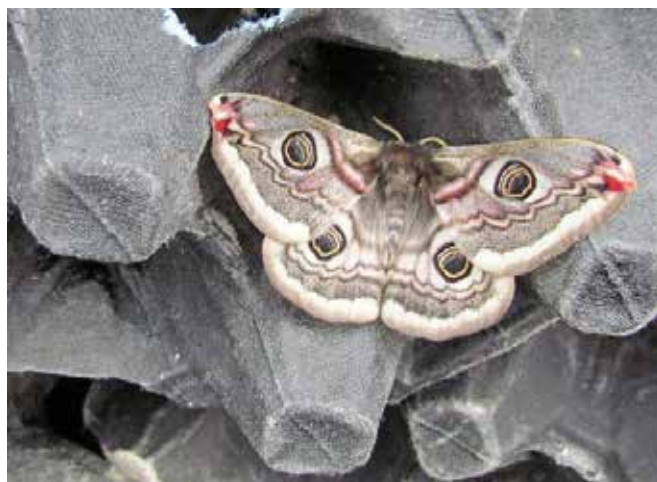
A rarely seen Emperor Moth