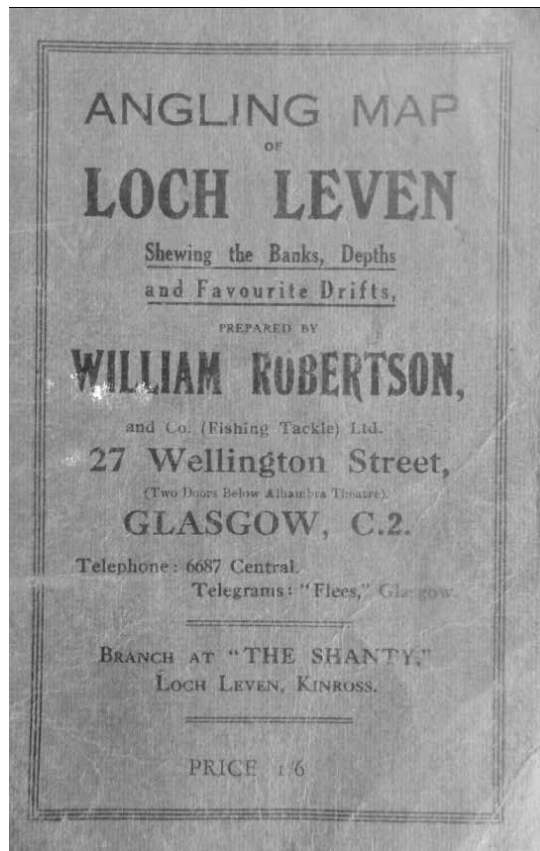
The Angling Map of Loch Leven recently gifted the Museum

To contact the Museum, visit the Study Room on Thursdays or Saturdays or e-mail information@kinrossmuseum.org.uk or find us on Facebook.