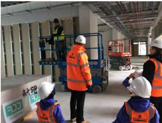
Lauriston children inspect the buildings under construction

We had a fabulous experience and would like to say a big "Thank You" to all at Robertson construction who made it possible.