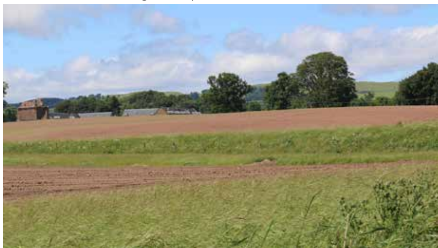
Looking north west to the possible location for 80-90 holiday chalets (top field). The strip of green grass across the middle of the photo is just below the foot and cycle path (former railway line) that runs from Auld Mart to the Burleigh Road.

"Given that construction has already begun on what could, over the next few years, be the building of 467 homes in Kinross and Milnathort, those services will surely be stretched to the limit." Members of the public interested in the development are encouraged to follow the website or Facebook pages of Milnathort, Kinross and Portmoak Community Councils for any further news.