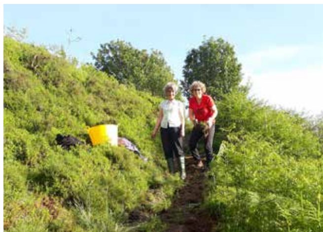
Volunteers helping to keep paths maintained in Portmoak

For more information, contact Tom Smith 01592 841160.