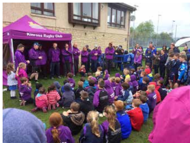
Kinross Rugby Club end of season awards

The minis section training resumes in August. Boys and girls in P1 to P7 (must be aged 5 or over) are welcome. We look forward to seeing you!