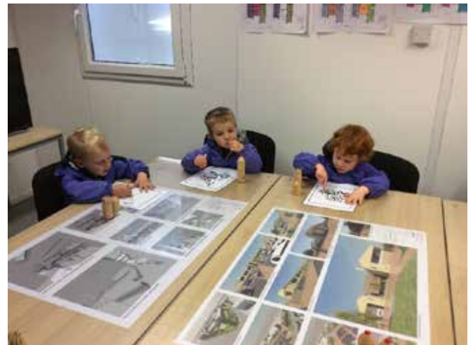
Planning for the future!