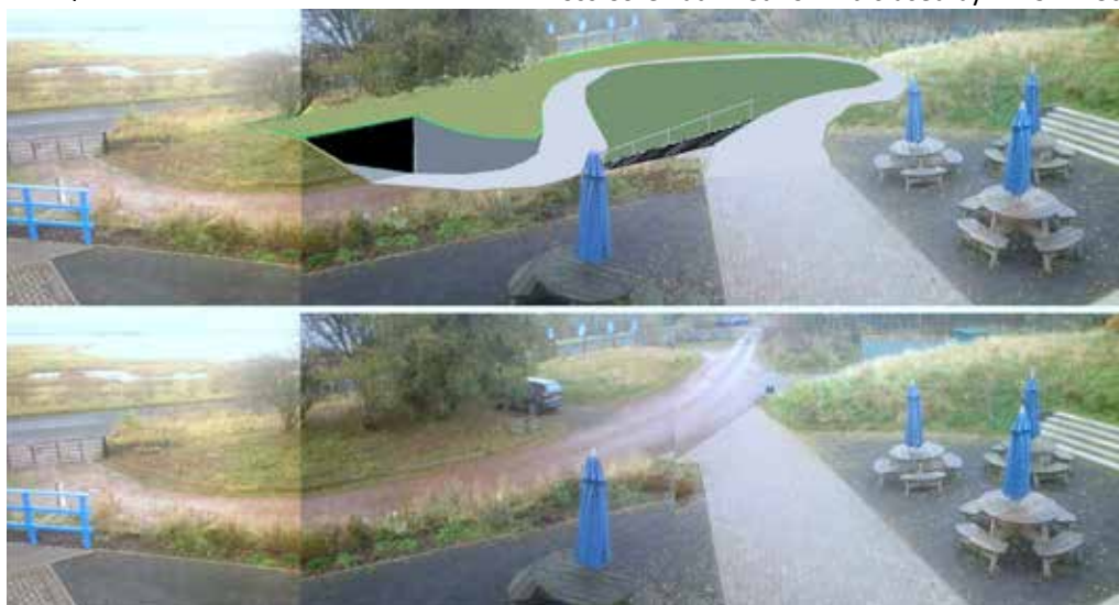
Upper image shows artist's impression of the proposed ramp and underpass (south side of the B9097) and, below, how the same area looks now

If you want to find out more about this project or if you want to comment or support the project, please visit the RSPB Scotland Loch Leven visitor centre or email uwe.stoneman@rspb.org.uk