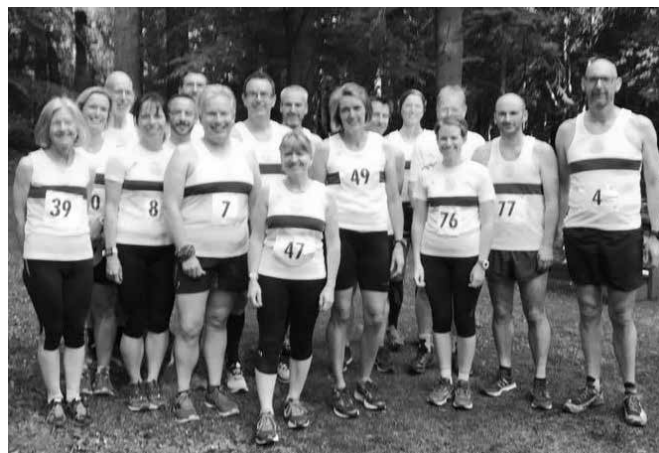
Kinross Road Runners at Templeton Trail Race

We've had a very good turnout for club training over the past month and it's great to see new faces. Our summer training programme continues. On Tuesday evenings the focus is on speed work based at Kirkgate Park; you work at your own pace and this is a good place to start for those new to running. On Wednesday evenings it's a varied programme of trail runs – some more hilly than others!