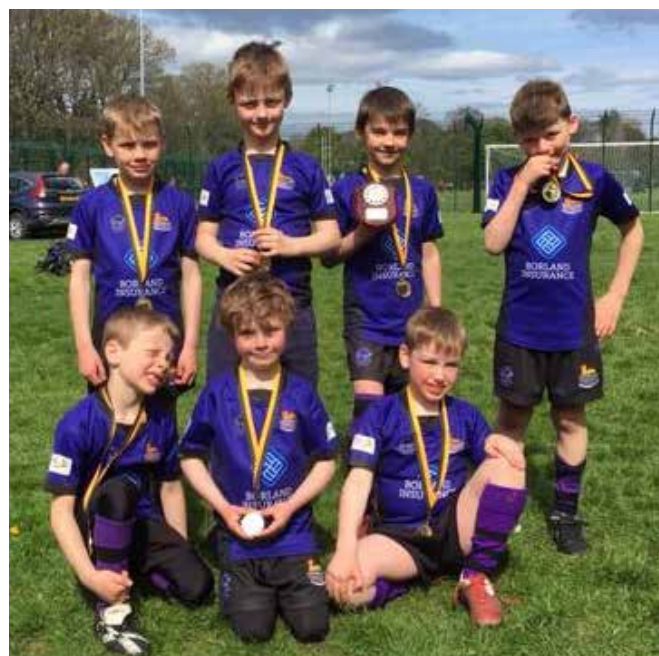
P3s at Currie

The end of season awards day took place on 20 May. Despite being a tad damp, there was a great turnout for the fun and games, BBQ and awards presentations.... not forgetting the traditional Parents v Kids games. The awards given were: