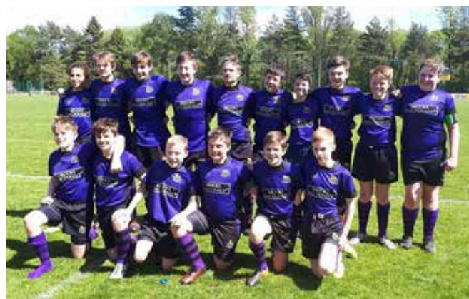
The Midis team