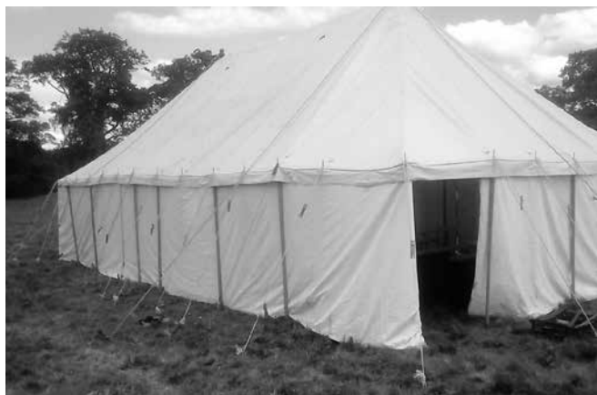
Marquee for hire

Our marquee tent is again in demand over the summer months and can be hired for any length of time on any grass surface within the local area for £200 per occasion. This includes delivery, erection, dismantling and removal. Contact Company Captain David Munro on 01577 862126 to make a booking.