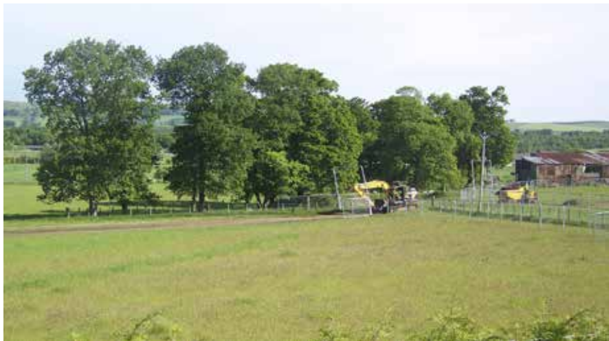
The stand of mature oak trees immediately west of Lathro Farm (taken from the south) taken from 107 Lathro Park

Local residents and community groups have written to Perth & Kinross Council to object to new planning applications for the Lathro Farm site, partly in an effort to save a group of mature oak trees that developers want to cut down to make way for houses.