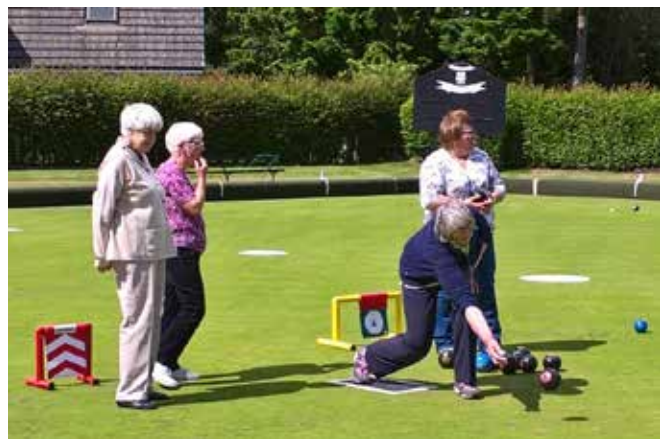
The 'Try Bowls' weekend proved very popular

Our 'try bowls' weekend resulted in 12 adults and seven children visiting our green and having a go at various targets. We hope everyone enjoyed the experience and will come along again. If anyone is interested in bowling and could not come to the try bowls event, they are welcome to contact the club or any member for information.