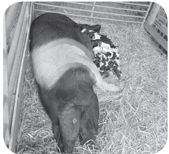
The 'motley crew' piglets