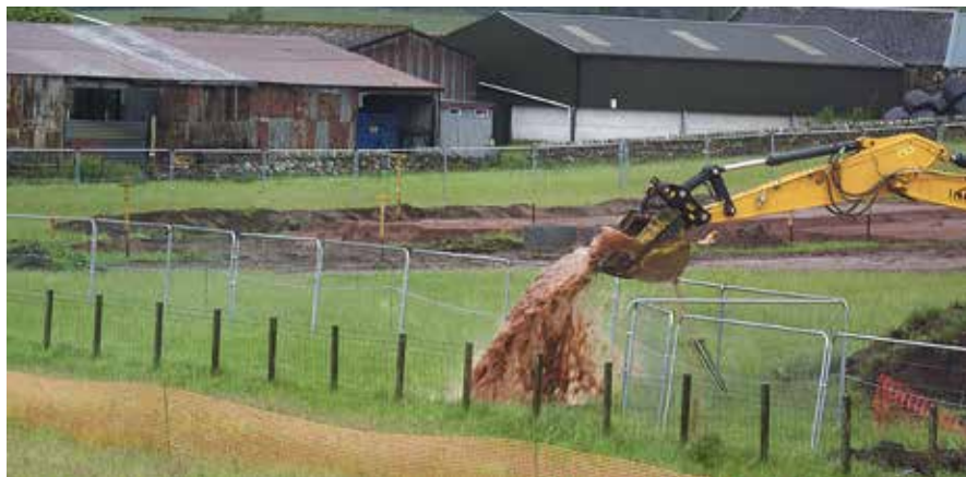
Using a JCB in an attempt to drain the groundwater from the trenches being dug for the drainage systems for Phase 1 at the end of Lathro Lane Photograph © Ken Whitcombe, taken from 107 Lathro Park

Another point made by objectors was that by splitting their proposed house-building into two applications, Springfield appeared to be attempting to avoid their development being classed as "major". Major developments, defined as 50 houses or more, have to go out to a wider range of consultees.