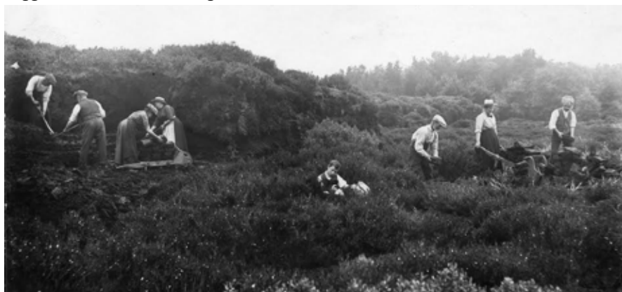
Peat casting, Portmoak Moss