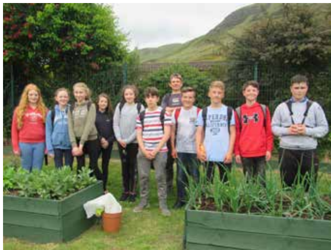
Some of the volunteers from Kinross High School

Sponsorship letters have been delivered through doors of Kinnesswood residents in June. The money raised is much appreciated. It is our main fundraiser of the year and helps us with plants, compost, paint and new tubs which enhance the village of Kinnesswood; 'Best Small Village in Scotland' last year.