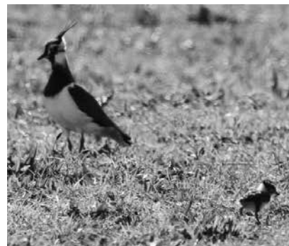
Lapwing chick