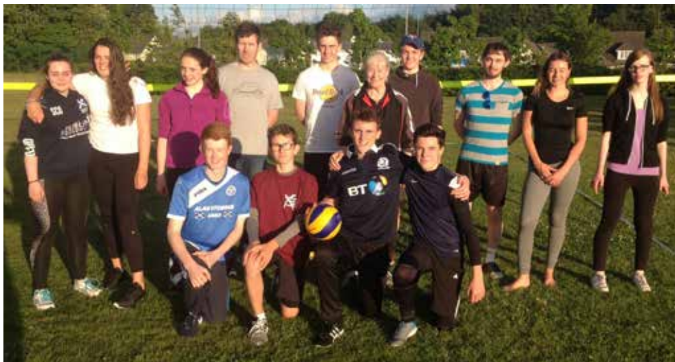
Some of the participants who enjoy free volleyball at the campus

Six senior boys from Kinross High School recently attended the two-day UK School Games