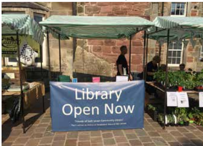
FOLLCL had a stall at the May Farmers' Market

A huge thank you to all who chatted with us and took the time to complete our questionnaire at the Kinross Farmers' Market in May. You gave us lots of great suggestions and ideas for future events – watch this space!