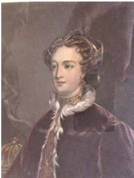
Mary Stuart