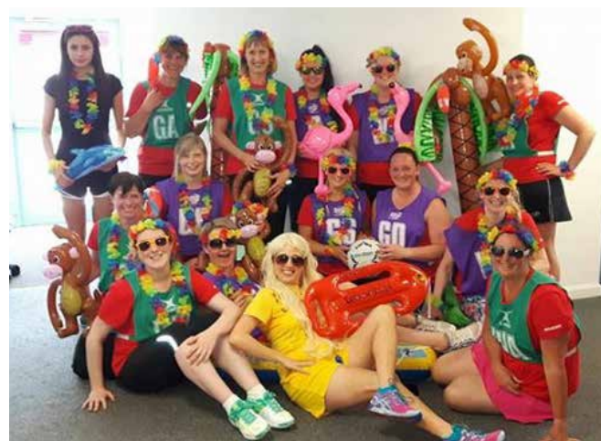
The Bounceback festival in Dundee

If you want to contact us, please do so either through our Facebook page or email us at kinrossnetball@hotmail.com