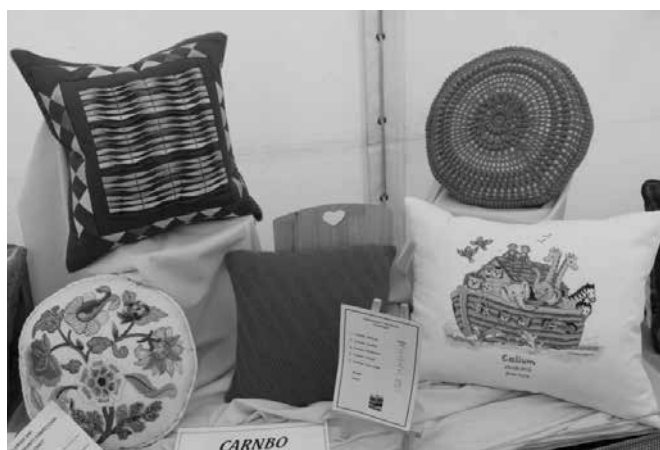
The SWIs will be displaying their craft creations at this year's Kinross Show (see page 18)

BISHOPSHIRE – Our June meeting was held a week earlier than usual as we enjoyed an outing to Lochgelly Theatre to see Mack and Mabel performed by Lochgelly and District Amateur Musical Association. We can highly recommend both the venue and LAMA, with many of our members intending to go again next year.