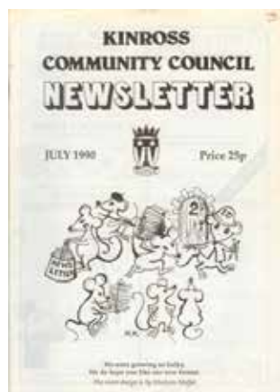
First A4 edition, July 1990

One of the reasons for the success of the Newsletter is that it filled a niche vacated when the last Kinross-shire-dedicated newspaper folded. The thin, broadsheet "Kinross-shire Advertiser", published since 1847, had been bought over by a Fife paper in 1970, and Kinross news was reduced to half a column.