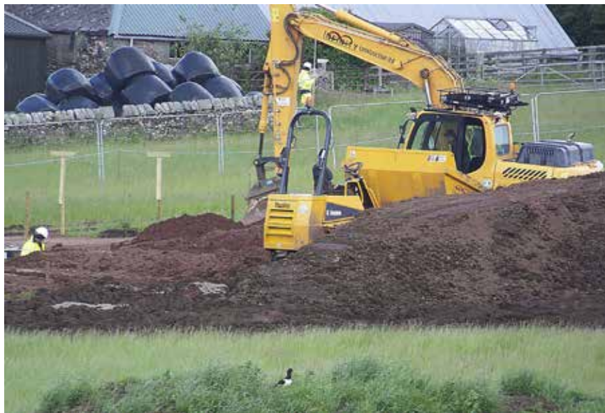
Centre, lower part of photo: An oystercatcher, one of a pair that previously nested in this field, watches the groundworks under way for phase 1

PKC's Biodiversity Officer had pointed out the correct procedure in his consultation response to the Persimmon application but senior planning officers