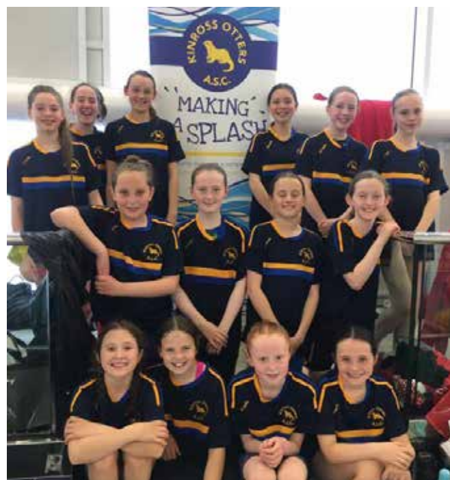
DCA 'Stars of the Future'