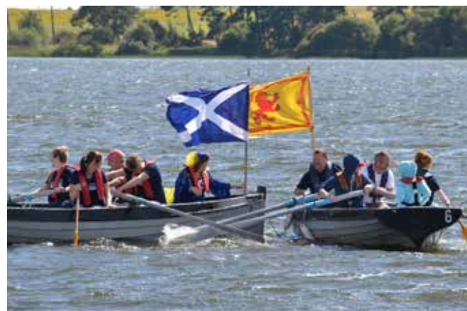
The boat race in full swing

No previous rowing experience is necessary, though it will help of course. It's not too strenuous an activity – each race lasts about 5 minutes on average. And Mary doesn't have to be female – 'she' just has to look the part!