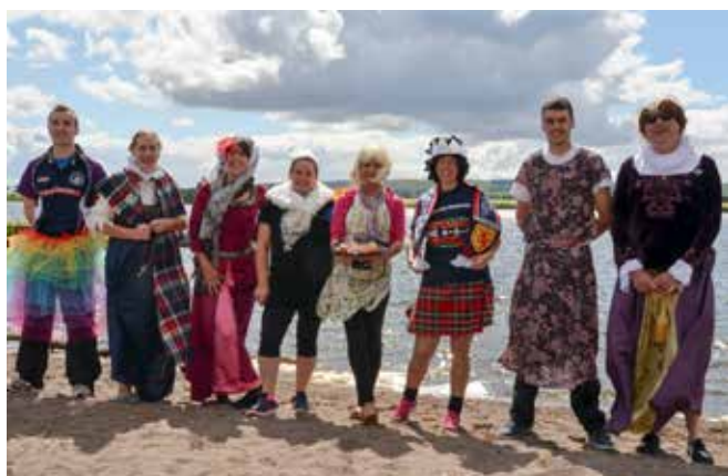
Some of the Marys

Our local festival celebrating The Great Escape from Loch Leven Castle is going to be on 1 September in Kirkgate Park. This year we plan to make it a bumper one! We're having a conversation with the organisers of the Solheim Cup at Gleneagles about getting support from them, since Mary is believed to be the first female golfer ever – see Wikipedia if you'd like to know more about her history. If successful we'll have a golfing Mary, golf activities for kids and a team from Gleneagles.