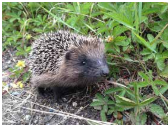
Where have all the hedgehogs gone?

We planted hedges of mixed native species which are now well established, and attract wild birds providing places to nest and hips and berries to feed on in the autumn. A bank of Cotoneaster horizontalis literally hums with bees and the dark and damp space beneath is a haven for toads. Birds are stacked up on the fruit trees waiting for their turn at the feeders and the buddleia, when in flower, are thick with butterflies.