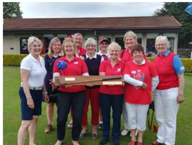
Kinross Ladies Solheim Cup Team USA

As it's Solheim Cup year at Gleneagles, Kinross and Milnathort agreed to adopt a Solheim Cup theme for their annual friendly 'Putter' match. Milnathort being the home team, were Team Europe, therefore Kinross were Team USA. Result: Kinross Ladies won the match 4.5-0.5 and are delighted to have won the Putter back!