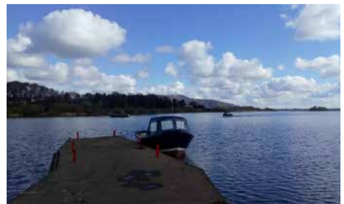
The Pier

Admission prices: Adult £9, Child £5.40, Conc £7.20. HS members free.