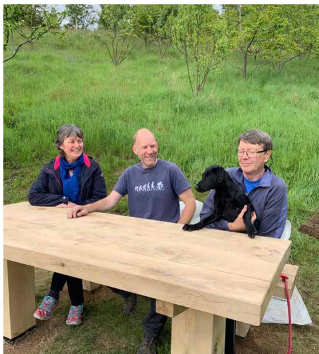
Table and bench seats in the Portmoak Community Orchard

You can also hear first-hand accounts of what we get up to by joining us at 7.30pm on the third Tuesday of the month in the Well Country Inn, Scotlandwell. Everyone is welcome.