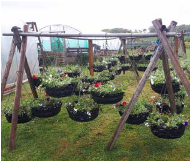
Hanging baskets ready to be deployed

We'd like to thank all the local businesses and individuals who have sponsored a basket, planter or one of the four tier planters. Without their generosity we would not be able to do the work we do.