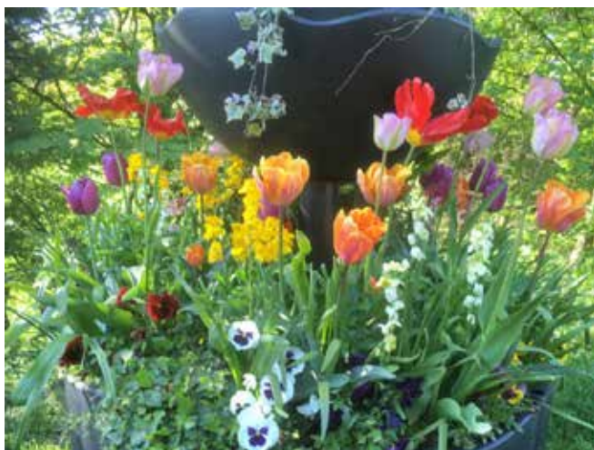
Tulip planters brighten up the village green

We do not have the facility to water all of the planters every day over the summer and would be very grateful if any local residents would like to 'adopt' one near their home. It would involve watering and dead heading the flowers. Please get in touch if you think you can help. Thanks to the local businesses who take care of tubs at their premises.