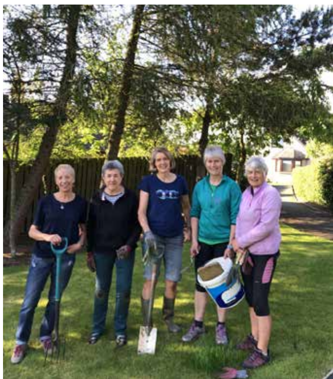
Teams have been working hard around Kinnesswood

Prepare the dip up to the point of baking up to four hours ahead. Keep covered in the fridge.