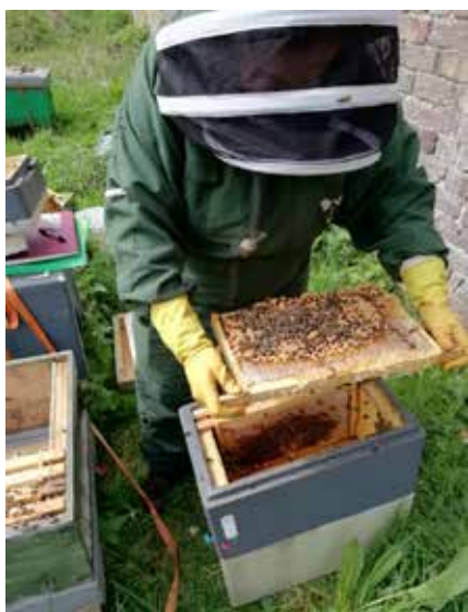
Bee-keeping at Cloverlea Apiaries

Sticky and delicious and good for you, honey is, as we know, created by bees using the nectar of flowering plants. The type of flower that the bee visits can affect the taste, smell and texture of the final product. And, as a swift glance at the shelves of any supermarket or health food emporium will demonstrate, the many different varieties of honey – those mysterious names such as manuka, acacia, clover and orange blossom – can be enough to confuse all but the most ardent of consumers.