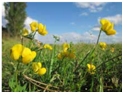
Birds-foot trefoil (Lotus corniculatus)

We'll be at Kinross show again this year. We will once again have the stall set up with activities for the children (and adults) and a chance to chat to us about anything Loch Leven NNR related.