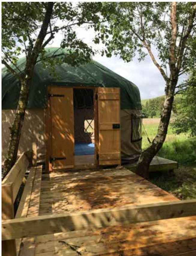
FossoPLAY has created a magical environment for children to explore

Initially, FossoPLAY will be open to children aged 3 to 5 years, but there are plans to extend this in time to a larger age group offering holiday clubs, after school clubs, and family sessions. For enquiries, call 07711 202436 or visit www.fossoplay.org .