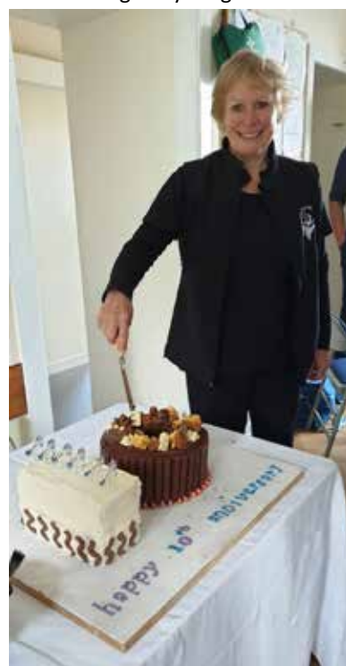
10-year-anniversary celebration cake