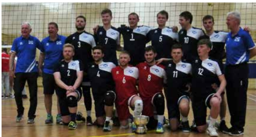
The winning Scotland men's squad with the Carol Russell trophy