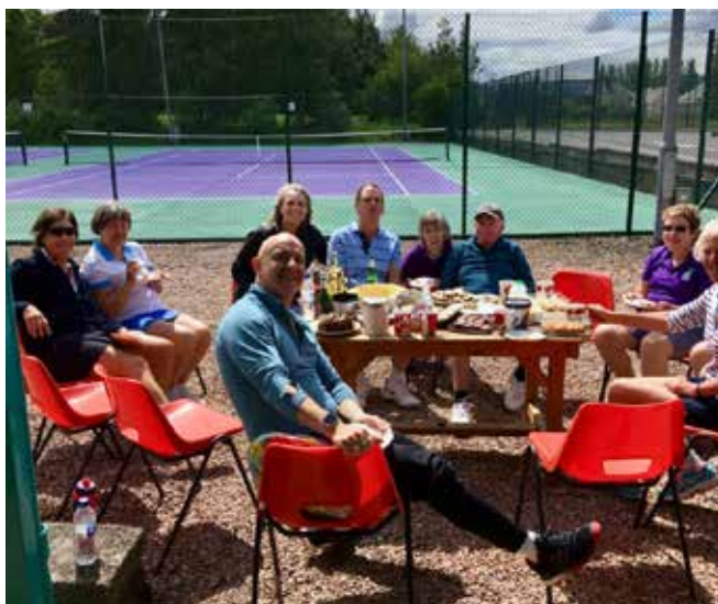
The Tennis Club is great for socialising!

Visitors are also welcome. Access is available from Sands the Ironmongers for a small fee.