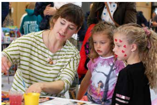
All the fun of the fayre!

We would like to thank all our donors for their generosity: