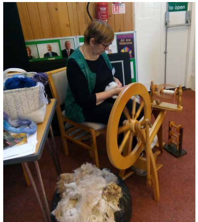
A demonstration of spinning