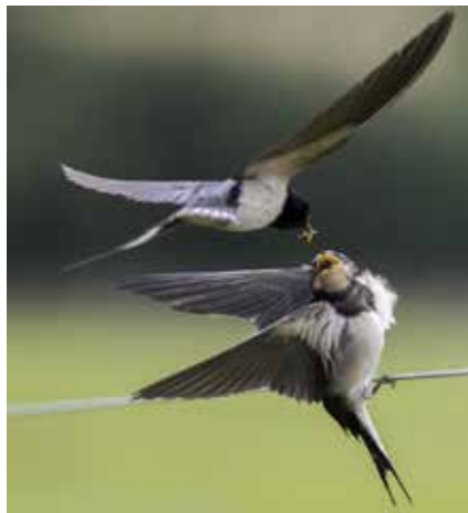
Swallows fly huge distances

There are still lapwings, oystercatchers and a pair of redshanks along the wetland trail with chicks being seen, with patience, amongst the long grass. There are also shelducks and their young swimming with their parents across the wetland pools. They are greatly out-numbered by the greylag goslings which have been growing at a tremendous rate.