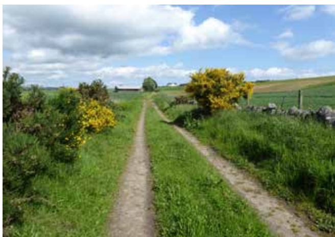
The Dryside Road Path

We are delighted to report that after many months (even years) of cajoling PKC, we now have the ancient Dryside Road route from Easter Balgeddie to Glenlomond and Glenvale signposted with a new gate installed to replace the old stile. This is designated as a core path and is part of an old 'right of way' stretching round the hill to Strathmiglo. It's a very scenic route with great views over Loch Leven as well as the green fields and slopes of Bishop Hill. Add this to your list of local walks. If you'd like to help maintain our local paths come along any Thursday or, for more information, contact Anne Macintyre on 07547 457046.