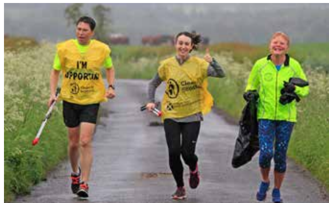
KRR 'Plogging': Jogging while picking up litter on the way!

As we write, preparations are well underway for our next club event – the ever-popular Milnathort Dash on Thursday 27 June, which takes in a scenic hilly route by Meikle Seggie and Tillyrie. In preparation for this, our regular Wednesday evening run earlier in June was a 'Plogging' session round the Dash route – that's jogging and picking up litter along the way. Sad to say that two large bin liners of roadside rubbish were collected on this five-mile route. Despite heavy rain, everyone enjoyed the session and felt it was worthwhile doing our bit to keep Kinross-shire beautiful. There's lots of races on at this time of year so the club training sessions are an important way to get 'race ready'