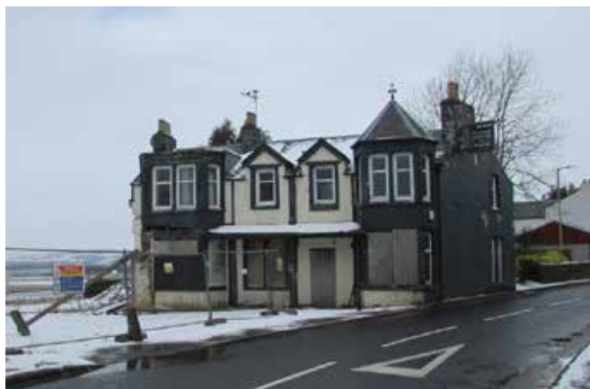
The Lomond Inn.

The Chairman welcomed all to this reconvened meeting of the CC and explained that the CC had to consider the two planning applications before it. It could object; make comment; or take no action. The CC then considered two documents: