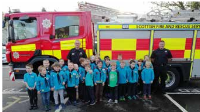
Beavers at Kinross Fire Station

The summer term is always a busy one for the beavers as they get outside and take advantage of the lighter evenings. At the beginning of May the beavers received a visit from the firefighters at Kinross Fire Station who very kindly came down to talk to them about fire safety and what their job involves. It was a very informative session for the beavers and they had great fun especially when they got to have a shot of the water hose!