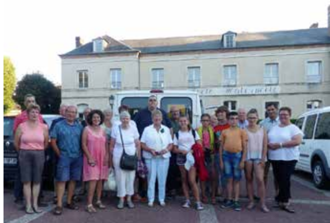
Last year's visit to Gacé

Thursday 8 August, 8am: Assemble at campus for departure to Gacé.