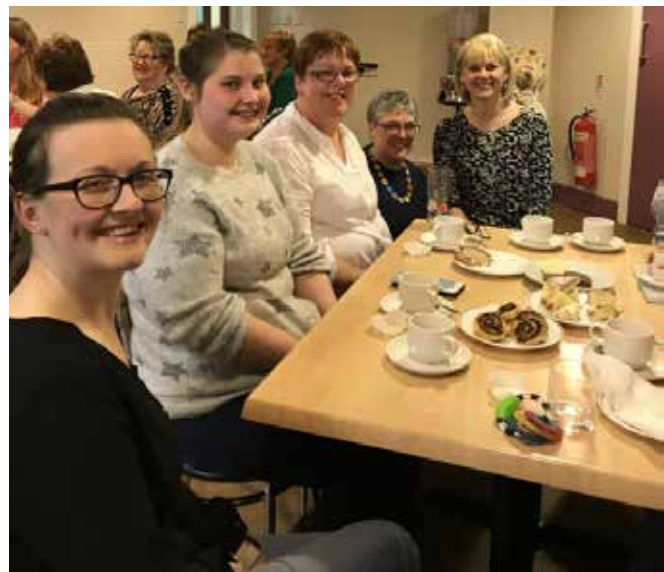
Loch Leven Lassies is one of many vibrant new groups forming all over Scotland

Please follow us on Facebook to see what we are up to, and please come along to our flexible and fun meetings if you can. You can contact us at lochlevenlassiesswi@gmail.com .