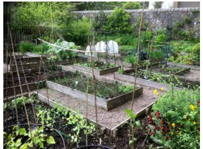
The Potager Garden vegetable beds

We are planning to update our website. We also hope to launch a new Facebook page for the garden. Please follow us and hear about the latest developments over the summer. For further information contact Amanda James by email at amandajames1577@gmail.com or on 07963 476803. You can also check out our website.