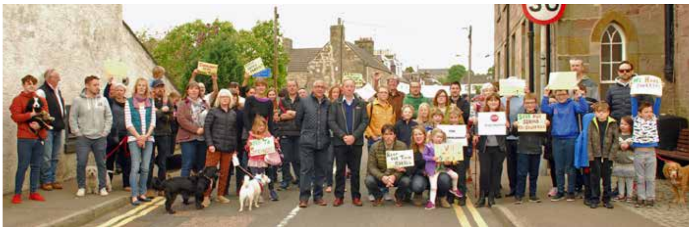
Some of the protesters pictured at the foot of Wester Loan, Milnathort.