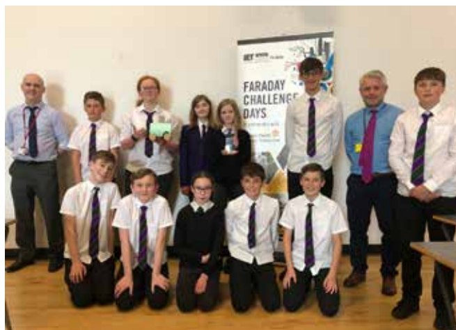
Winners of the Faraday Challenge 2019

Thank you to Anderson's of Kinross for supporting the three World Challenge teams who are travelling to South Africa, Mozambique and Swaziland. Over 30 pupils head off at the end of June for a life-changing experience helping communities on the African continent. We wish them the best of luck on this exciting venture and can't wait to hear all about it.