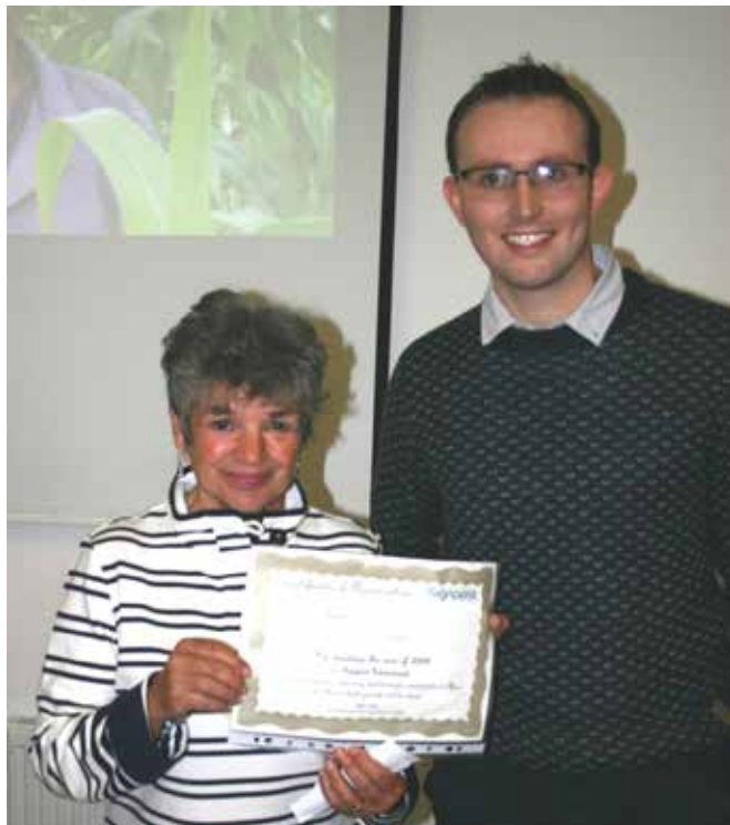
Presentation of £900 to Signpost International in April