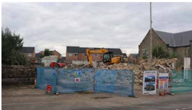
The Kirklands Garage site shortly after the sandstone manse was demolished on 4 June

The developers had submitted a new application for complete demolition, but demolished the building with a digger before this new application had even reached its deadline for comment.