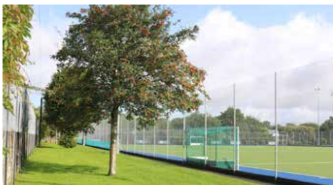
Some of the trees and green space at risk at KGV

This space is almost 9m wide by 97.5m long and consists mainly of grass where six mature trees grow. There is a 1.2m wide tarmac path alongside the hockey pitch fence.