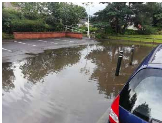
Recent flooding in Kinross: the only thing that needs the water is the greenspace; in urban landscapes, usually the highest ground

combined sewer overflows. A glance around the town and villages suggests the main opportunity is the green areas. Every patch of soft ground doesn't have to be a grass lawn or small grassy bank with standard bushes and shrubs. In new developments it could be ditched and designed to accept runoff directly from a car park. If kept shallow and allowed to grow tall emergent plants, such areas can happily get wet in the big rainstorms with no loss of amenity. Most of Kinross-shire is built on free-draining soils, so in some circumstances the base of excavated ‘raingardens’ will simply lose water harmlessly into the ground. In other circumstances (e.g. close to a building) a final connection to the drains (draining at a slow rate) would still be needed.