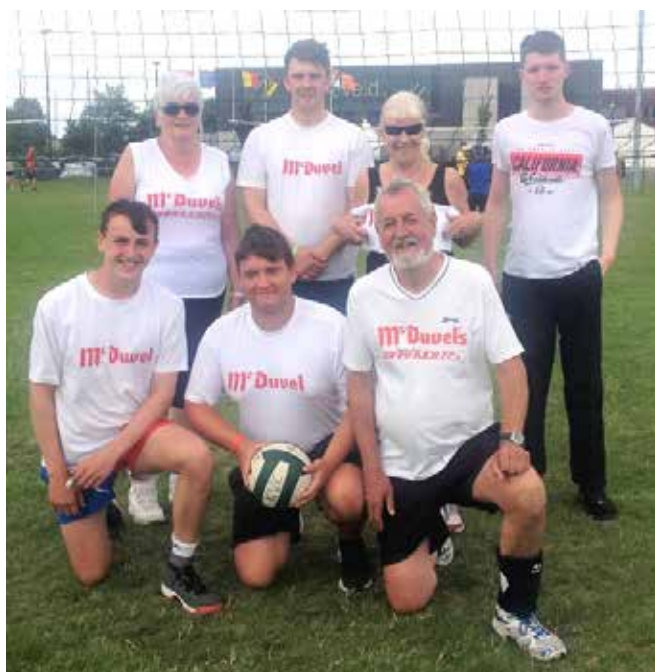
Kinross mixed team and the Kinross men's team

Indoor volleyball starts back at the campus on the first Monday of September. Sessions start at 8pm and finish at 9.45pm. Old and new members are welcome in preparation for the new season in the Perth and District Volleyball League. We compete at Premier League and Recreational League levels. Games are played at Bell's Sports Centre on Sunday evenings from 6-10pm.