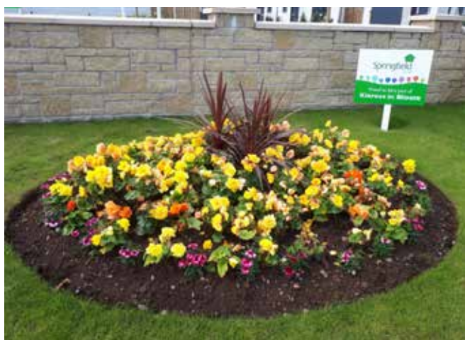
One of Kinross in Bloom's colourful flowerbeds

also been cleaned and repainted. The plaque for Lady Delia Montgomery has been placed on one of the planters at the Co-op Corner.