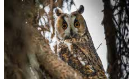
A long-eared owl

There have been a few incidents of vandalism around the reserve, especially damage to the screens that help protect our resident birds from disturbance. Most are happening around the Factory Hide and over £500 worth of damage has occurred during the summer. These incidents are being investigated by the police.