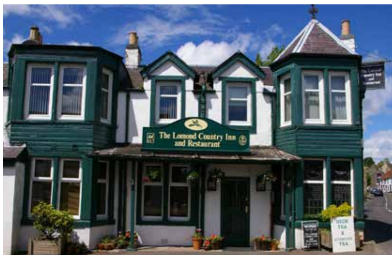
The Lomond Inn, June 2018

A spokesperson for Kinross-shire Civic Trust said: 'The existing original building is prominent within the Kinnesswood Conservation Area. An opportunity to restore this neglected property was an option, and we understand a committed developer could have achieved this, more satisfactory, outcome. However, once again, a key building of character will be lost to this community and in our opinion the replacement which has been approved will do nothing to enhance the character of the conservation area.'