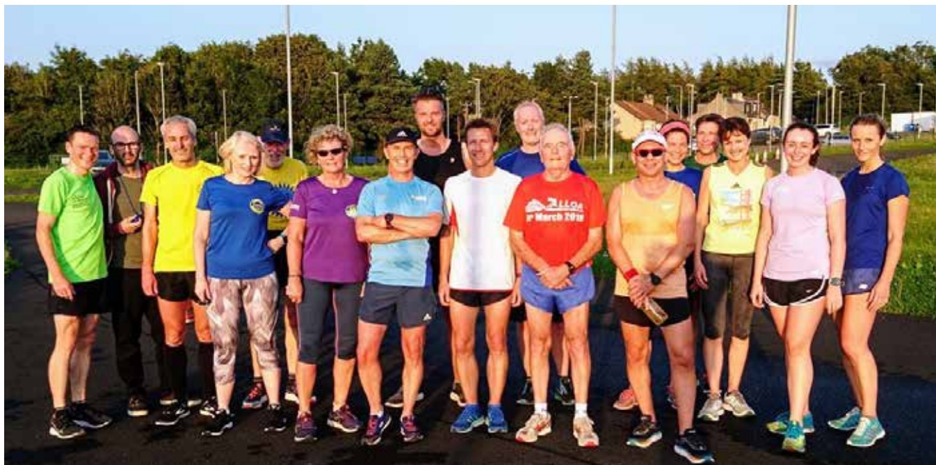
KRR at Balmullo Trail Race