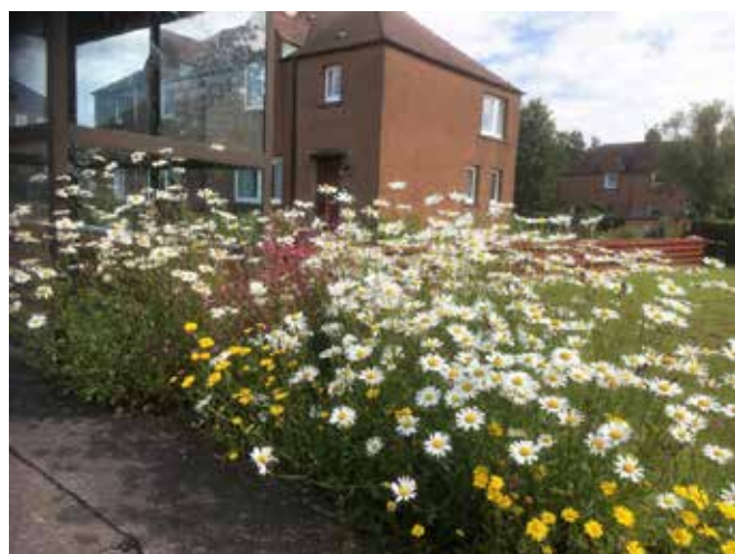
The Drum grass triangle

We have been particularly pleased with the wild flowers in areas such as the Drum grass triangle, inside the church yard, and at the bus stop by the green on the main road, which have continued flowering all over the summer. Flowers such as ox eye daisies and marjoram have attracted bumble and honey bees, and hoverflies, and also butterflies. The two buddleias