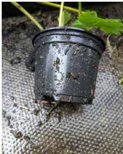
Pot with strawberry runner

cornflowers. There's still some heat in the ground, so they should germinate fairly quickly. Thin them out as they grow, and you have a head start on next year.