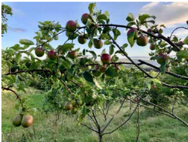
Portmoak Community Orchard, heaving with fruit!

While the grown-ups are guzzling tea and cakes there'll be activities for the kids. It's a free event but we appreciate donations for the refreshments, to help cover the costs of apple day and future events.