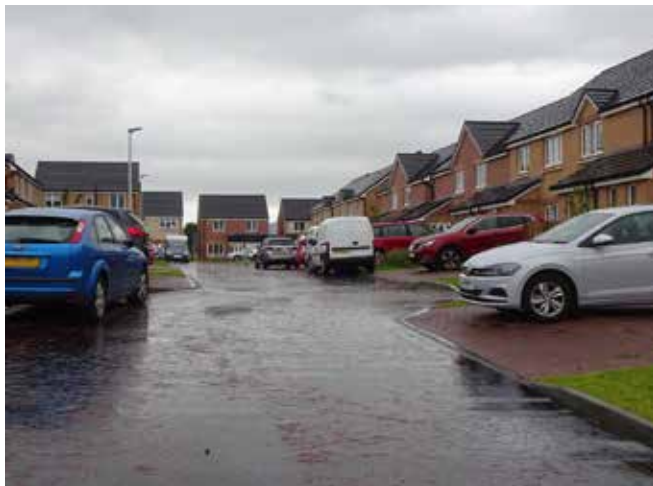
Most of Lathro Meadows phase 1 has no pavements, only 'service strips' which are unsuitable for prams and wheelchairs

Many and varied concerns have been expressed. These included: the high density of the development; the poor design of phase 1, which this proposal would replicate; the effects on local infrastructure; and the unsuitability of Gallowhill Road to act as another access road for the development.