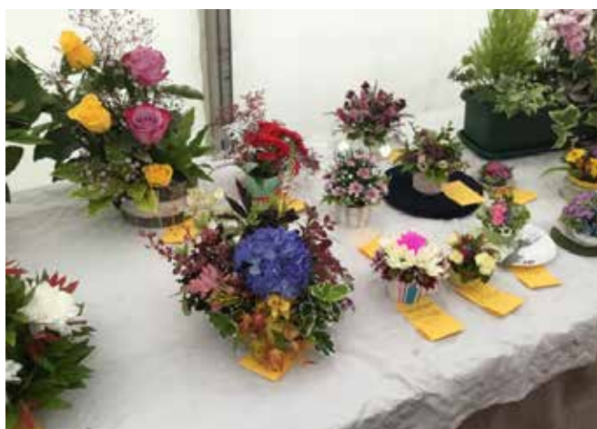
The prize-winning carnbo display at the (sadly cancelled) Kinross Show

Well done to all participants! Our first meeting back is 16 September at Carnbo Hall at 7.15pm. All welcome.