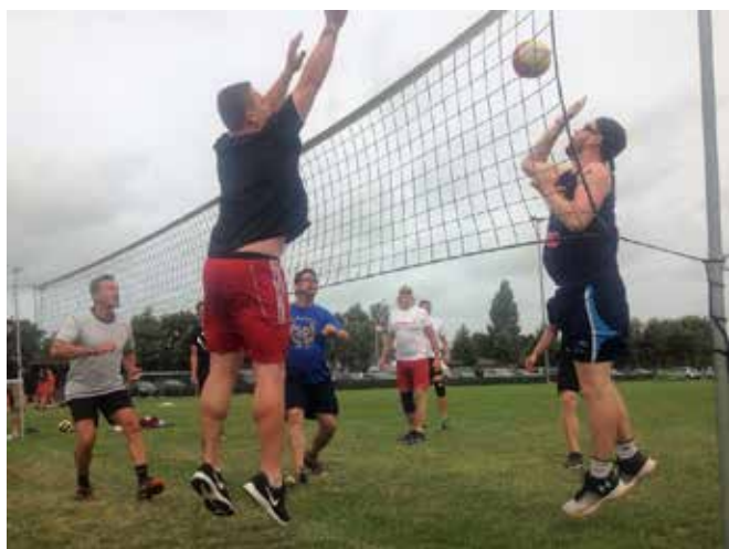
Action from Team Fife (left) versus Kinross (right)

They defeated a Dutch side at their final match on Saturday and finished third in their section.