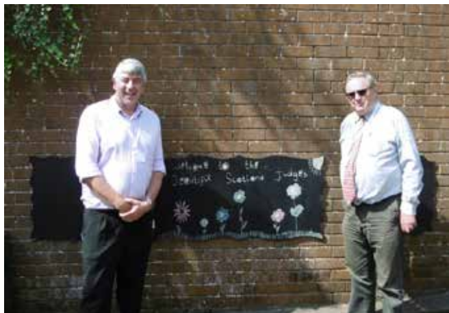
The judges from Beautiful Scotland enjoyed a rare rain-free day!