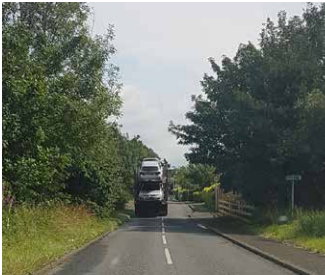
A large car transporter on Gallowhill Road