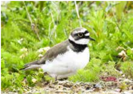
A little-ringed plover

Autumn is well underway. We've already had decent counts of teal and tufted duck, and geese will arrive shortly from Iceland. The dabbling ducks may struggle to get food if the water level remains so high. We've also had a few interesting visitors to the reserve. A marsh harrier, garganey, long-eared owl and little-ringed plover have been spotted around the reserve in recent weeks.