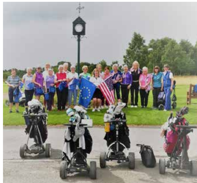
Kinross Ladies at Strathmore Golf Centre

Team Europe won the overall match by five games to four. Fingers crossed it's an ominous sign for the Solheim Cup at Gleneagles in September!