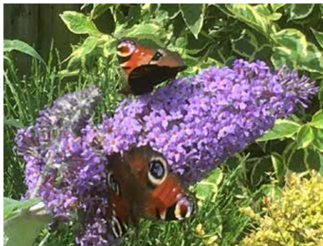
Buddleias attract all manner of butterflies!