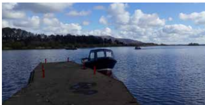
The Pier

26 March to 30 September: Daily, 10am to last outward sailing at 4.15pm. 1-31 October: Daily, 10am to last outward sailing at 3.15pm. Admission prices: Adult £9, Child £5.40, (includes ferry trip) Conc £7.20. HS members free.