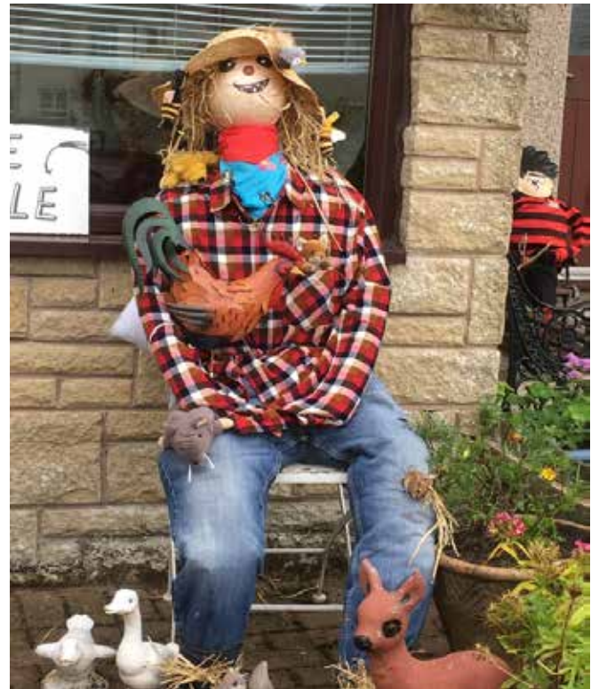
Scarecrow competition winners