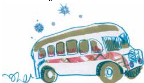
The Blether Bus....The bus tour is back again this year! Illustrator: Esther Kent

The Blether Bus , a bus tour on Sun 24 Nov with stories around Loch Leven (11am and 2pm), bus leaves from campus, £10. For more crime and mystery events keep an eye on the KLEO website www.kleo.org.uk