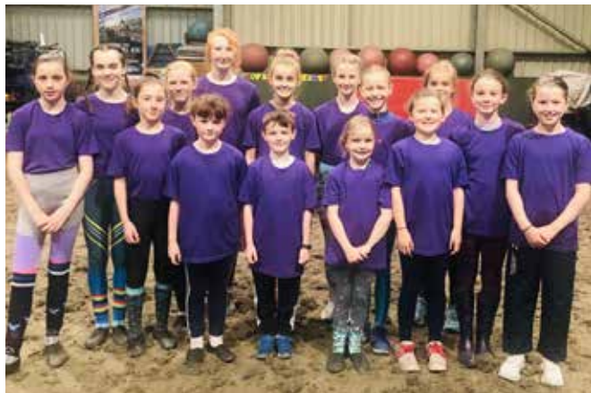
Vaulting Camp crew 2019